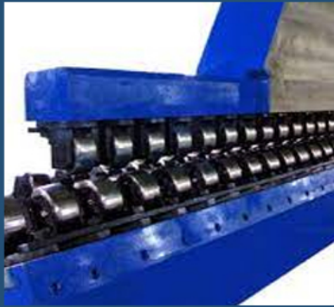
Pipe Forming Machine

Weight : 100-1000kg Color : Black, Blue Voltage : 110V, 440V Condition : New Driven Type : Electric