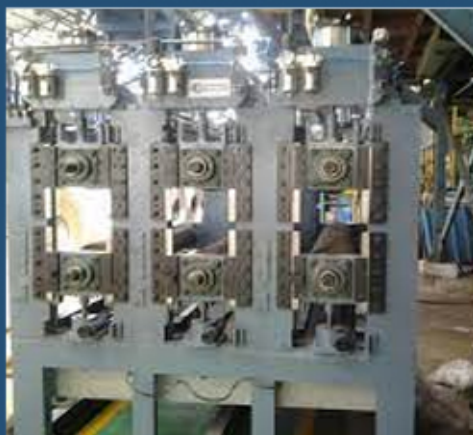
Squeeze Roll Assembly

We are a well-known Squeeze Roll Assembly Manufacturer and Supplier in India. The Squeeze Roll Assembly offered by us is highly acclaimed for features like robust construction, low power consumption, long functional life, low maintenance and more.