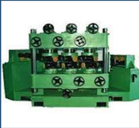
Pipe and Tube Straightening Machine