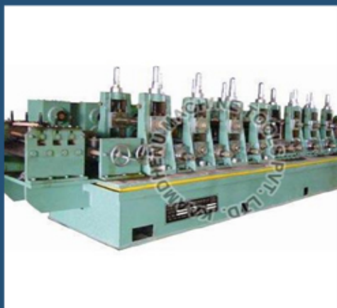
ERW Tube Mill

Weight : 100-1000kg Color : Black, Blue Voltage : 110V, 440V Condition : New Driven Type : Electric