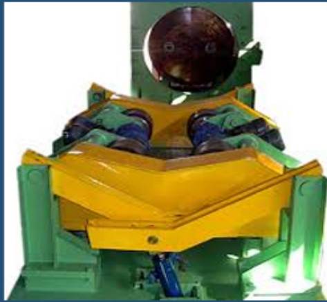
Pipe End Beveling Machine