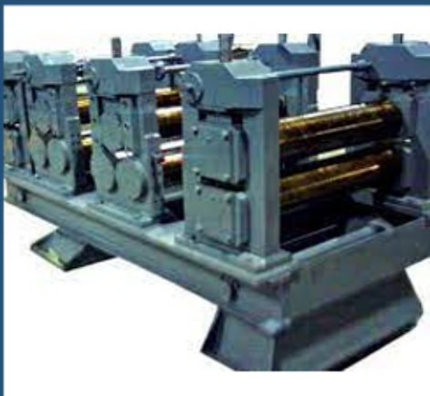
Pinch Roll Leveller

The assembly of Pinch Roll Leveller can be used to guide the strips / sheets wherever required. The Pinch Roll Leveller Assembly offered by us has a different combination of pinch roll leveler with drive and non-drive options.