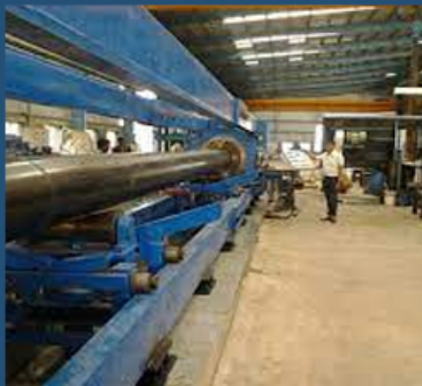
Pipe Hydro Testing Machine