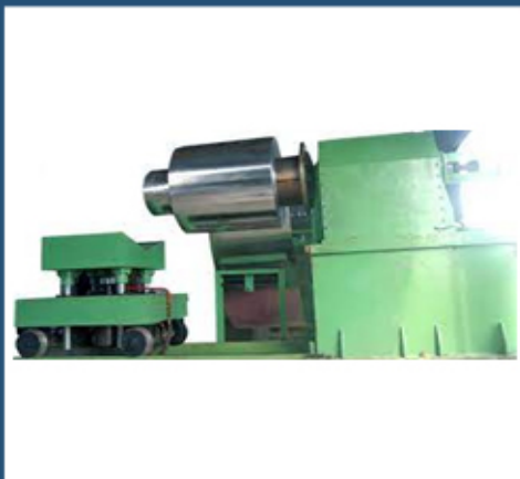
Hydraulic Coil Car

The Hydraulic Coil Car comes with heavy duty fabricated structure which is precisely designed. The Hydraulic Coil Car offered by us has a capacity of maximum 25 ton of coil weight and maximum 1800 wide.