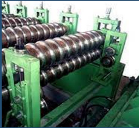
Roll Forming Mill