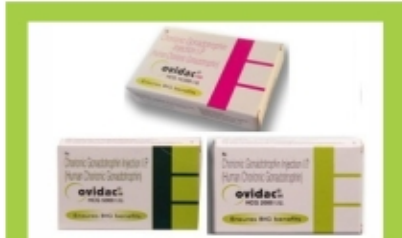
Ovidac 5000 IU

Demega formulations India is involved in offering excellent quality HCG (human chorionic gonadotropins) Injections to our most valued clients, Human chorionic gonadotropin (HCG) is given as an injection under the skin or into a muscle. Our offered HCG Injections are widely appreciated by our clients which are situated all round the world.