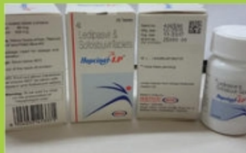
Hepcinat / Hepcinat Lp