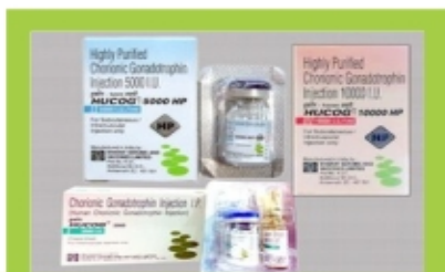
Hucog 5000 IU