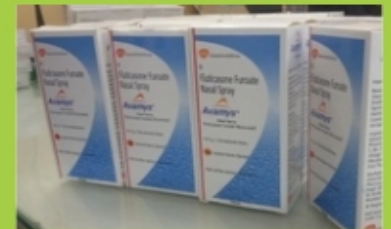
Avamys nasal Spray