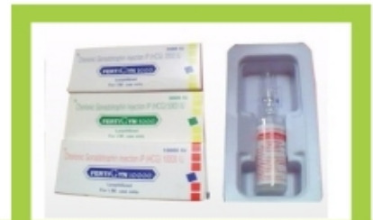
Fertigyn 5000 IU