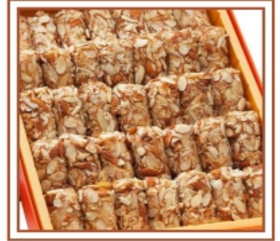
BADAM BUTTERSCOTCH ROLL