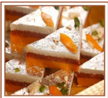
KAJU GULKAND BURFI