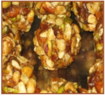
DRY FRUIT LADDU