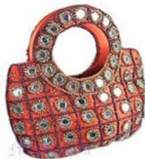
Silk Embroided Hand Bag