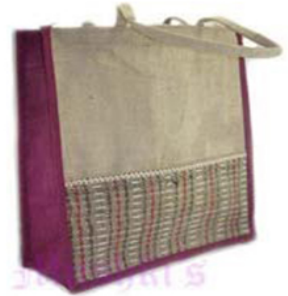
Handmade Jute Bags