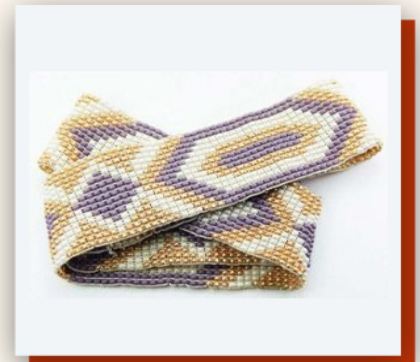
Beaded Stretchable Headbands