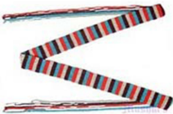
Beaded Fashion Belts