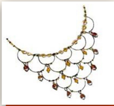
Designer Beaded Necklace