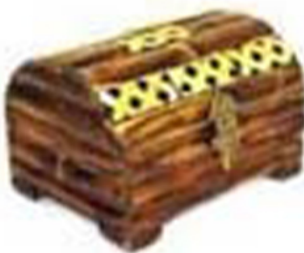
Wooden Pill Box