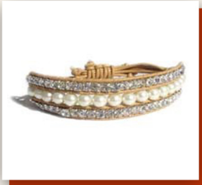
Glass Stone Bracelets