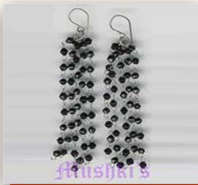
Long Fashion Earrings