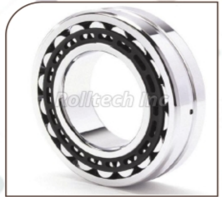
Spherical Roller Bearings