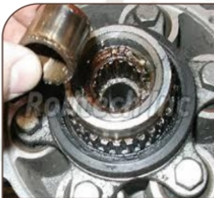
Bearing Repair and Refurbishment