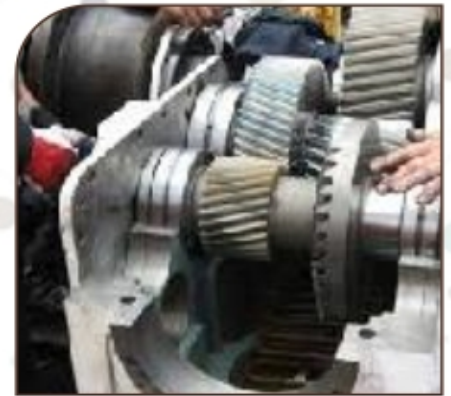
Gearbox Repair & Refurbishment