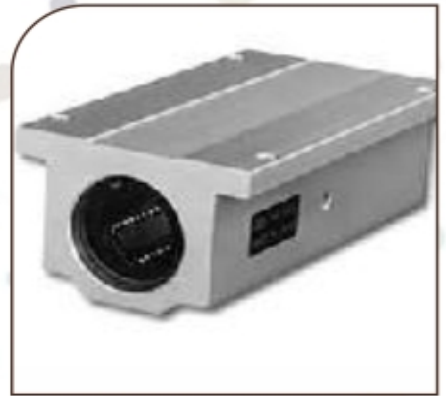
Linear Bearing Blocks