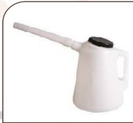
Oil Measuring Jug