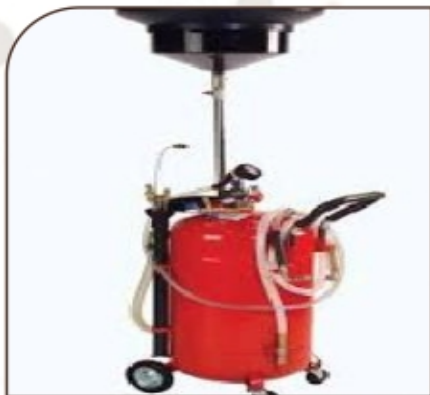
Waste Oil Drainer