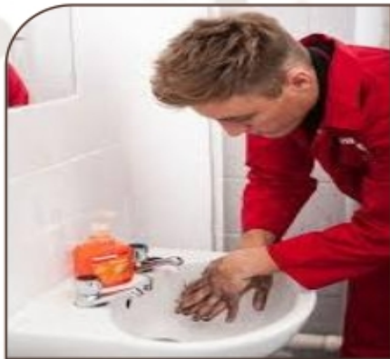
Oil & Grease Hand Cleaner