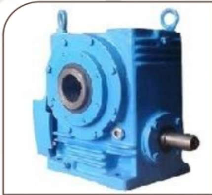
Power Transmission Gearbox