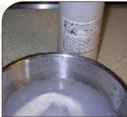
De Gumming Cleaner