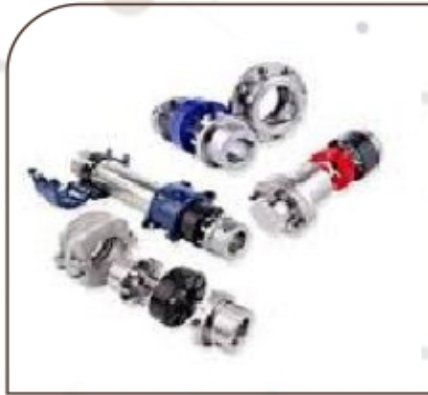
Quick Flex Couplings