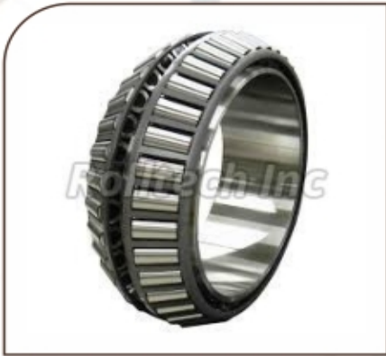
Taper Roller Bearings