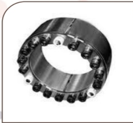
Tollok Locking Device