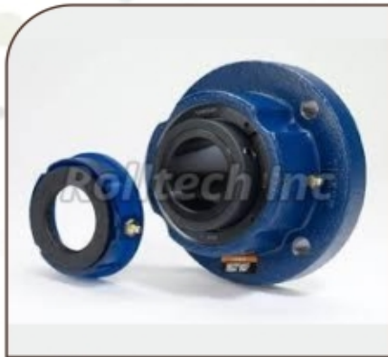
Spherical Roller Bearing Housing Unit