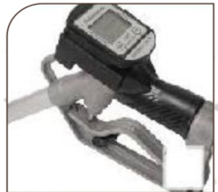
Fuel Nozzle With Meter