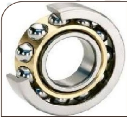
Angular Ball Bearings