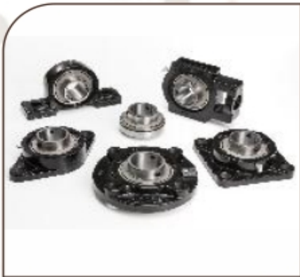
Ball Bearing Housing Unit