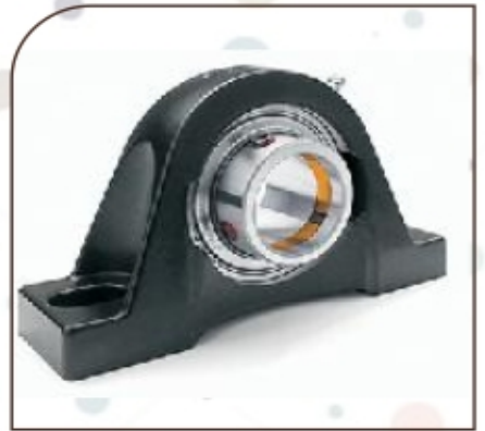
Fafnir Shaft Guard Bearing Housing Unit