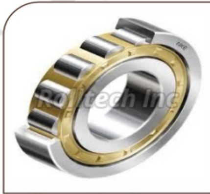
Cylindrical Roller Bearings