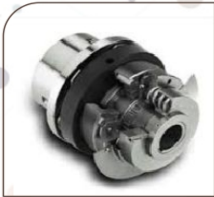
Autogard Torque Limiter