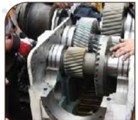
Gearbox Repair & Refurbishment