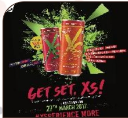
250 ml XS Energy Drink