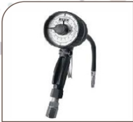
Oil Meter Gun