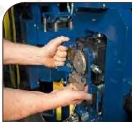
Chock Repair & Refurbishment