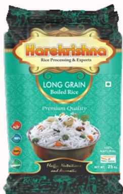
Harekrishna Long Grain Boiled Rice