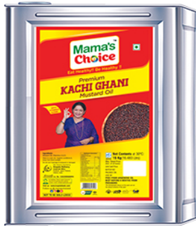
Kachi Ghani Mustard Oil