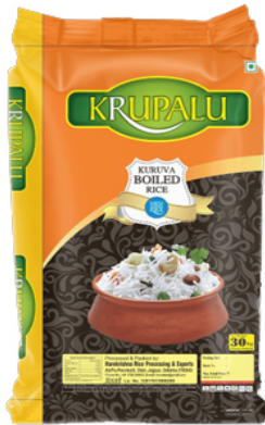
Krupalu Kuruva Boiled Rice