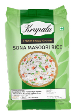
Krupalu Sona Masoori Rice