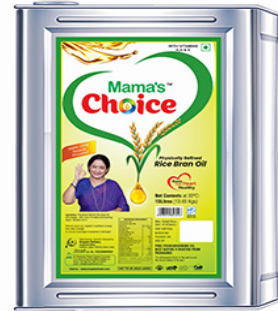
Rice Bran Oil