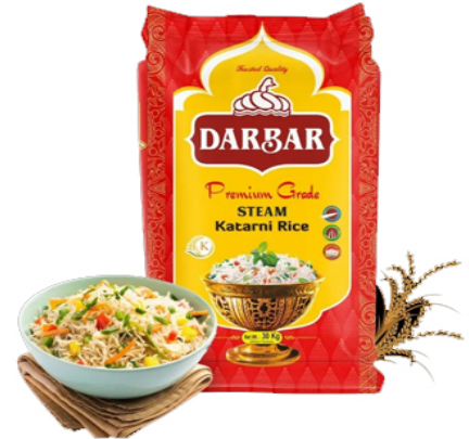
Darbar Katarni Steam Rice