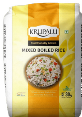
Krupalu Mixed Boiled Rice