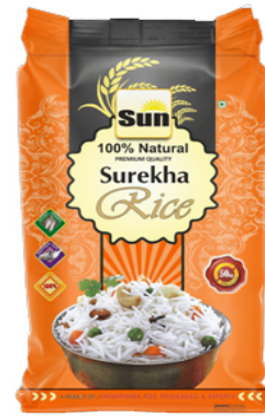
Sun Surekha Rice