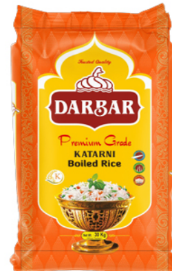
Darbar Katarni Boiled Rice