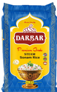
Darbar Sonam Steam Rice