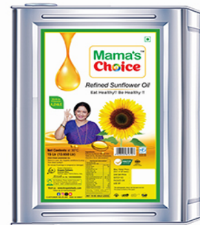
Refined Sunflower Oil