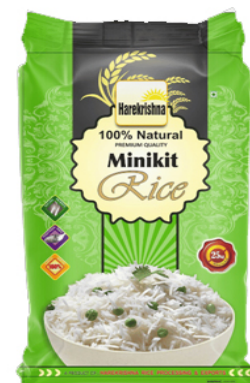
Harekrishna Minikit Boiled Rice