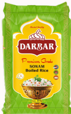
Darbar Sonam Boiled Rice