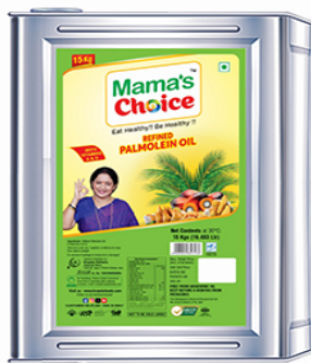
Refined Palmolein Oil