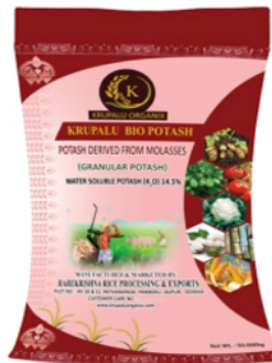
Krupalu Bio Potash