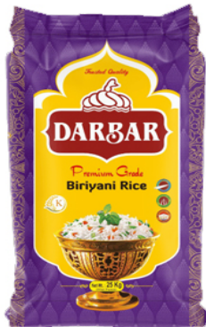
Darbar Biryani Steam/Boiled Rice