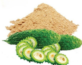
Natura Ayur Bitter Melon Extract Powder