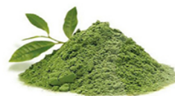
Natura Ayur Green Tea Extract Powder