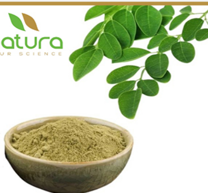
Natura Ayur Moringa Extract Powder