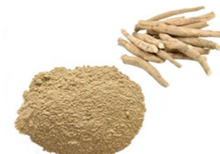
Natura Ayur Ashwagandha Extract Powder