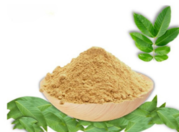
Natura Ayur Banaba Extract Powder