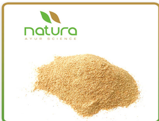
Natura Ayur Fenugreek Seed Powder