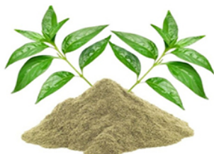
Natura Ayur Andrographis Extract Powder