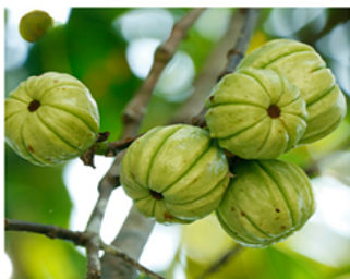
Natura Ayur Garcinia Extract Powder