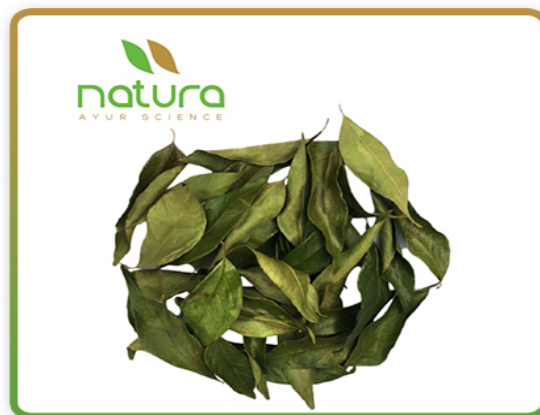
Natura Ayur Dried Curry Leaves