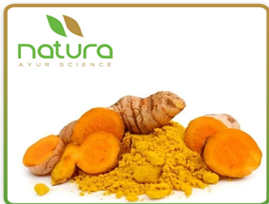
Natura Ayur Turmeric Extract Powder