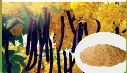
Natura Ayur Cassia Fistula Extract Powder