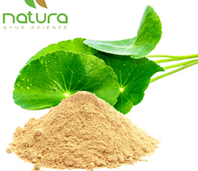
Natura Ayur Centella Extract Powder