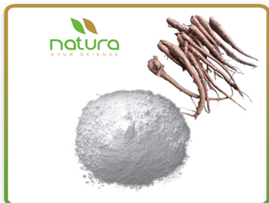
Natura Ayur Coleus Extract Powder