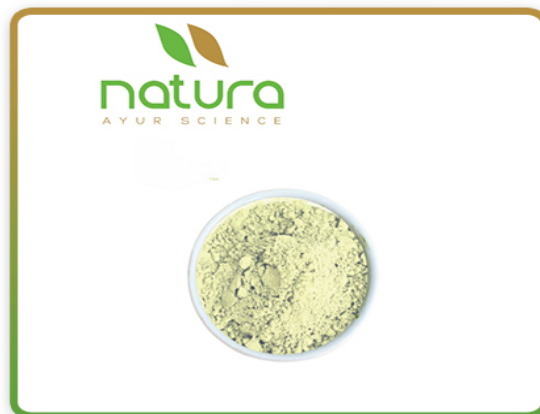
White Kidney Bean Extract Powder