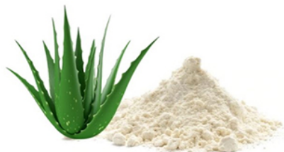
Natura Ayur Aloe Vera Extract Powder