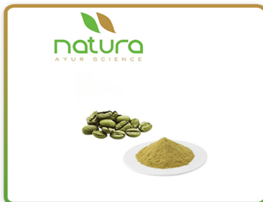
Natura Ayur Coffee Bean Extract Powder