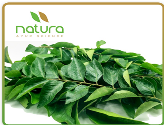
Natura Ayur Fresh Curry Leaves