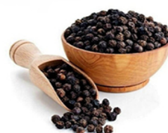
Natura Ayur Black Pepper Extract Powder