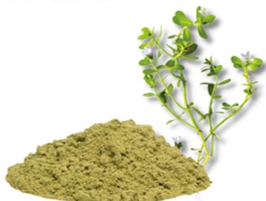
Natura Ayur Bacopa Extract Powder