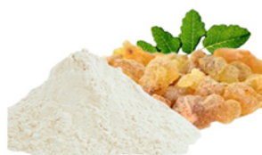
Natura Ayur Boswellia Extract Powder