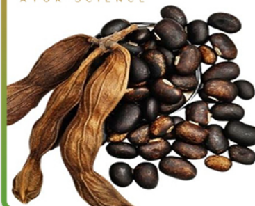
Natura Ayur Mucuna Extract Powder