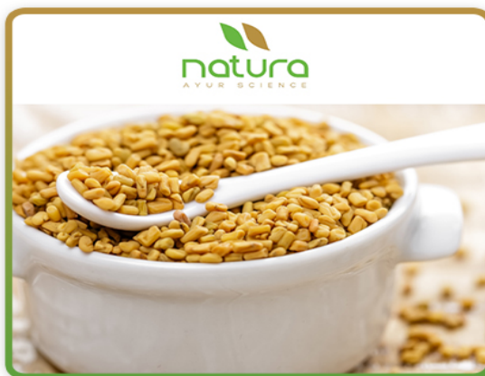
Natura Ayur Fenugreek Seed