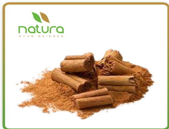
Natura Ayur Cinnamon Extract Powder