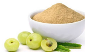
Natura Ayur Amla Extract Powder