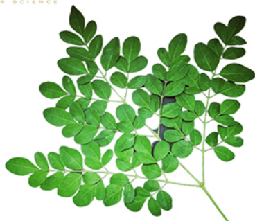
Natura Ayur Moringa Leaf Powder