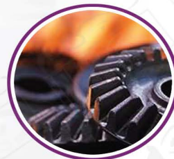
HEAT TREATMENT OIL (QUENCHING OIL)