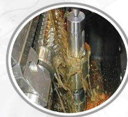
MACHINERY & TOOLWAY OIL