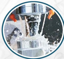
METAL WORKING FLUID