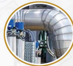
HEAT TRANSFER OIL (THERMIC FLUID)