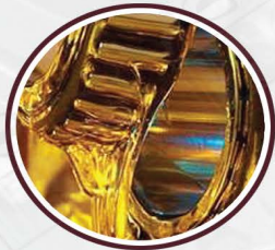
BEARING AND CIRCULATING OILS

Industrial lubricants play a crucial role in ensuring the smooth operation of machinery and equipment in various industries. They are specially formulated fluids or greases used to reduce friction, wear, and overheating between mechanical parts that are in contact with each other. Here's a comprehensive overview of industrial lubricants: