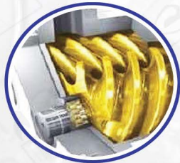
COMPRESSOR OIL (REFRIGERATION OIL)