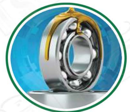
RUST PREVENTIVE OIL