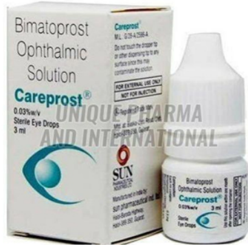
BIMATOPROST OPHTHALMIC EYE DROP