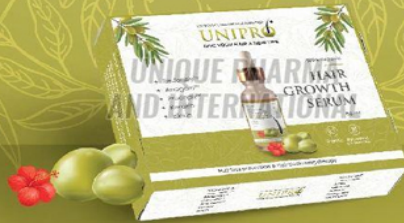
UNIPRO HAIR GROWTH SERUM