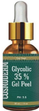
GLYCOLIC 35% GEL PEEL ESSENTIAL OIL