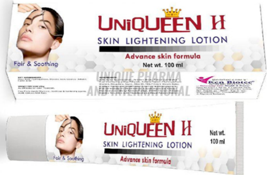
UNIQUEEN SKIN LIGHTENING LOTION