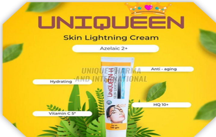
SKIN LIGHTENING CREAM