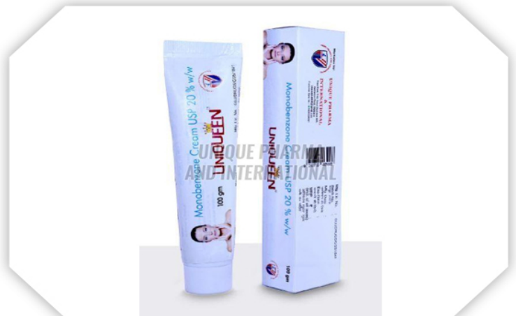
UNIQUE QUEEN MONOBENZONE 20 % CREAM