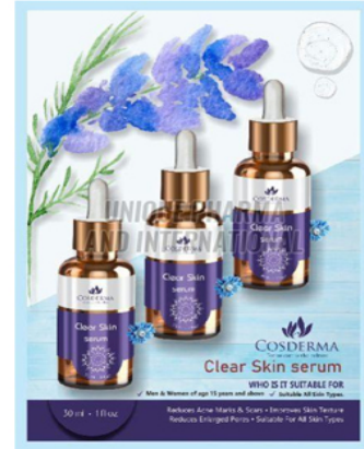
CLEAR SKIN SERUM