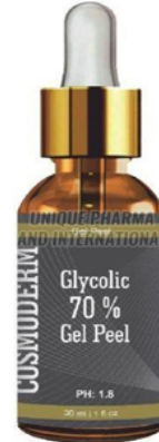
GLYCOLIC 70% GEL PEEL ESSENTIAL OIL