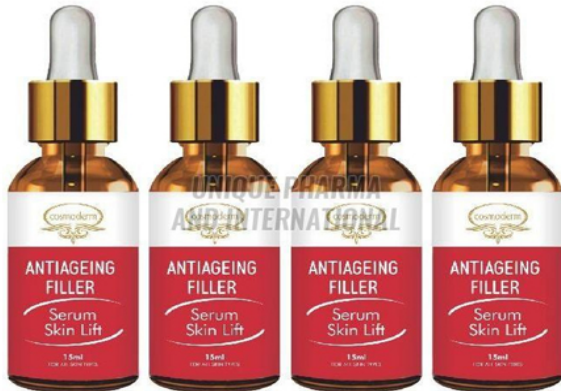
ANTIAGEING FILLER SERUM