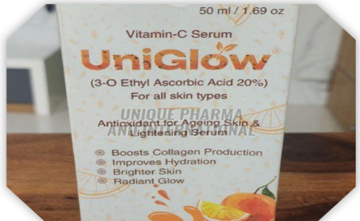
UNIGLOW VITAMIN C SERUM