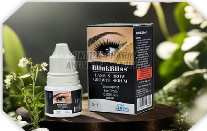
BLINKBLISS EYELASHES SERUM