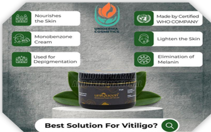
ANTI VITILIGO CREAM