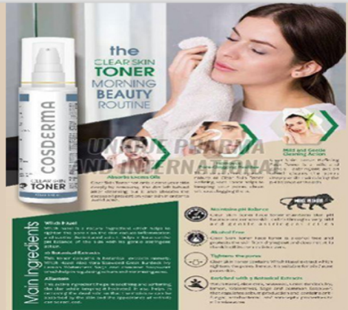
CLEAR SKIN TONER