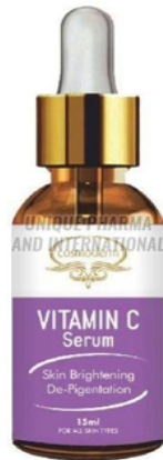
VITAMIN C SERUM