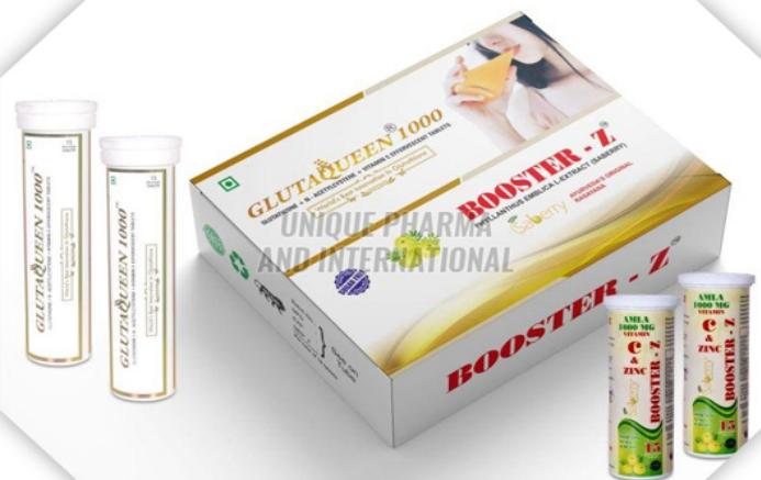
GLUTAQUEEN 1000 GLUTATHIONE EFFERVESCENT TABLET