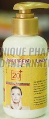
UNIQUEEN MONOBENZENE LOTION