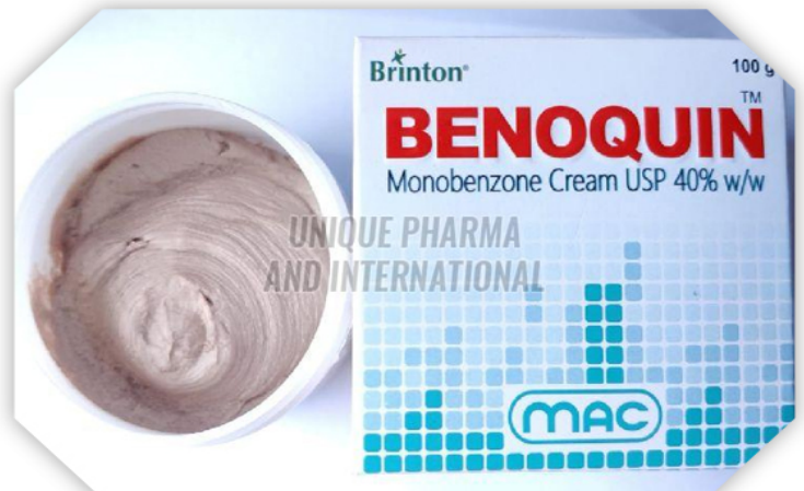
BENOQUIN MONOBENZONE CREAM