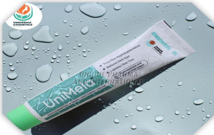
UNIMELA SKIN LIGHTNING CREAM