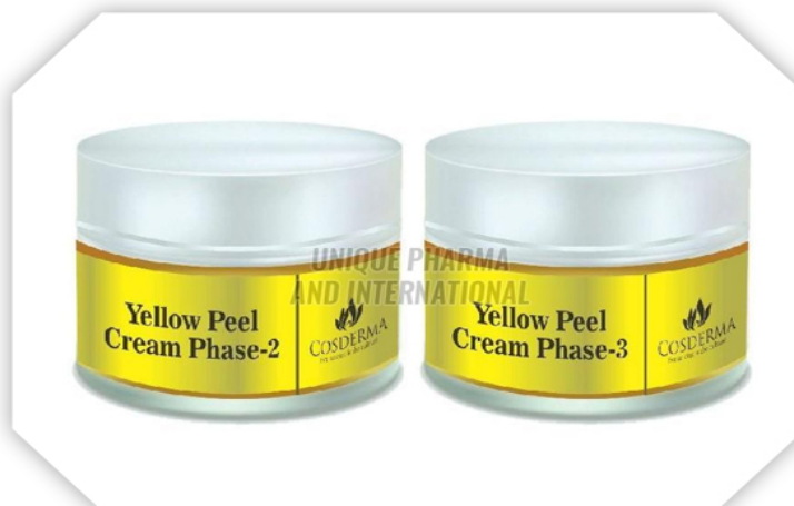
YELLOW PEEL CREAM