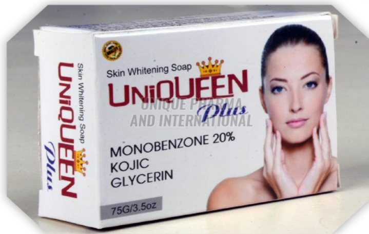
UNIQUEEN PLUS SOAP