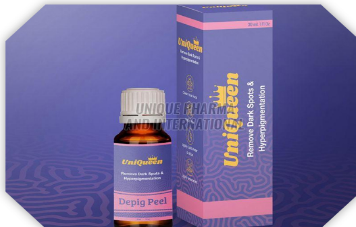
UNIQUEEN CHEMICAL PEEL SERUM