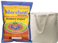
Non Woven, Paper, Cotton & Canvas Carry Bags