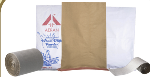
Paper HDPE Bags & Rolls