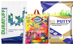
Multicolour BOPP Bags