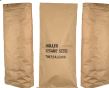
Multiwall Paper Bags