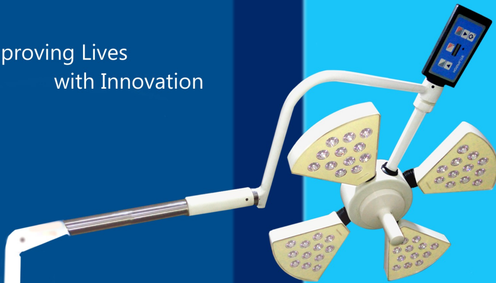
HOSPILITE Carina 4 Mobile