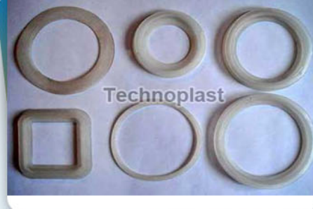
Silicone Rubber Components