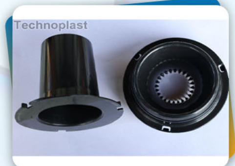
Bathroom Plastic Fitting