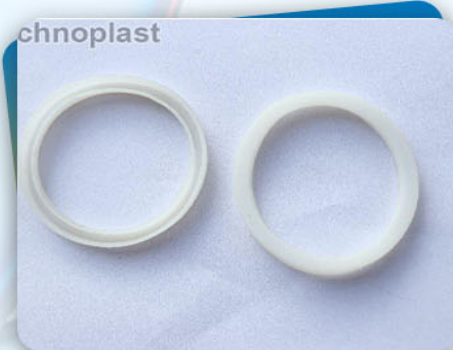
Glass Jar Gasket