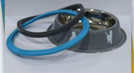
PET Feeder Non Skid Rings