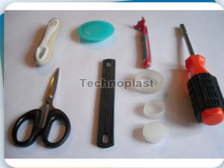
Thermoplastic Elastomer Components