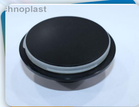
Jar Air Tight Gasket