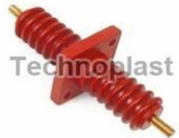
Molded HV Bushings