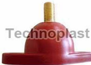
Molded LV Bushings