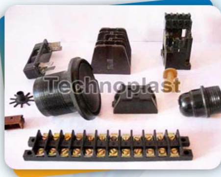
Switchgear Spare Parts