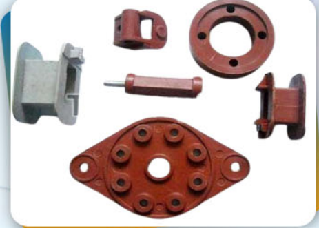
DMC Moulded Components