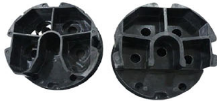
SMC Moulded Components