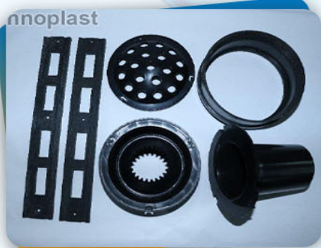
Injection Molded Components