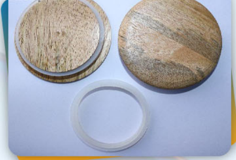
Wooden Lid For Jar