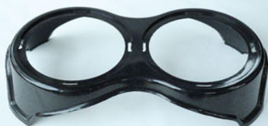
Double Dinner Petfeeder Stand