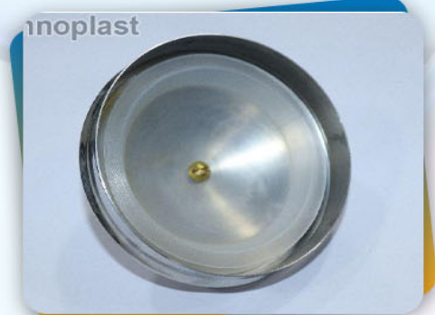
Glass Jar Metal Lid Gasket