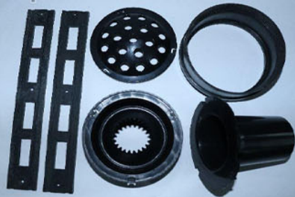
Plastic Injection Molded Products