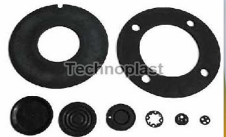
Moulded Rubber Components