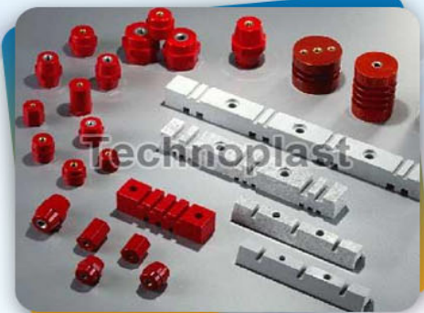
Electric Bus Bars