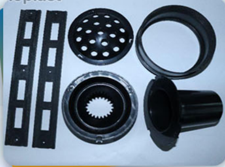
Injection Moulded Components