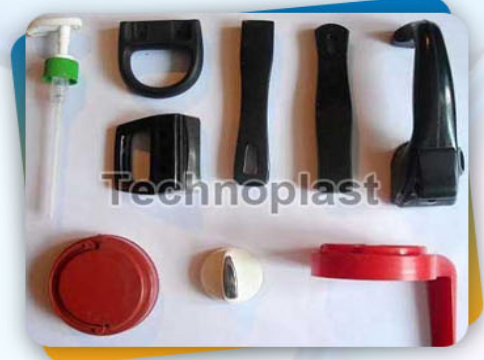
Home Appliances Parts