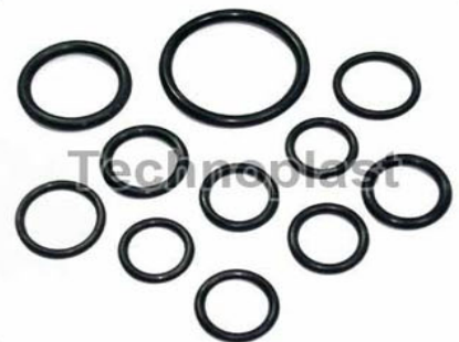
Moulded O Rings