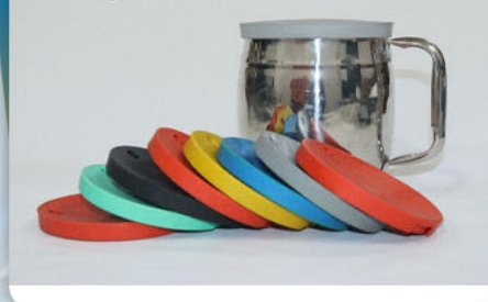
Rubber Lid For Jar