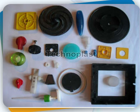
Plastic Engineering Components