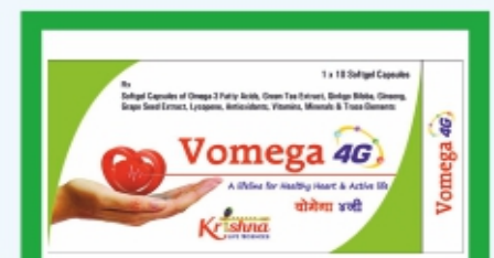
VOMEGA 4G CAPSULES