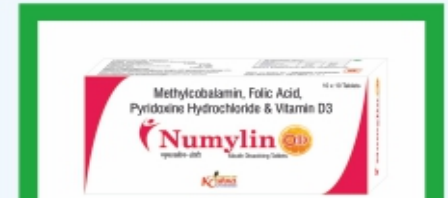
NUMYLIN OD TABLETS

We maintain a wide array of Pharmaceutical Capsules inclusive of Osteojod Capsules in Vadodara (Gujarat). Our Osteojod Capsules is a drug of choice for rheumatism, osteo arthritis, rheumatoid arthritis, prevention of the osteoporosis etc. We can easily process the bulk orders of the Osteojod Pharmaceutical Capsules. The Osteojod Capsules, we offer, is packed in medical-grade packaging material. We are identified as a famed Supplier and Exporter of Osteojod Capsules from Gujarat, India. first time in india unique composition which give twin benefits like bone healing as well as pain relief.