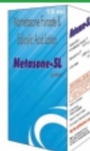
METASONE - SL LOTION

Use of the Product : Topical fungal infection associated with inflammation & pruritis.