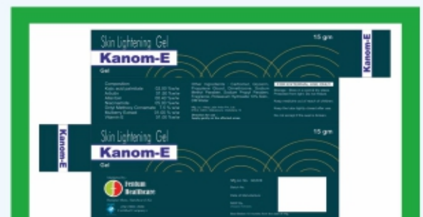
KANOM - E SKIN LIGHTENING GEL