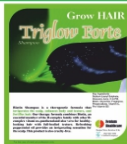
TRIGLOW - FORTE SHAMPOO

Use of the product : For hair growth, long and smooth hair, shining hair, enhance body and hair texture, Rejuvenates hair.