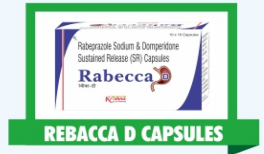
REBACCA D CAPSULES

As an authorized Supplier and Exporter of Pharmaceutical Tablets, we offer optimum quality Triglow Forte Tablets to all round the world. Our Triglow Forte Tablets are effective in preventing excess of hair loss and growing hair at faster pace. We offer range of Triglow Forte Tablets in proper packaging to intact its efficacy for a long time. Daily application of Triglow Forte Tablets show effective result without any side-effects.