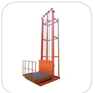
Material Handling Elevators