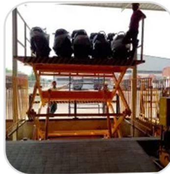
Heavy Duty Scissor Lift