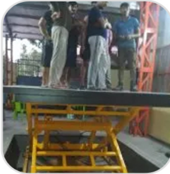
Truck Loading Unloading System