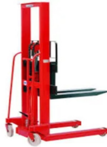
Hand Operated Hydraulic Stacker