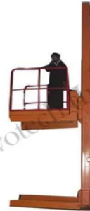
Hydraulic Personal Lifts