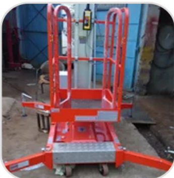
Single Mast Aerial Platform