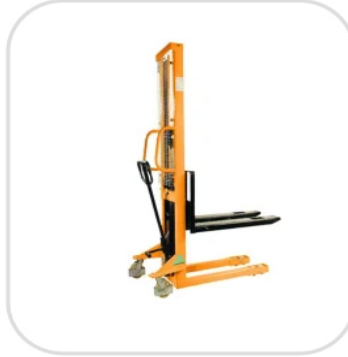
Industrial Lifting Equipment