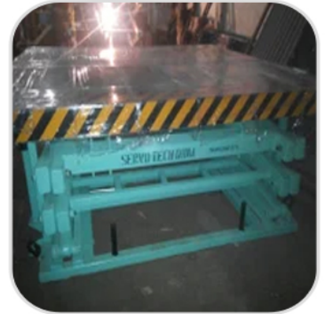
4 Ton Mild Steel Industrial Lifts