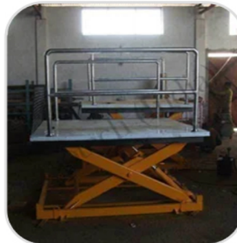
Single Scissor Lift