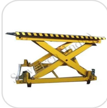
Single Scissor Platform