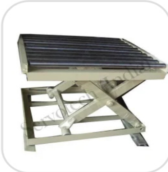
Roller Scissor Lifts