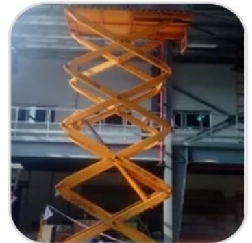
Hydraulic Movable Scissor Lift