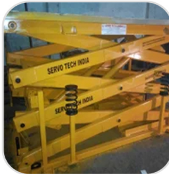
Power Scissor Lift