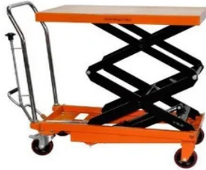
Hand Operated Scissor Lift