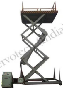
High Rise Goods Lift