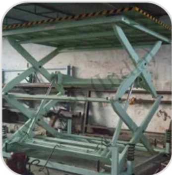
Double Scissor Lift