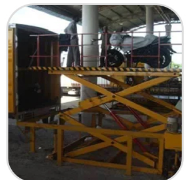
Loading Unloading Platform