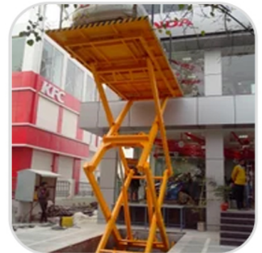
Car Lifting Machine