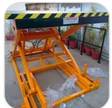
Goods Scissor Lift