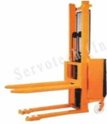
Mild Steel Electrical Stacker