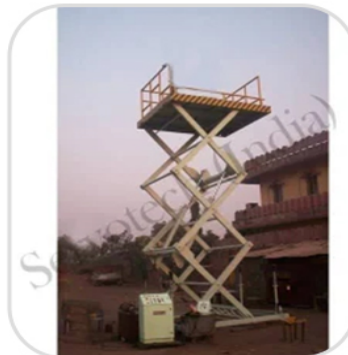
Triple Scissor Lift