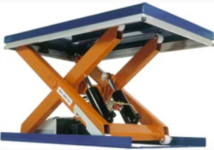
Hydraulic Scissor Lift