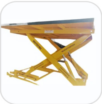
Battery Operated Scissor Lift