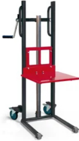
Material Lifting Machine