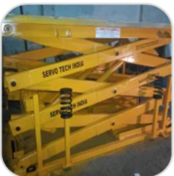
Freight Hydraulic Elevator