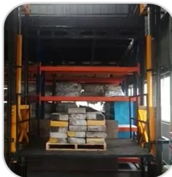
Double Mast Hydraulic Goods Lift