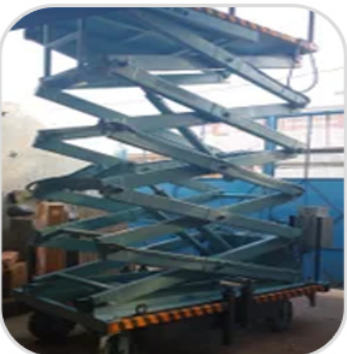
Mobile Scissor Lift