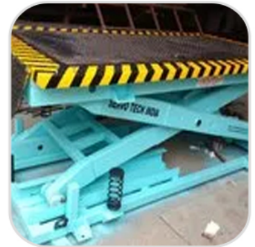
Hydraulic Scissor Lift