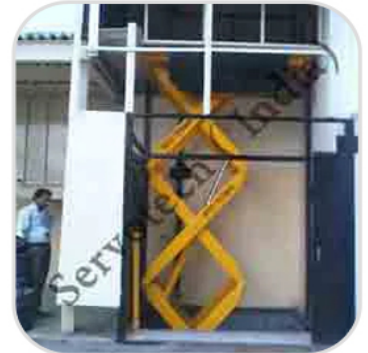
High Lift Scissor Lift