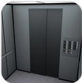
3 Ton Mild Steel Elevators