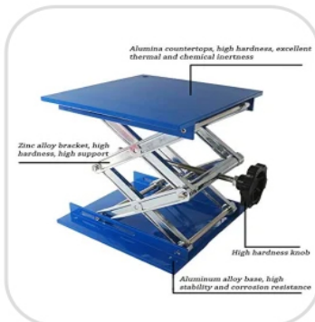
Scissor Lift Platform