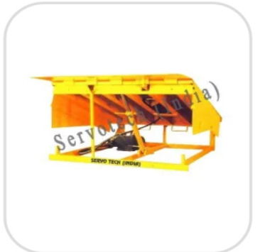
Hydraulic Dock Leveler