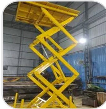
Heavy Duty Goods Lift