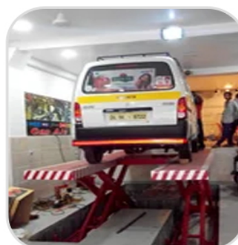
Scissor Lift for Car Maintenance