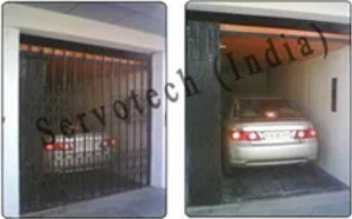
Car Lift Traction