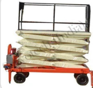
Moveable High Rise Scissor Platform