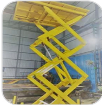
Outside Goods Lift