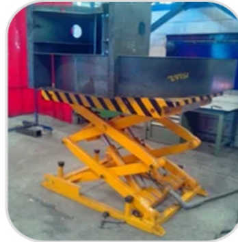
2 Ton Industrial Lift