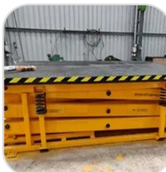
Fixed Type Goods Lifts