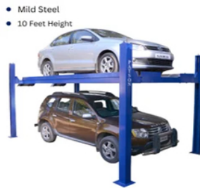
Car Parking Lift