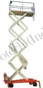
High Rise Working Platform