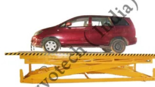
Car Lift Scissor Type