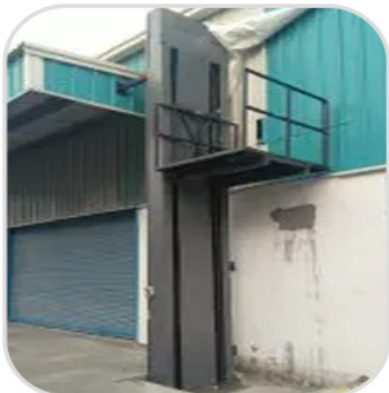
Hydraulic Stacker Lift