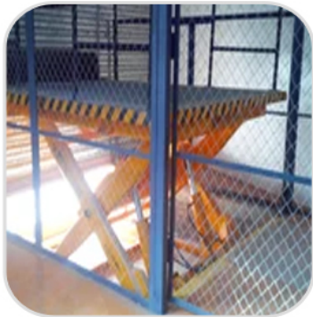
Hydraulic Scissor Lifts