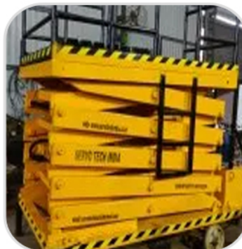
Hydraulic Work Platform