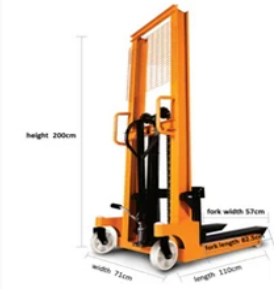
Manual Hydraulic Stacker