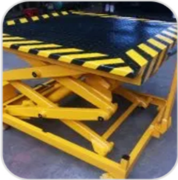
Scissor Platform Lift