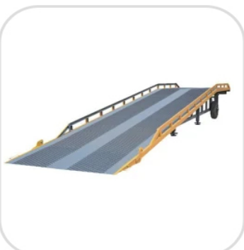
Mobile Dock Ramp