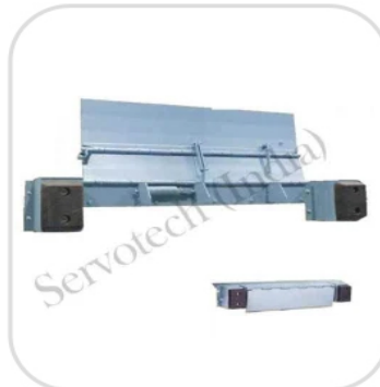
Mechanical Dock Leveler