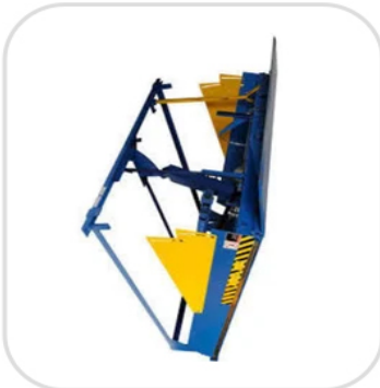
12 Ton Dock Levelers