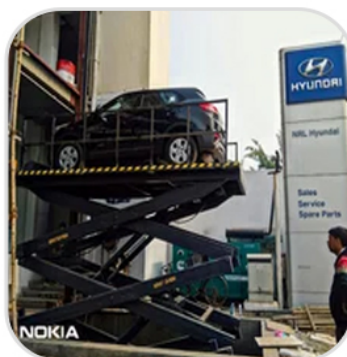
Hydraulic Car Lift