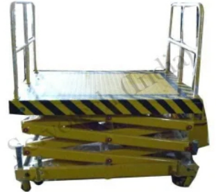
Movable Scissor Lift