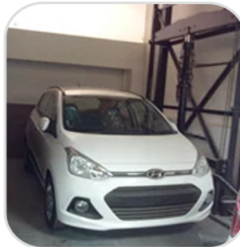
Hydraulic Vertical Car Lift