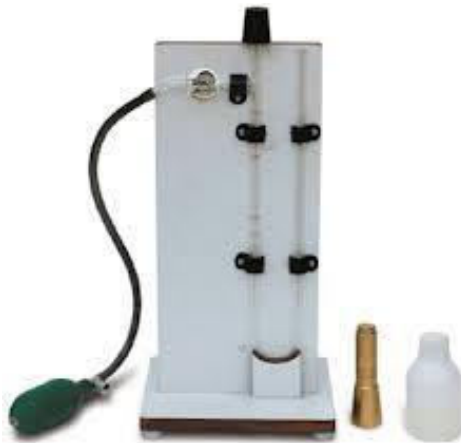
Blain's Air Permeability Apparatus

For complete product range – kindly check the Product List .