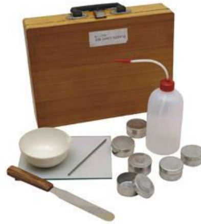
Plastic Limit Apparatus