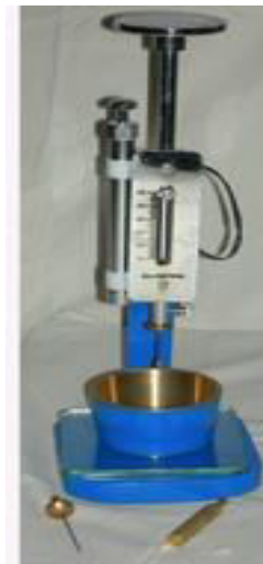
Vicat Needle Apparatus