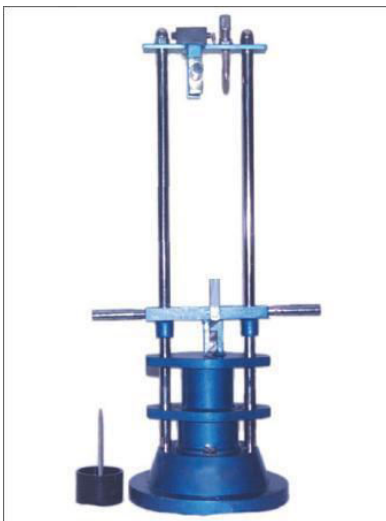
Aggregate Impact Test Apparatus