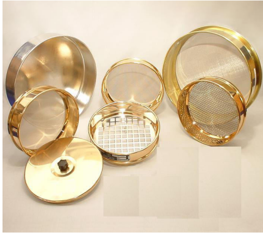
Test Sieves – made of Brass & G.I.