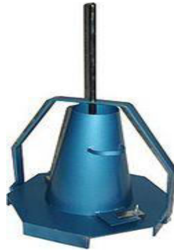
Slump Cone Apparatus