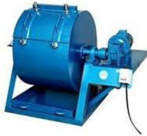
Los Angeles Abrasion Testing Machine