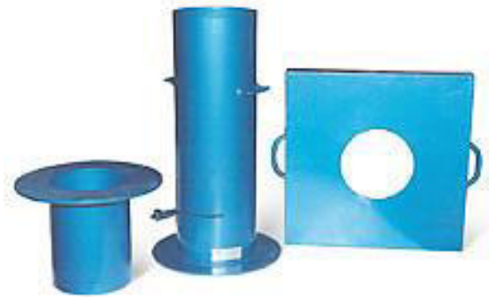
Sand Pouring Cylinder