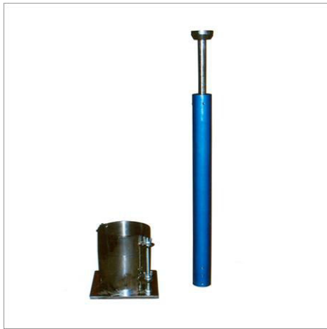
Proctor Compaction Apparatus