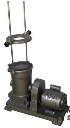
Sieve Shaker Motorised