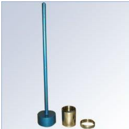
Core Cutter – with Dolly & Rammer