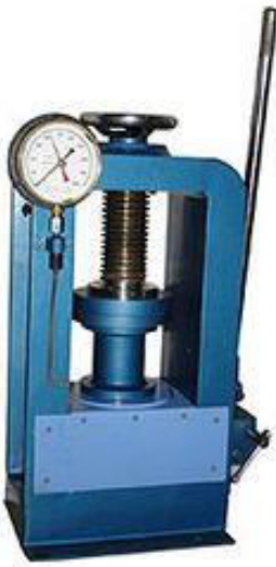
Compression Testing Machine