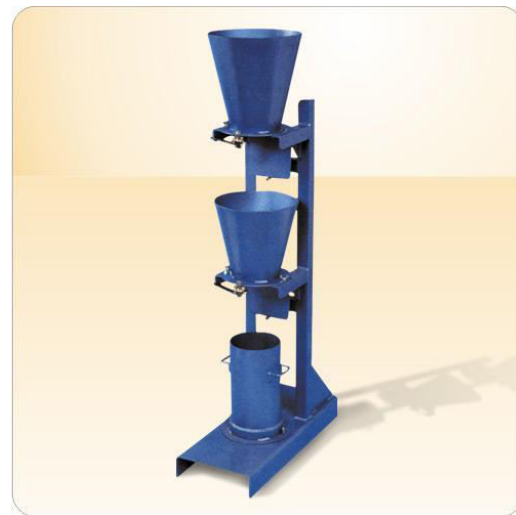
Compaction Factor Apparatus