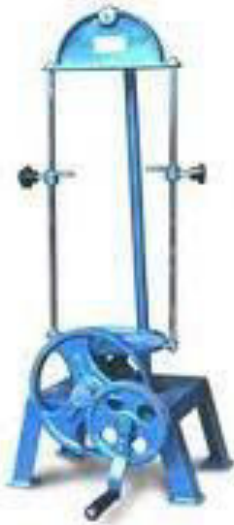
Sieve Shaker Hand Operated