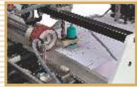
Electronic Double Sheet Detector