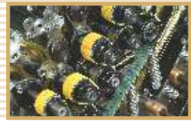
Silent belt drive