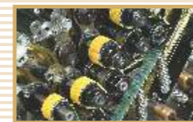
Silent belt drive