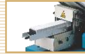
Kicker for Vertical Stacker

AS007 Max. Paper Size:175w x 70H(mm) Min. Paper Size:35w x 18H(mm) AS010 Max. Paper Size:250w x 125h(mm) Min. Paper Size:35w x 18h(mm)