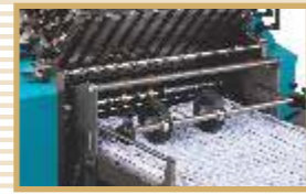
Plain stacker for Horizontal Delivery