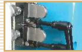
Gap setting adjustment by calipers