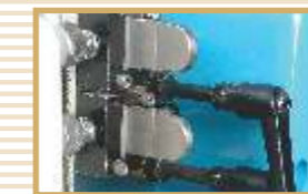
Gap setting adjustment by calipers