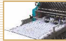
A rotary scoring (creasing) attachment at the delivery end