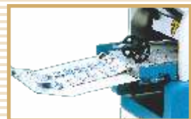
Plain stacker - Horizontal delivery for folded sheets