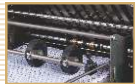
A creasing and perforation attachment at the delivery end