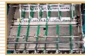
Transfer Unit With Ejector