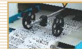
A creasing and perforation attachment at the delivery end