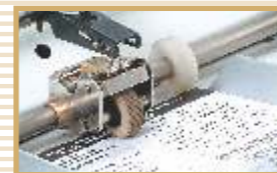
Automatic friction feeder feeds a single paper at a time