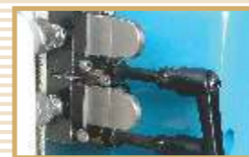
Gap setting adjustment by calipers