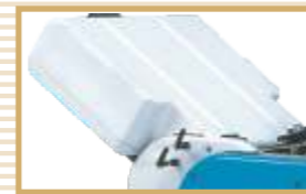
Noise Suppression Hoods For Noise Control