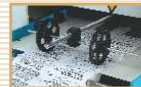
A creasing and perforation attachment at the delivery end