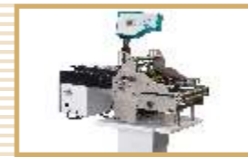
Standalone Vertical Stacker