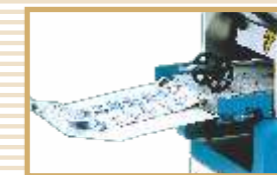
Plain stacker - Horizontal delivery for folded sheets