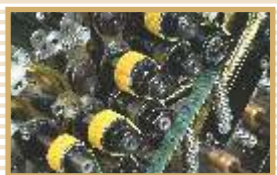
Silent belt drive