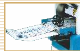
Plain stacker - Horizontal delivery for folded sheets