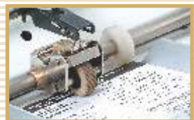
Automatic friction feeder feeds a single paper at a time