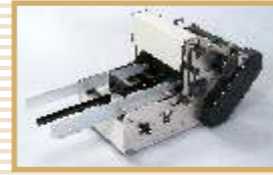
Automatic Vertical Stacker

AS007 Max. Paper Size:175w x 70H(mm) Min. Paper Size:35w x 18H(mm) AS010 Max. Paper Size:250w x 125h(mm) Min. Paper Size:35w x 18h(mm)