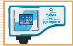
Rightly located display panel indicates information about batch counts and productivity of an ongoing job