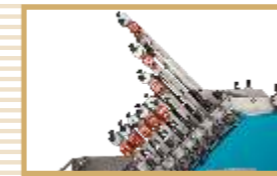
Folding Pocket with Position Indicator