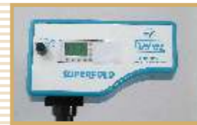
PLC Based Electronic Batch Counter For Batch Counting and Measuring Speed /hr

Kicker Max. Paper Size:150w x 70h(mm) Min. Paper Size:70w x 18h(mm)