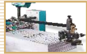
High speed flat pile vacuum feeder with back separator

Models upto 12 folds are available as per requirement