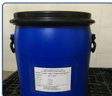
Para Chloro Thio Phenol