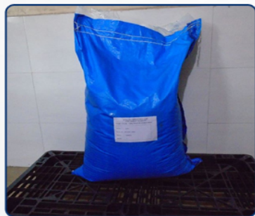
Para Toluene Sulfonamide