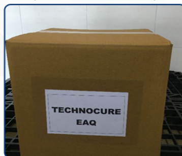
2-Ethylanthraquinone (Technocure EAQ)