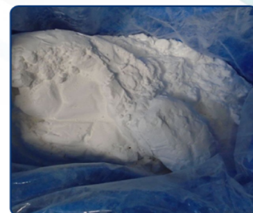
Para Chloro Benzophenone