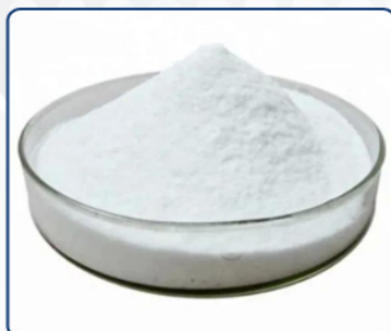
Sodium Valproate IP