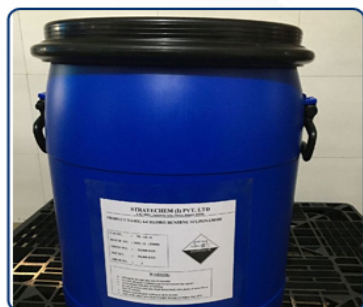
Para Chloro Benzene Sulfonamide