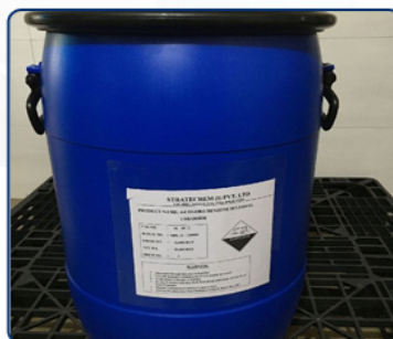
Para Chloro Benzene Sulfonyl Chloride