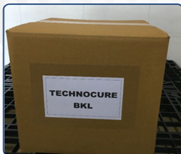
2,2-Dimethoxy-1,2-Diphenylethanone (Technocure BKL)