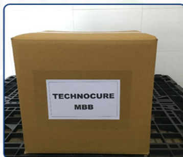
2- Benzoylbenzoic Acid Methyl Ester (Technocure MBB)