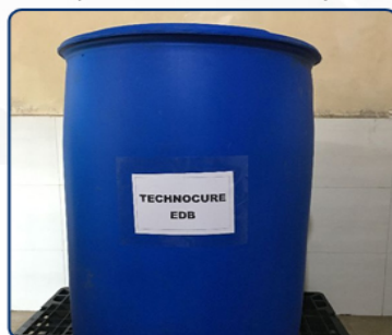
4- (Dimethylamino) Benzoic Acid Ethyl Ester (Technocure EDB)