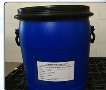
Sodium Benzene Sulfonate