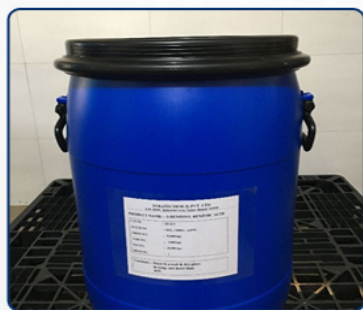
2-Benzoyl Benzoic Acid