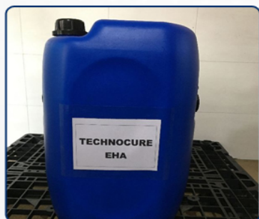
4-(Dimethylamino)-Benzoic Acid Ethyl Hexylester (Technocure EHA)