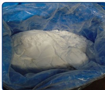
Ortho Toluene Para Toluene Sulfonamide Mixture