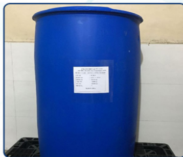
Phenyl Acetyl Chloride