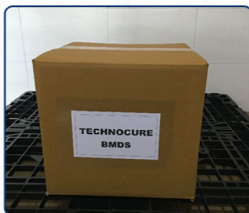
4-Benzoyl-4-Methyl Diphenyl Sulphide (Technocure BMDS)