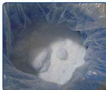
4-Methyl Benzophenone (Technocure MBP)