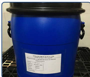
Para Chloro Benzene Sulfonate Sodium Salt