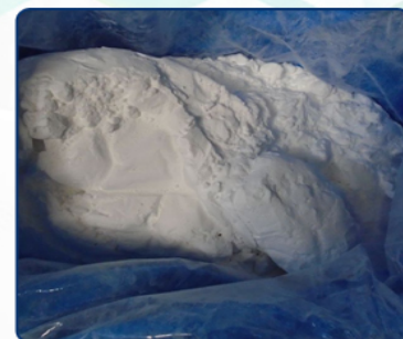
Ortho Toluene Sulfonamide