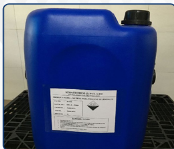
Methyl Para Toluene Sulphonate