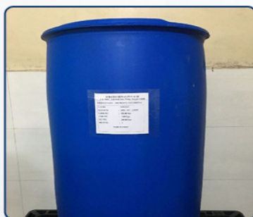
Isopropyl Thio Phenol