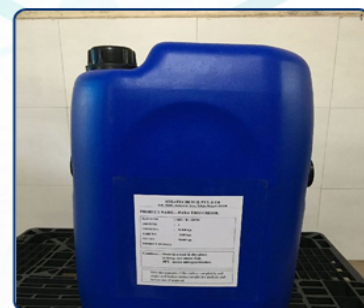
Para Thio Cresol