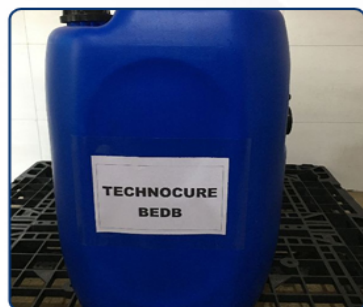
4- (Dimethylamino) Benzoic Acid 2 Butoxyethyl Ester (Technocure BEDB)