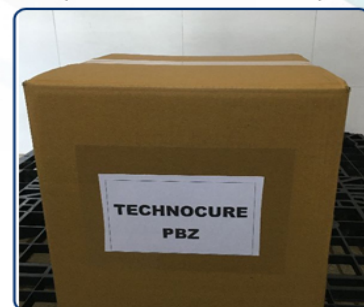
4- Phenylbenzophenone (Technocure PBZ)