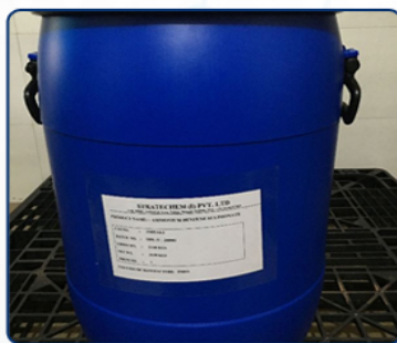
Ammonium Benzene Sulfonate