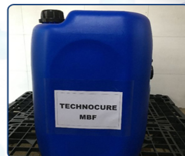
Phenylglyoxylic Acid Methyl Ester (Technocure MBF)