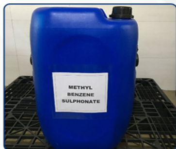
Methyl Benzene Sulphonate