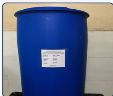
Benzene Sulfonyl Chloride