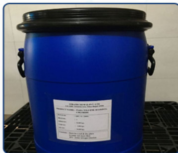
Para Toluene Sulfonyl Chloride