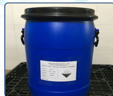
Methane Sulfonic Anhydride