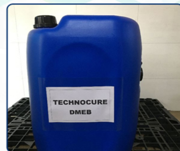
2-(Dimethylamino) Ethyl Benzoate (Technocure DMEB)