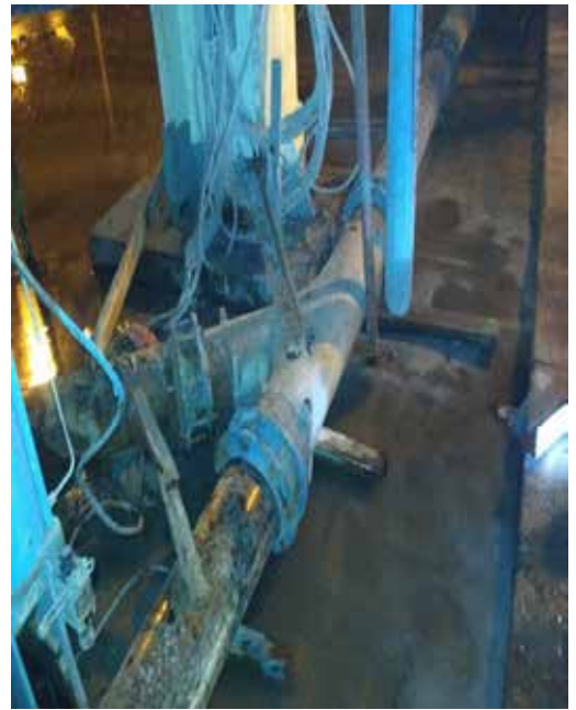
REPAIR & MAINTENANCE OF ALL TYPES OVERFLOW PIPES