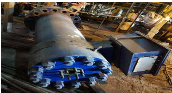
REPAIR & MAINTENANCE OF BOILER CIRCULATION PUMPS WORK PROJECT AT ANNUPUR, MADHEYA PRADESH