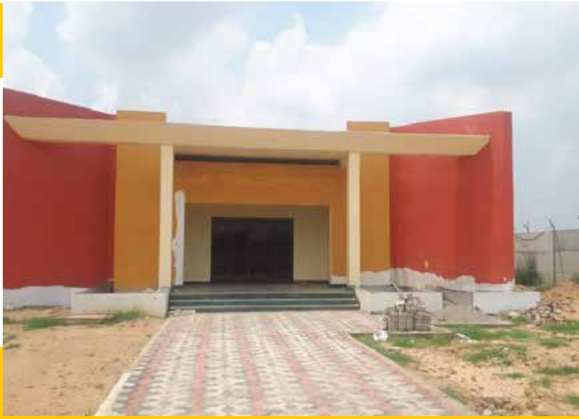
CONSTRUCTION OF PUBLIC AWARENESS BUILDING AT 2800MW GHAVP, NPCIL PROJECT OF GORAKHPUR HARYANA, ANU VIDYUT PARIYOJANA- FATEHABAD