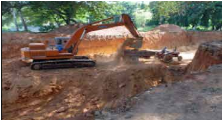
TATA HITACHI ZAXIS 120H, NO. OF 02