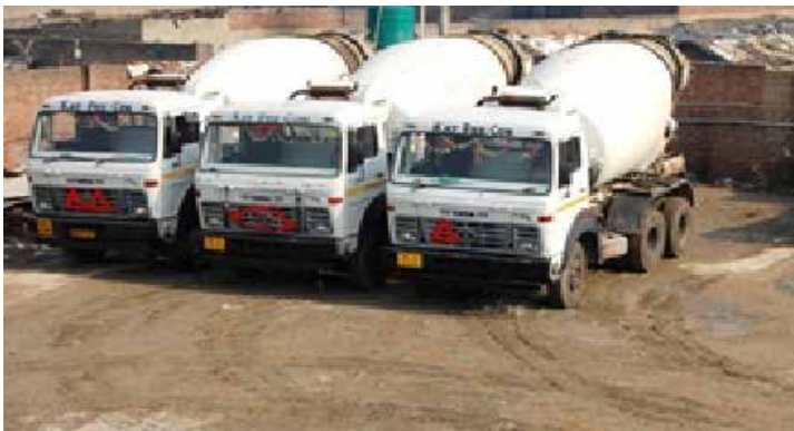
READY MIX CONCRETE RMC TRUCK NO. OF 03