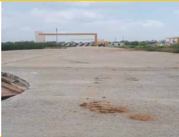
CONSTRUCTION OF INTERNAL MAIN GATE RCC ROAD AT 2800MW GHAVP, NPCIL PROJECT OF GORAKHPUR HARYANA, ANU VIDYUT PARIYOJANA-FATEHABAD