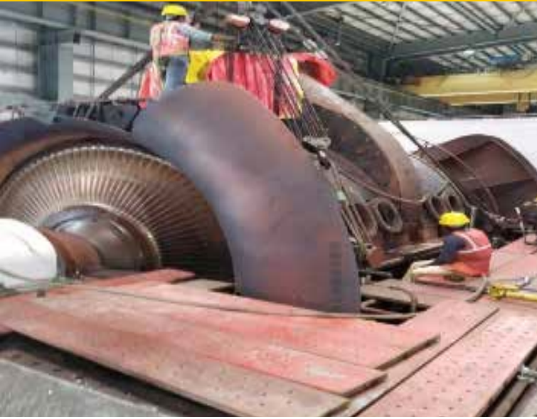
OVERHAULING WORK OF TURBINE AT 3X660MW TSPL-BANAWALA(VEDANTA GROUP) MANSA-PUNJAB