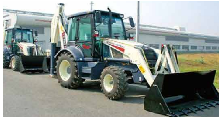
JCB TEREX VECTRA TX760 BS-IV, NO. OF 03