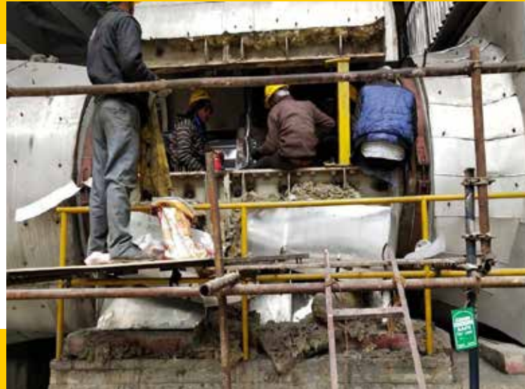
OVERHAULING WORK OF ID FAN AT MB POWER THERMAL POWER PLANT ANNUPUR, MADHEYA PRADESH