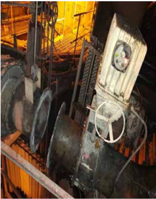
REPAIR & MAINTENANCE OF ALL TYPES OVERFLOW PIPES