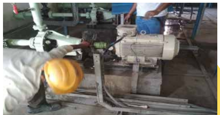
REPAIR AND MAINTENANCE OF ASH HANDLING PUMPS PROJECT AT ANNUPUR, MADHEYA PRADESH