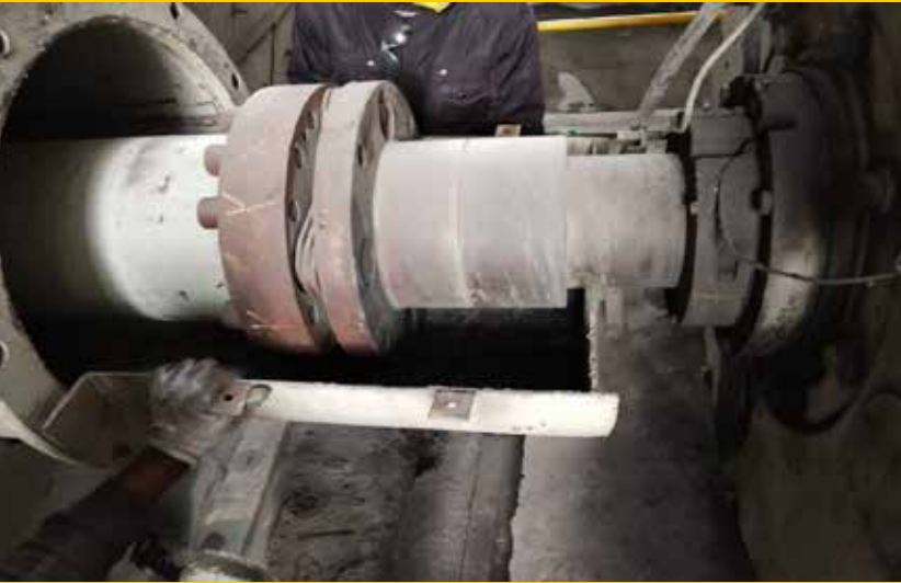
OVERHAULING WORK OF ID FAN AT 2X600MW MB POWER THERMAL PLANT ANNUPUR, MADHYA PRADESH