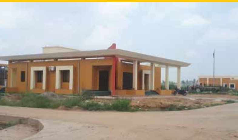
CONSTRUCTION OF ADMINISTRATION BUILDING ON GATE OF GHAVP, 2800MW NPCIL PROJECT OF GORAKHPUR HARYANA, ANU VIDYUT PARIYOJANA- FATEHABAD