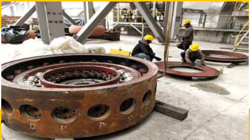
OVERHAULING WORK OF ID FAN AT 2X600MW MB POWER THERMAL POWER PLANT ANNUPUR, MADHYA PRADESH