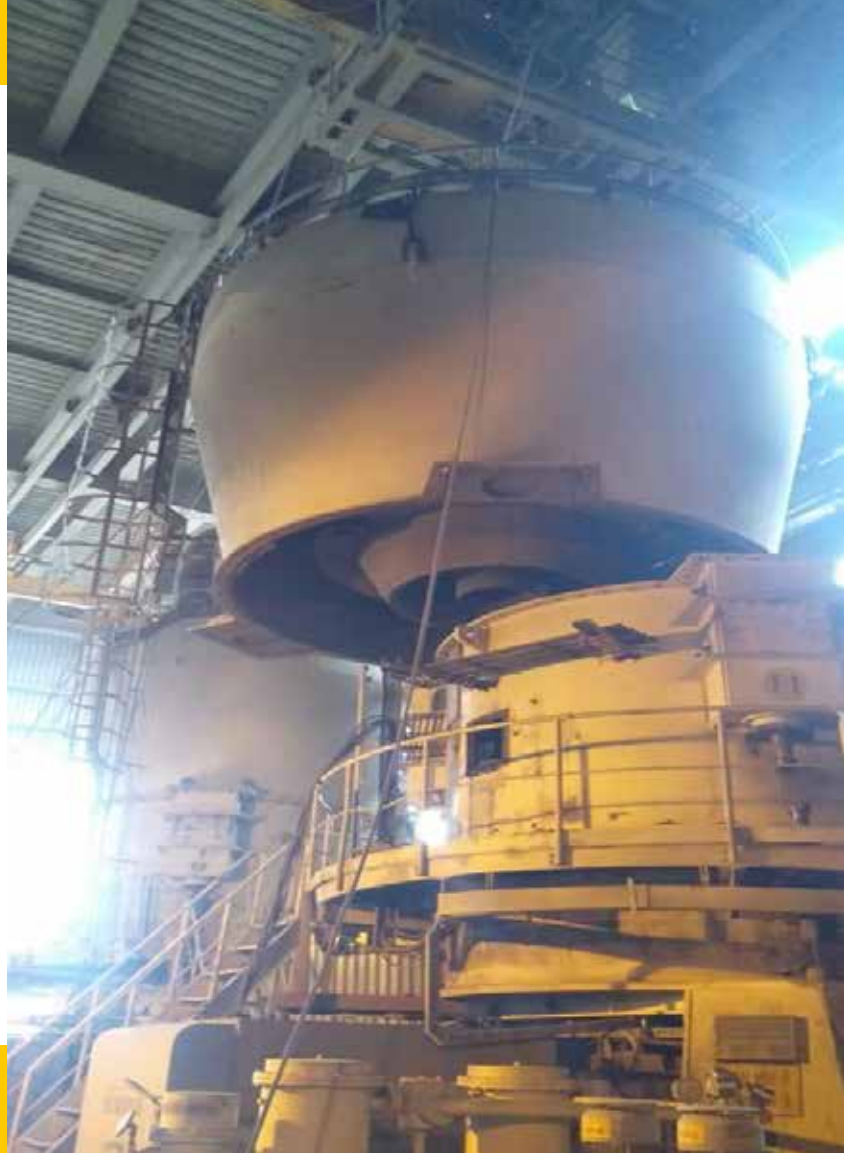
OVERHAULING WORK OF COAL MILL AT MB POWER THERMAL POWER PLANT, 2X600 MW ANNUPUR MADHYA PRADESH