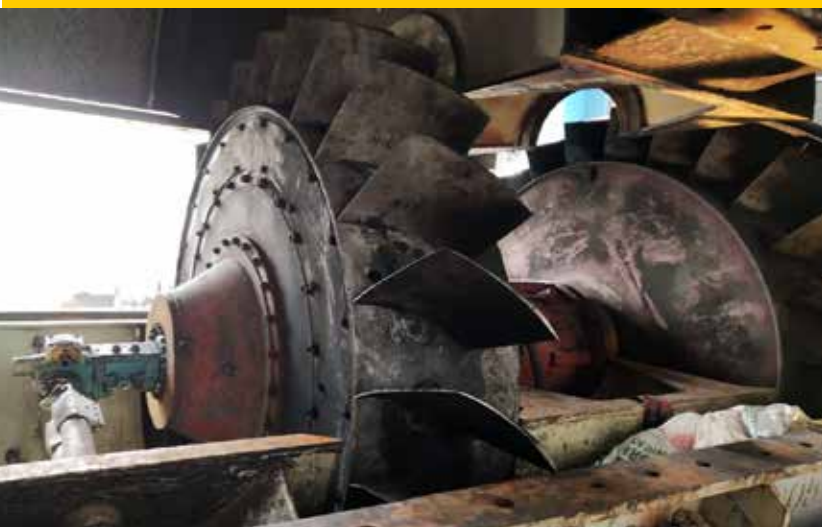
OVERHAULING WORK OF ID FAN AT MB POWER THERMAL POWER PLANT ANNUPUR, MADHYA PRADESH