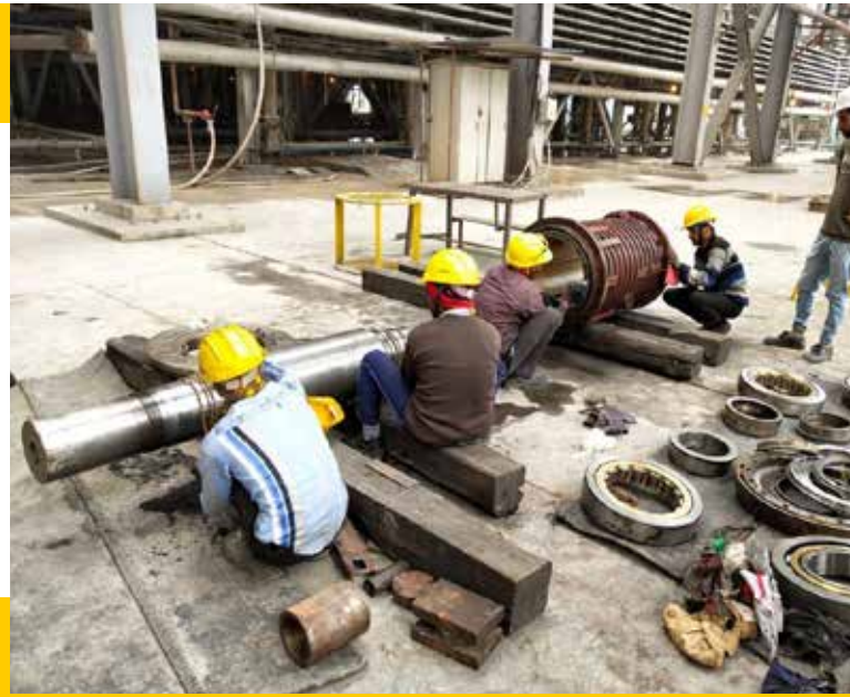
OVERHAULING WORK OF ID FAN AT 2X600MW MB POWER THERMAL PLANT ANNUPUR, MADHYA PRADESH