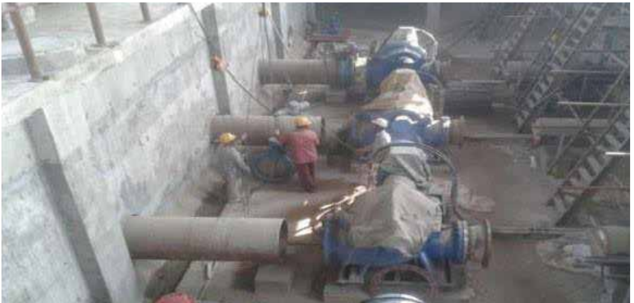
ERECTION & COMMISSIONING OF MAIN PUMP AT 3X660TSPL-BANAWALA (VEDANTA GROUP) MANSI (PUNJAB)