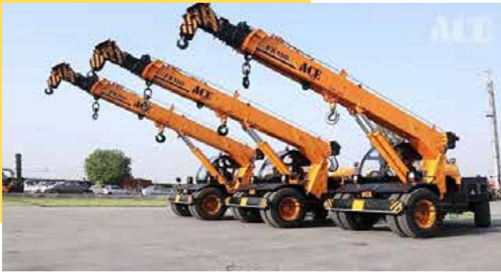
ACE HYDRA CRANE MOBILE CRANE MODEL -SX150, BS-IV, NO. OF 03