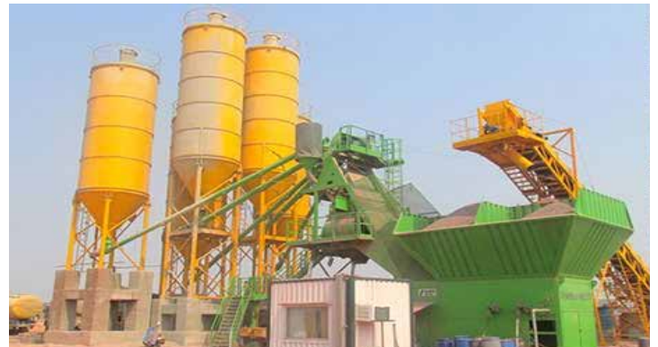
BATCHING PLANT CP30 NO. OF 02