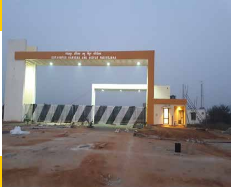
CONSTRUCTION OF MAIN GATE AT 2800MW GHAVP ,NPCIL PROJECT OF GORAKHPUR HARYANA, ANU VIDYUT PARIYOJANA-FATEHABAD