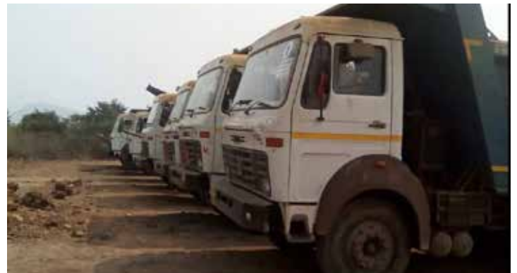
READY MIX CONCRETE RMC TRUCK NO. OF 03