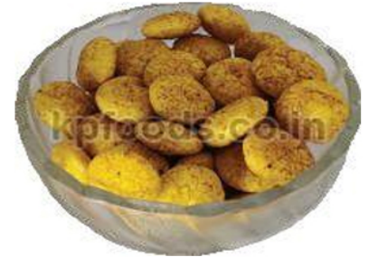
MAGGI MASALA PUFFS