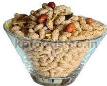
MULTIGRAIN DRY FRUIT CHIVDA