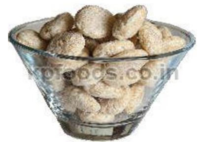
MULTIGRAIN QUANA PUFFS