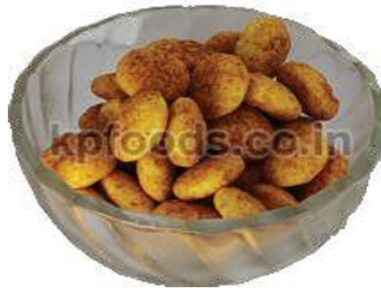
DESI TADKA PUFFS