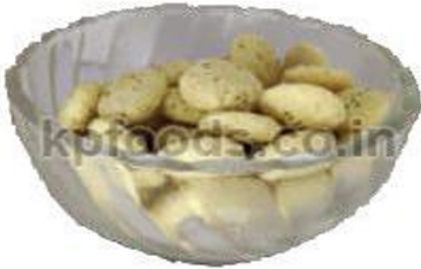
CREAM ONION PUFFS