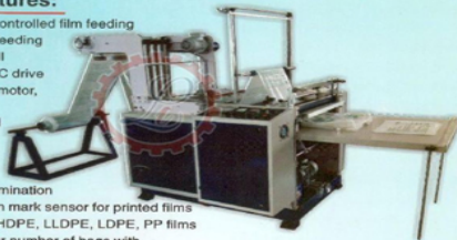
Automatic Bottom Sealing & Cutting Machine

Business Type : Manufacturer, Exporter, Supplier