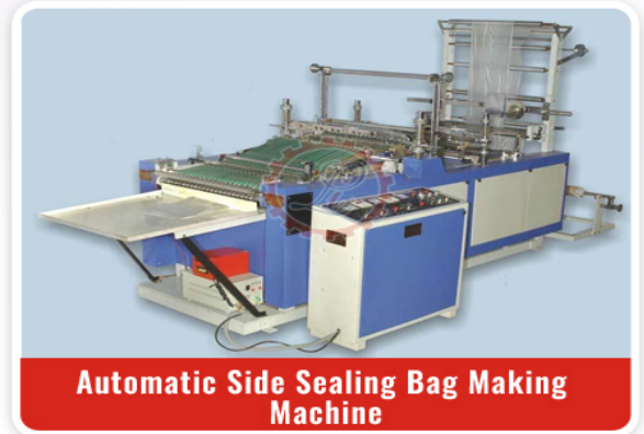
Automatic Side Sealing Bag Making Machine