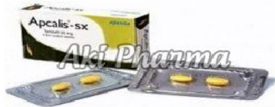
Apcalis SX Tablets