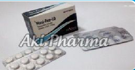
Tamoxifen 10 mg Tablets