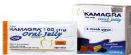
Kamagra Oral Jelly