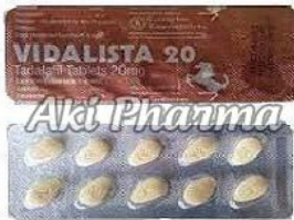
Vidalista 20mg Tablets