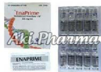
Testosterone Enanthate Injection