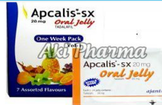
Apcalis-SX Oral Jelly