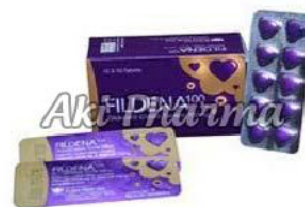
Cenforce 100mg Tablets