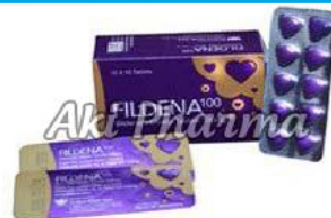
Sildenafil Citrate 100mg Tablets