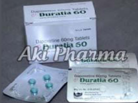
Dapoxetine 60mg Tablets