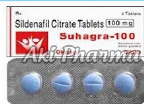
Suhagra-100 mg Tablets