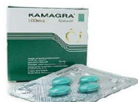
Kamagra Gold Tablets