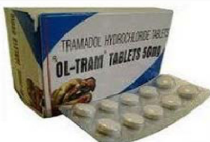
Tramadol 100mg Tablets