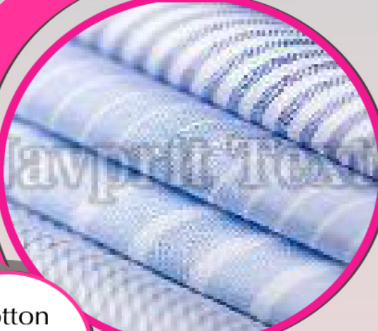
Cotton Shirting Fabric