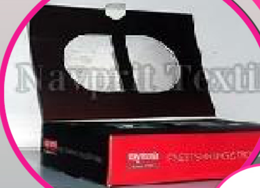
Pant Shirt Combo Fabric