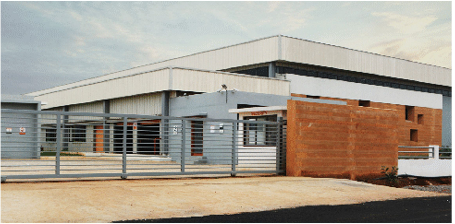
State of the Art Blower Engineering and Manufacturing