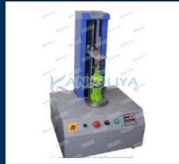
Bottle Burst Testing Machine