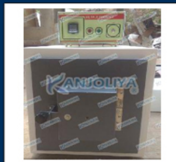
Digital Mild Steel 1350 Degree C Muffle Furnace