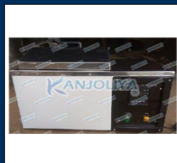
Digital SS Serological 230V Water Bath