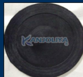
Bursting Strength Tester Diaphragm