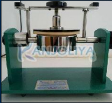
Cobb Sizing Testing Machine