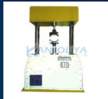
Digital Single Phase 220V Core Crush Testing Machine