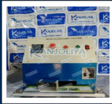
Digital Sutherland Type Rub Scuff Proofness Testing Machine