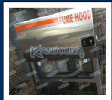
Fume Hood Testing Machine