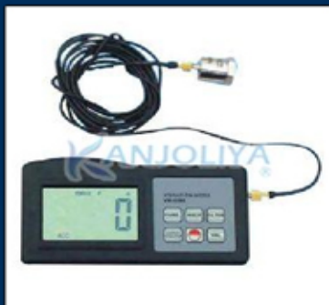
LCD Digital Vibration Meter Testing Machine