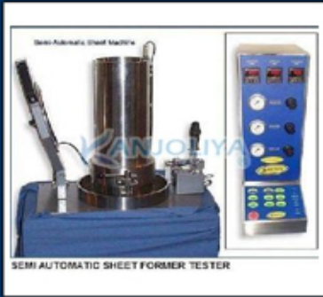
Semi Automatic Sheet Former Testing Machine