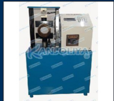
Digital Single Phase 240V Core Crush Testing Machine