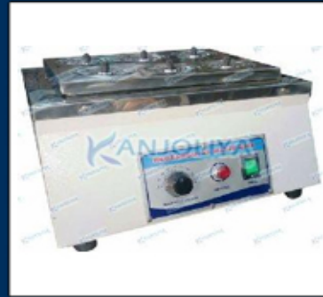
Rectangular Water Bath Testing Machine