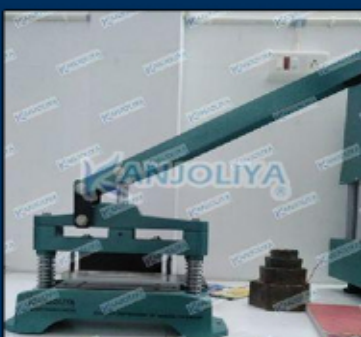
RCT Die Punch Cutter