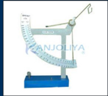
Quadrant Scale Testing Machine