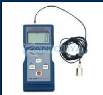
Digital Vibration Meter Tester