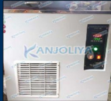
Digital Chiller Testing Machine