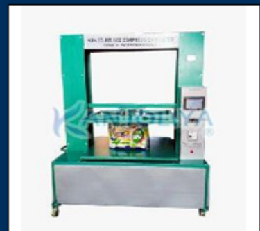
Digital Touch Screen Model Box Compression Testing Machine