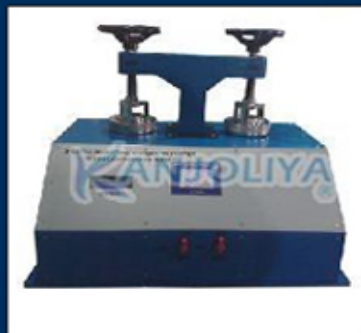
Digital Hot Rolled Bursting Strength Testing Machine