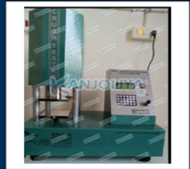
Digital Laboratory Ring Edge Flat Crush Testing Machine