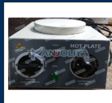
Analog Hot Plate Tester