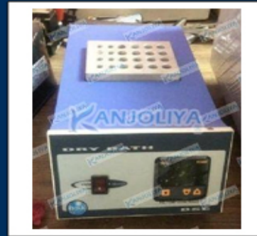
Laboratory Dry Bath Incubator Tester