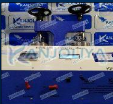
Digital Thermal Printer Bursting Strength Testing Machine