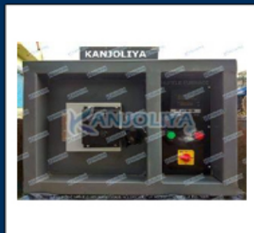
Digital Mild Steel 1300 Degree C Muffle Furnace