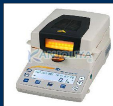
Digital Touch Screen Halogen Type Moisture Analyzer