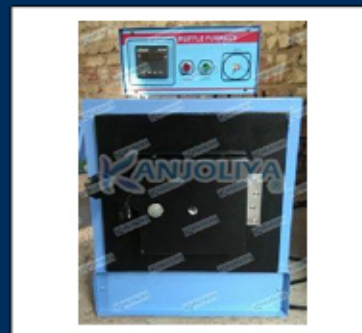
Digital Mild Steel 1400 Degree C Muffle Furnace