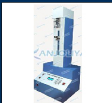
Digital Mild Steel 50Hz Tensile Strength Testing Machine