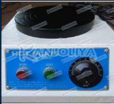
Digital Hot Plate Tester

Testing Machine, Digital Humidity Chamber, Laboratory Hot Air Oven, Digital Mild Steel Muffle Furnace & Digital Water Bath