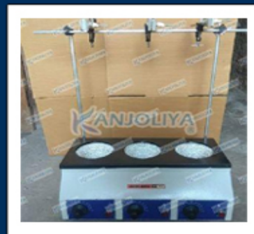
Laboratory Heating Mental Testing Machine