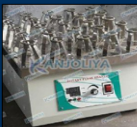
Digital Rotary Flake Shaker