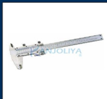
Stainless Steel Mitutoyo Vernier Caliper