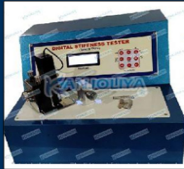
Digital Stiffness Testing Machine