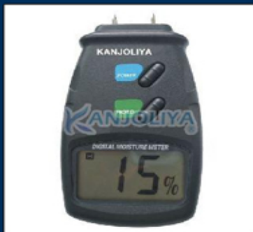
Digital Automatic Moisture Meter