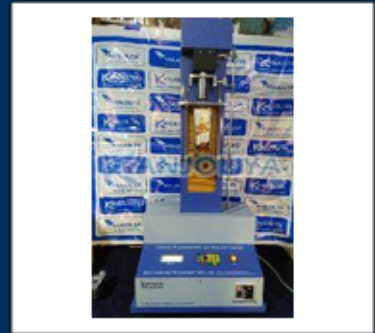
Digital Cap Pull Out Testing Machine