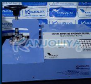
Digital Bursting Strength Testing Machine Without Heads