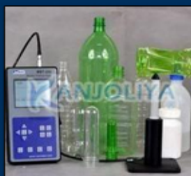
Digital Bottle Thickness Gauge