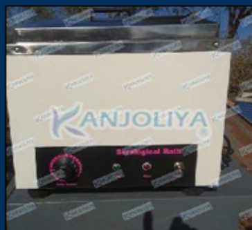
Digital SS Serological 220V Water Bath