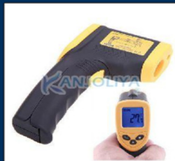
Digital Fluke Infrared Thermometer