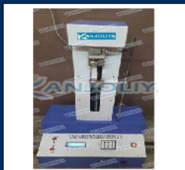
Digital 45Kg Peel Strength Testing Machine