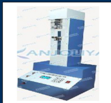
Digital 100Kg Peel Strength Testing Machine