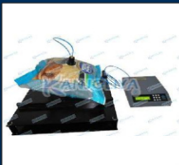
Digital Pouch Type Bursting Strength Testing Machine