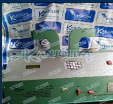
Digital Double Head Bursting Strength Testing Machine