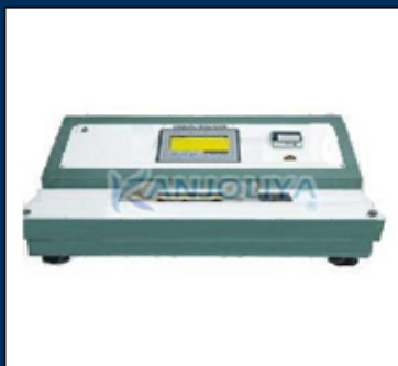
Digital Mild Steel Horizontal Modal Tensile Strength Testing Machine