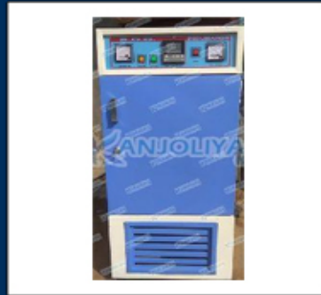
Analog BOD Incubator Tester