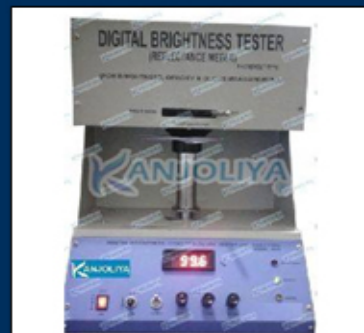
Digital Semi Automatic Reflectance Brightness Testing Machine