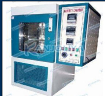
Digital 60Hz Humidity Chamber