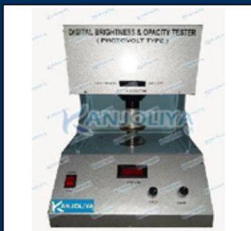
Digital Automatic Reflectance Brightness Opacity Photovolt Testing Machine