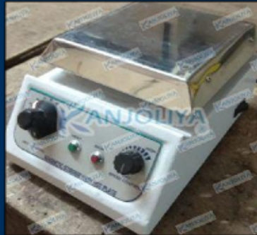
Magnetic Stirrer Hot Plate Tester