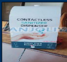
Contactless Sanitizer Dispenser