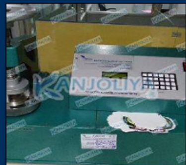
Digital Single Head Bursting Strength Testing Machine