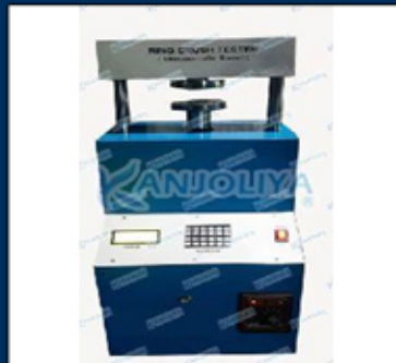
Digital Ring Crush Testing Machine