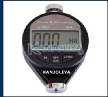
Shore A Durometer & Hardness Testing Machine