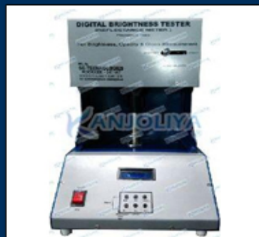
Digital Automatic Reflectance Brightness Testing Machine