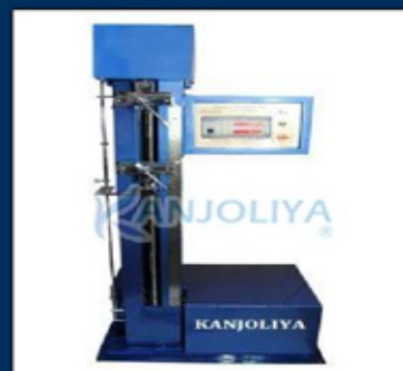
Digital Mild Steel ASTM E-8 Tensile Strength Testing Machine