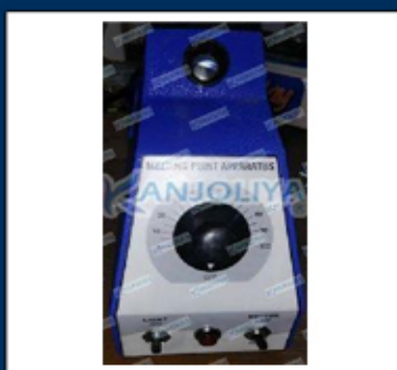
Melting Point Apparatus