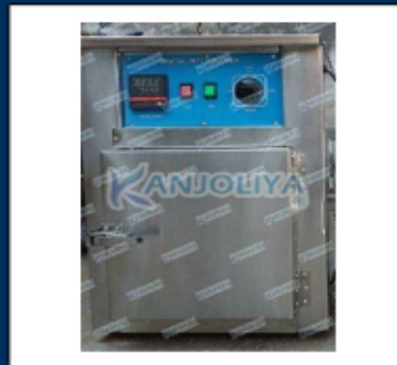
Digital Laboratory 3.5 kW Hot Air Oven