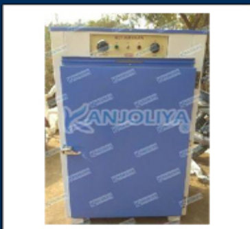
Analog Laboratory 3.8 kW Hot Air Oven