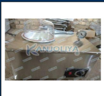
Peak Test Apparatus Testing Machine