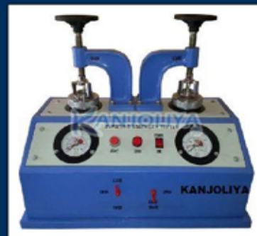
Analog Bursting Strength Testing Machine