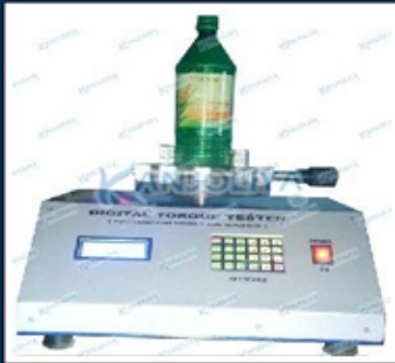
Digital Torque Testing Machine