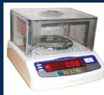
KLIHV111 Digital GSM Testing Machine