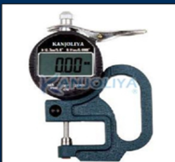
Digital Paper Micrometer