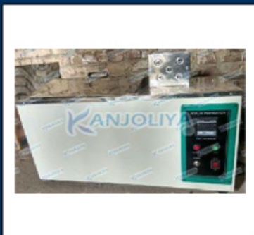
Digital SS Serum Inspisator Water Bath