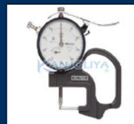
Analog Dial Thickness Gauge