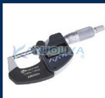
Digital Type Mitutoyo Digimatic Thickness