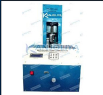
Digital Breaking Load Testing Machine