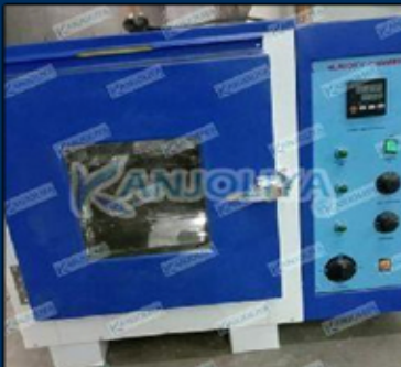
Digital 50Hz Humidity Chamber