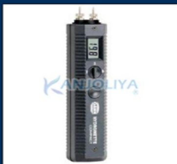
Gann Moisture Meter