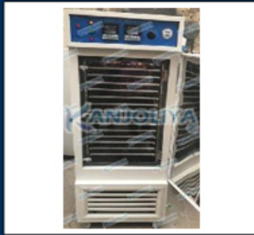
Seed Germinator Testing Machine