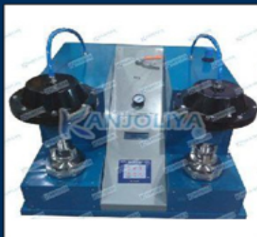
Digital Pneumatic Type Bursting Strength Testing Machine