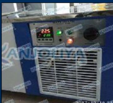
Digital MS Water Bath