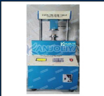
Digital Paper and Board Crush Testing Machine