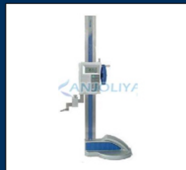
Digital Vernier Height Guage Tester