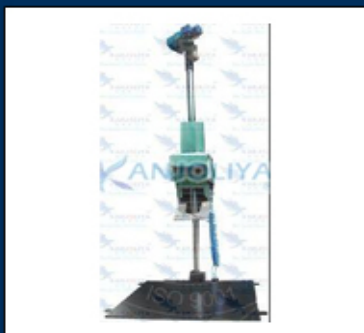
Drop Testing Machine