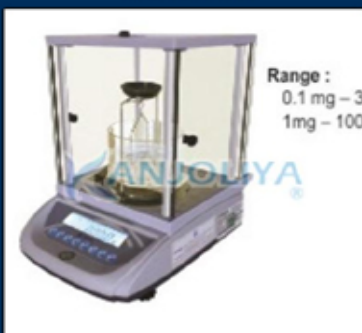
KLIHV282 Digital GSM Testing Machine