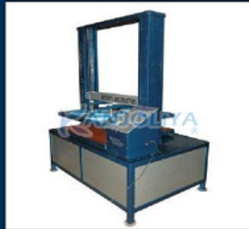
Digital Box Compression Testing Machine