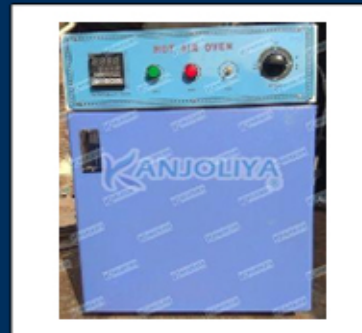
Digital Laboratory 3.7 kW Hot Air Oven