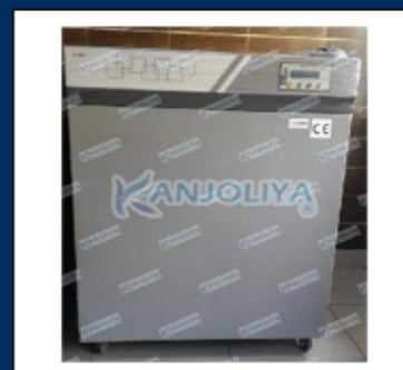
Digital SS Serological 240V Water Bath