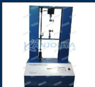
Digital Mild Steel 60Hz Tensile Strength Testing Machine