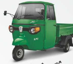
Ape City XTRA