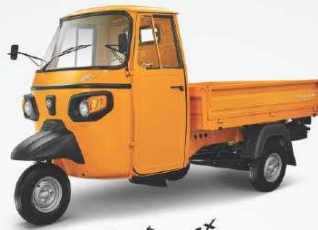
Ape Xtra LDX