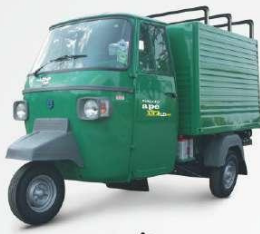
apé HIGH BODY

Widest Range in 3w Cargo Segment in India