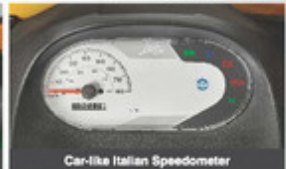
Car-like Italian Speedometer