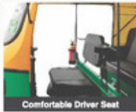
Comfortable Driver Seat