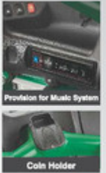
Provision for Music System

Ape City makes you stand out from the rest with a stunning Italian Design. As you step in, a stylish dashboard reveals its smartness quotient. It steals your heart with an exciting range of features like Italian Speedometer, Mobile Charger, Provision for Music System & Speakers and Coin Holder. Stylish Bumper and Clear Transparent Headlamps make the drive even more exciting. Move on, let the style with stunning smart features make you stand out amongst your peers.