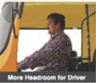
More Headroom for Driver