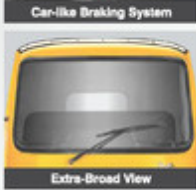
Car-like Braking System

10 to 12 hours of driving is a daily routine for you. Heavy traffic, constant clutching and braking result into pain in ankles and physical fatigue. But now you can put an end to this everyday misery. Ape City promises comfortable and pleasant drive with a perfectly positioned inclined driver seat. It offers more headroom and a broader view with an extra-wide windshield. Car-like braking system and smoother clutch take care of all your worries. It offers a well-cushioned and broad passenger seat. Go ahead, begin a journey of comfortable drives for you and your esteemed passengers.