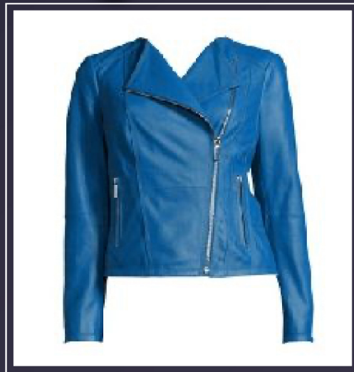
Ladies Sky Blue Leather Jacket