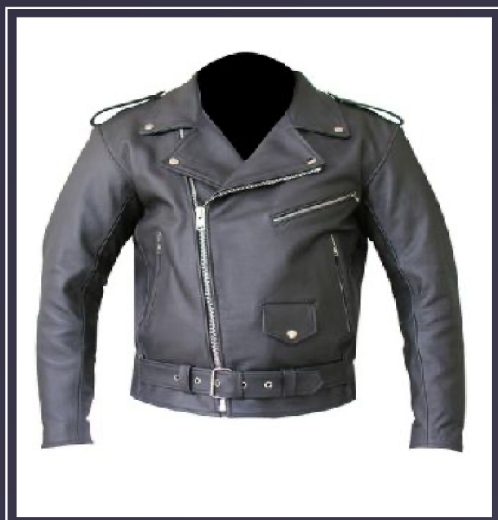
Ladies Grey Leather Jacket