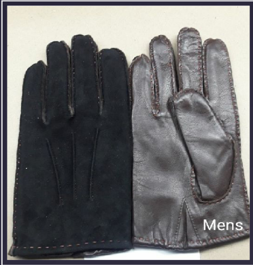
Mens Fashion Gloves

Size L, S Type Leather Fashion Gloves Material Leather, Pure Leather Use For Riding, Winter Use Product Type Hand Gloves Color Multicolor Gender Male Technics Attractive Pattern Features Easy To Wear, Good Quality