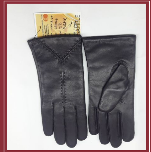
Women Fashion Gloves

Size L, M, S Type Leather Fashion Gloves Material Leather Use For Riding, Winter Use Product Type Hand Gloves Color Multicolor Gender Female Features Easy To Wear, Good Quality