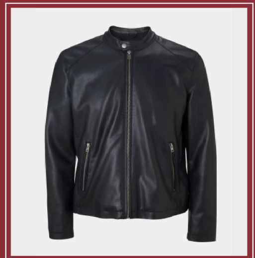
Mens Black Leather Jacket