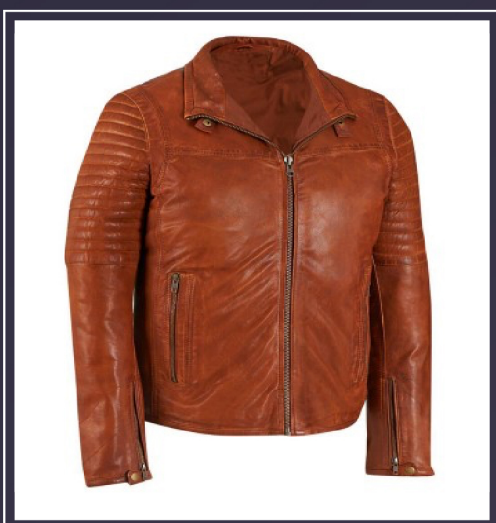
Mens Light Brown Leather Jacket