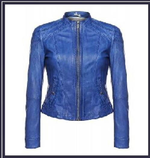
Ladies Royal Blue Leather Jacket