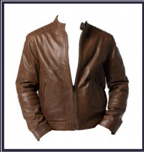
Mens Brown Leather Jacket