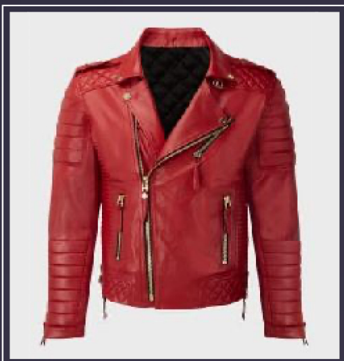
Ladies Red Leather Jacket