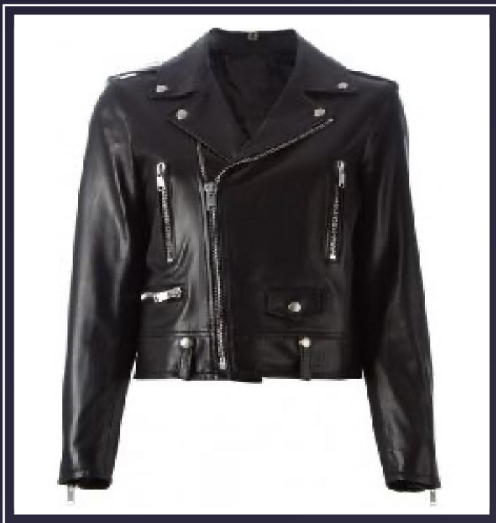
Ladies Black Leather Jacket