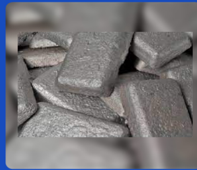
Copper Iron Alloy