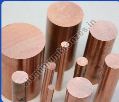
Nickel Silicon Chromium Copper Alloys