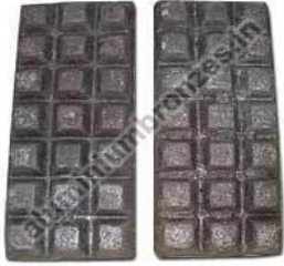
Copper Nickel Master Alloys