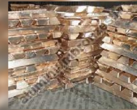
Copper Master Alloys