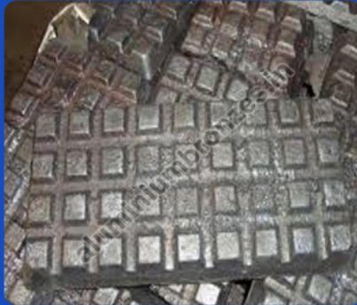
Copper Phosphorus Master Alloy