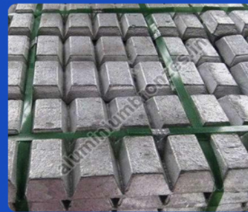
Tin Nickel Master Alloy