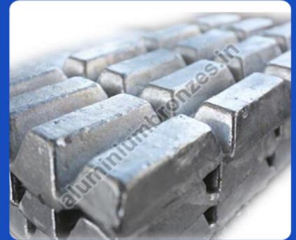
Copper Silicon Master Alloy