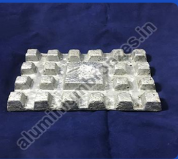
Tin Phosphorus Master Alloys