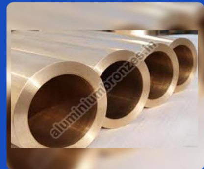
Beryllium Copper Alloys