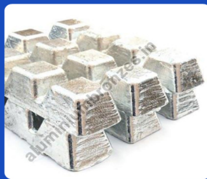
Copper Magnesium Mater Alloy