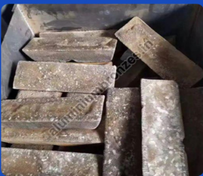
Copper Arsenic Master Alloy