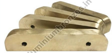
Aluminium Bronze Strip