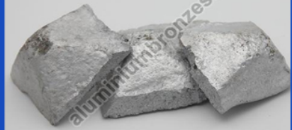
Aluminium Manganese Master Alloy