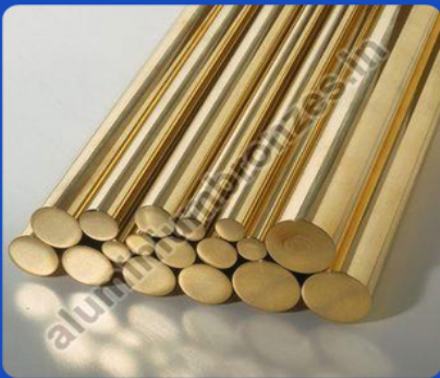
Beryllium Bronze Rods