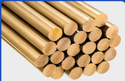
Aluminium Bronze Alloys