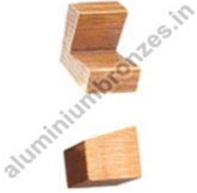
Projection Butt Welding Block