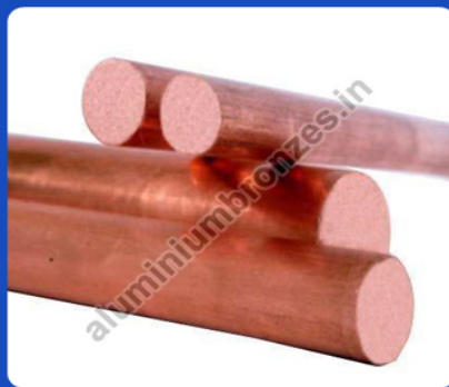
Copper Tellurium Rods