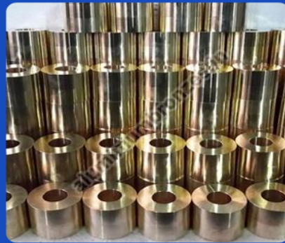
Aluminium Copper Master Alloy