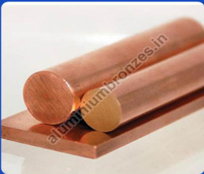
Chromium Zirconium Copper Alloys