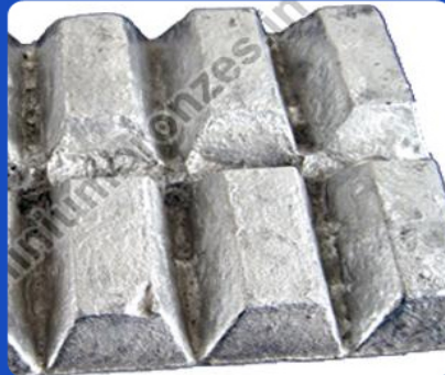
Nickel Phosphorus Master Alloy