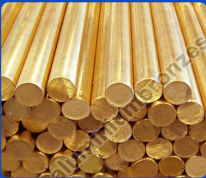
Copper Chromium Alloy