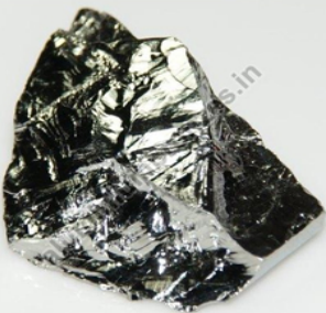
Germanium Tin Master Alloy