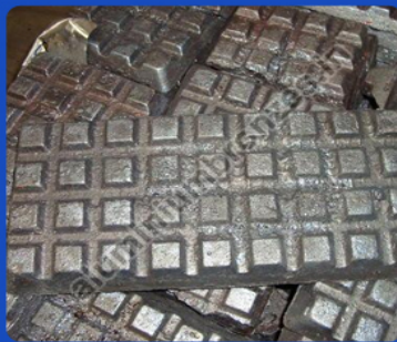
Tin Magnesium Master Alloys