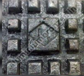
Copper Arsenic Alloy