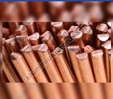
Copper Titanium Master Alloys