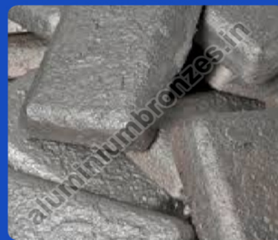
Copper Manganese Master Alloy