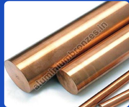
Zirconium Copper Alloys