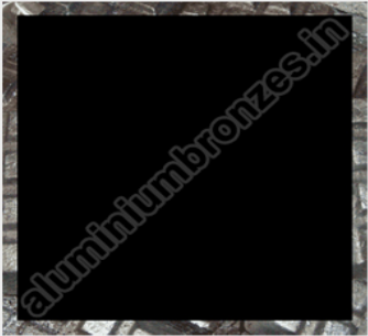
Copper Tellurium Master Alloys