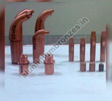
Holders, Adapters & Shanks