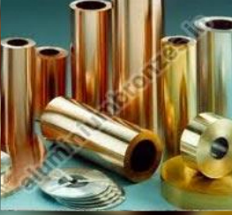
High Copper Alloys