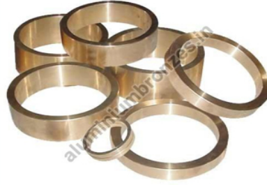
Aluminium Bronze Rings