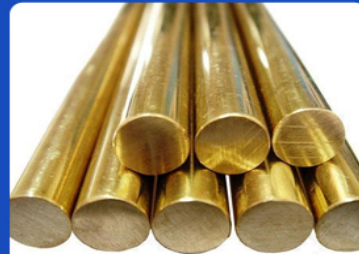
Aluminium Bronze Rods