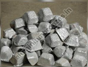
Aluminium Zirconium Master Alloy