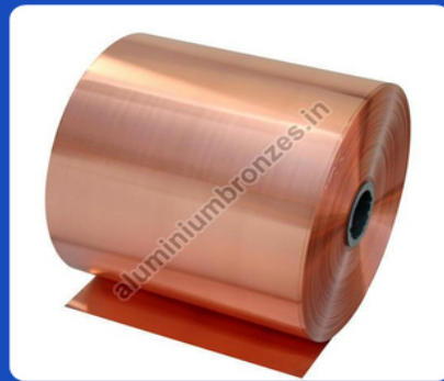
Copper Cobalt Nickel Beryllium Alloys