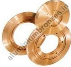
Seam Welding Wheels