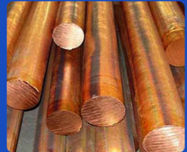
Aluminium Silicon Bronze Rods