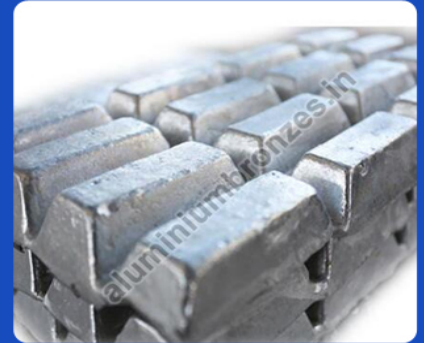
Copper Silicon Alloys