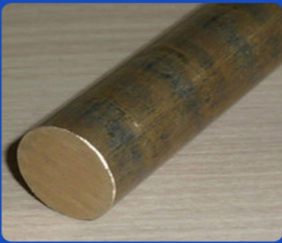
Bismuth Copper Alloy