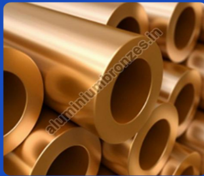
Chromium Copper Round Bar