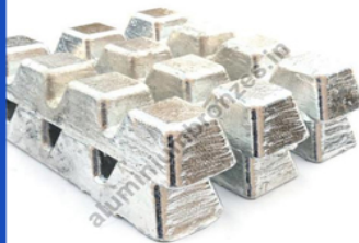
Aluminium Chromium Master Alloy