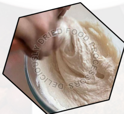
Ready to Cook Dal Vada Premix