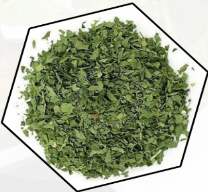
Dried Fenugreek Leaves