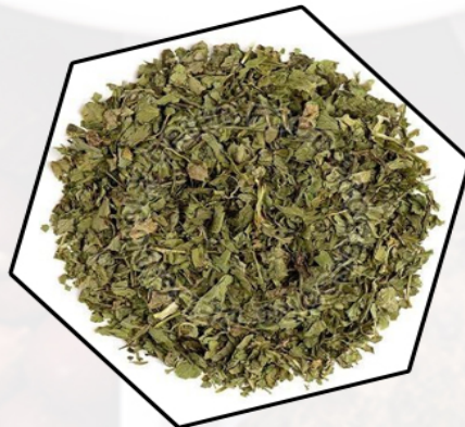
Dehydrated Coriander Leaves