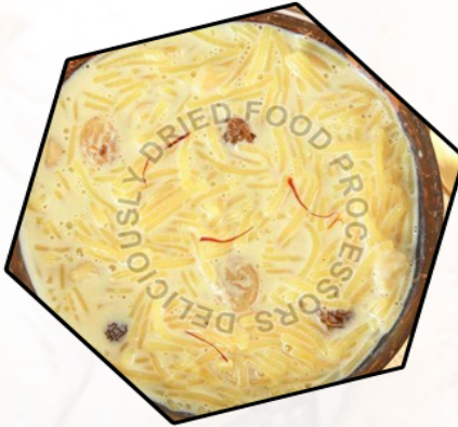
Ready to Cook Sevai Kheer