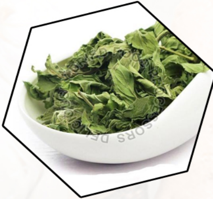
Dehydrated Mint Leaves