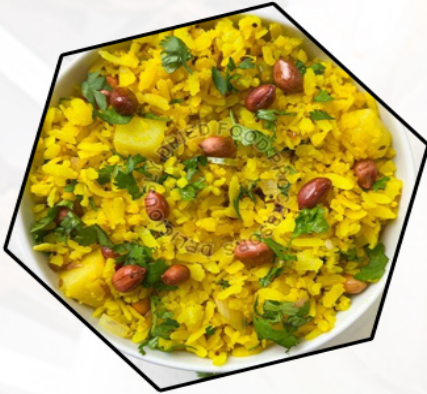
Ready to Cook Poha