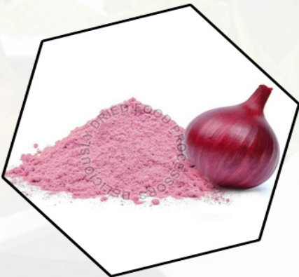
Dehydrated Onion Powder