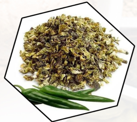
Dehydrated Green Chilli Flakes