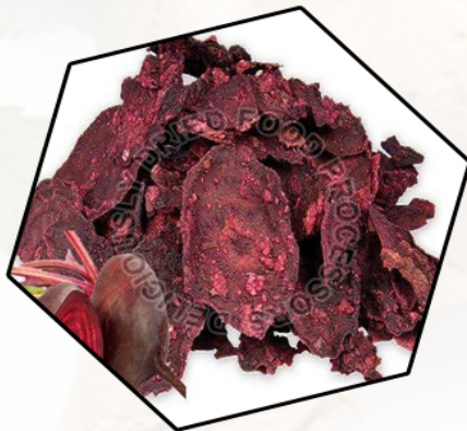
Dehydrated Beetroot Flakes