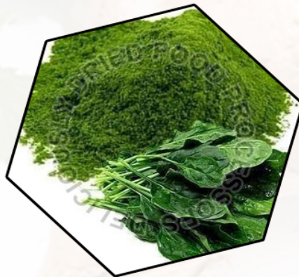
Dehydrated Spinach Powder