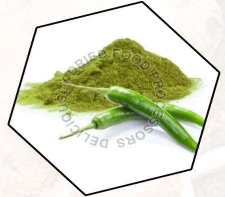
Dehydrated Green Chilli Powder