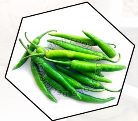
Fresh Green Chilli