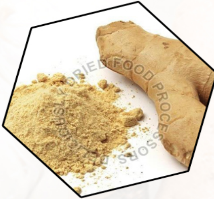
Dehydrated Ginger Powder