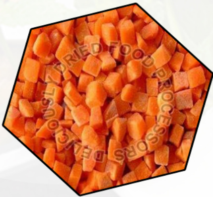
Dehydrated Carrot Cubes