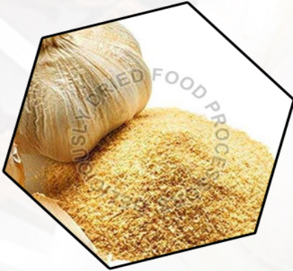
Dehydrated Garlic Powder