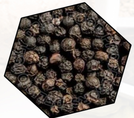
Sabut Kali Mirch