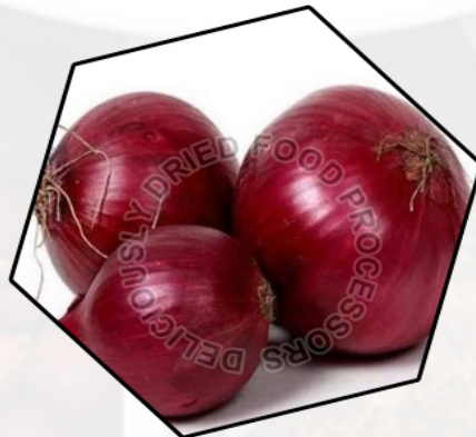
Fresh Red Onion