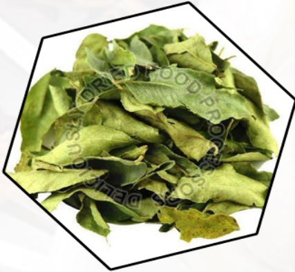
Dehydrated Curry Leaves