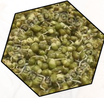
Dehydrated Moong Sprouts