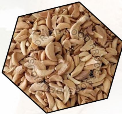
Dehydrated Garlic Cloves