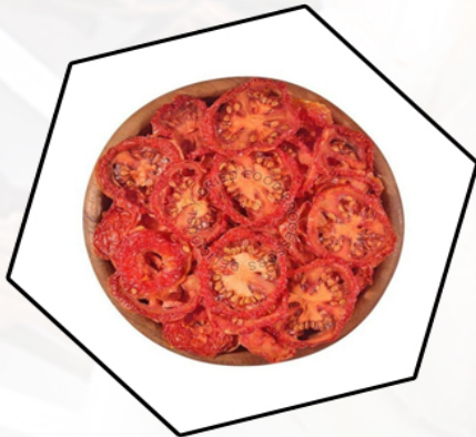
Dehydrated Tomato Slices