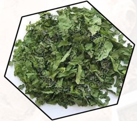
Dehydrated Spinach Leaves