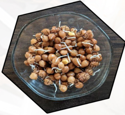
Dehydrated Chana Sprouts