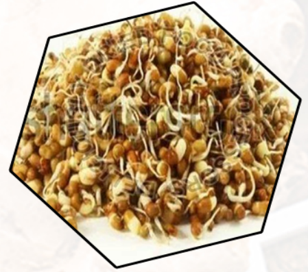
Dehydrated Sprouted Moth Beans