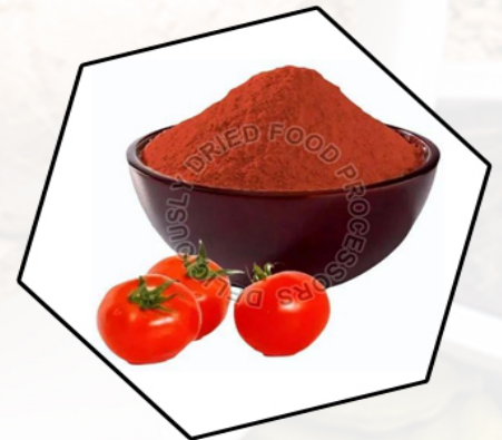
Dehydrated Tomato Powder