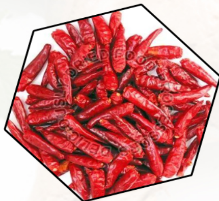
Dried Red Chilli Without Stem