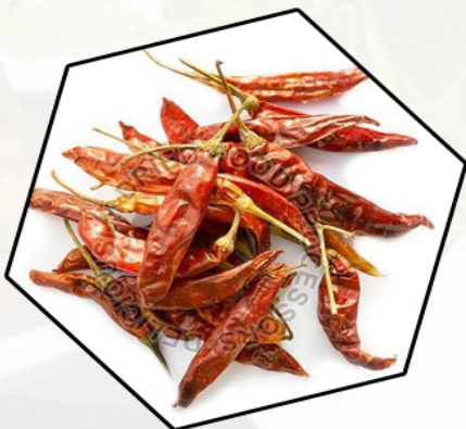
Dried Red Chilli with Stem