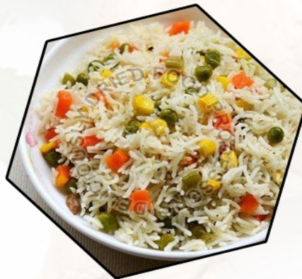
Ready to Cook Veg Pulao