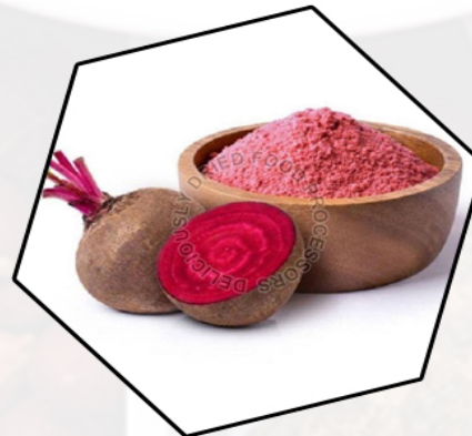
Dehydrated Beetroot Powder