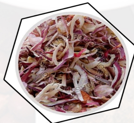
Dehydrated Onion Slices