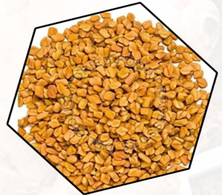
Dried Methi Dana