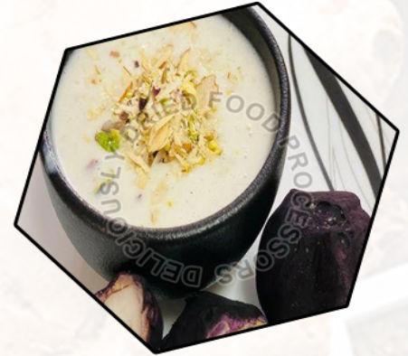
Ready to Cook Singhara Kheer