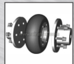
GEAR COUPLINGS PIN BUSH FLEXIBLE COUPLINGS BRAKE DRUM GEAR COUPLINGS BIBBY COUPLINGS TYRE COUPLINGS