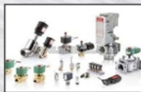
SOLENOID CONTROL VALVES