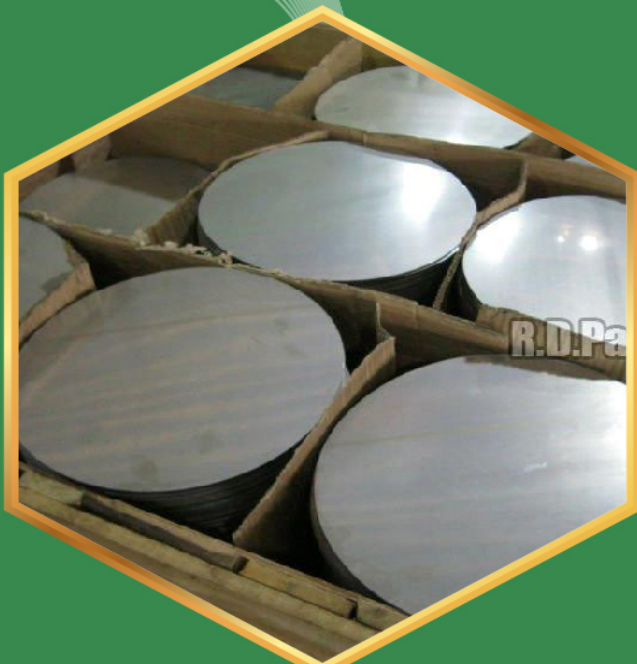
MILD STEEL CIRCLE