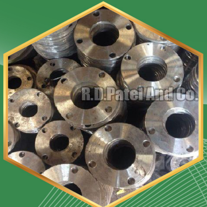
MILD STEEL FLANGES