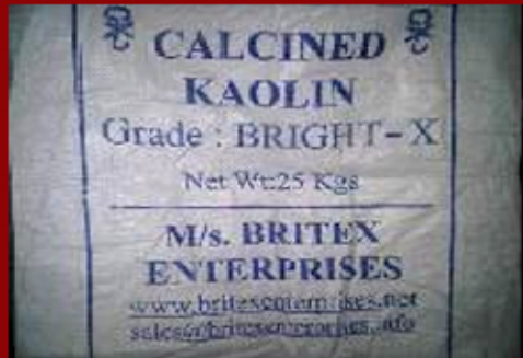
CALCINED KAOLIN POWDER