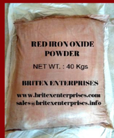
Red Oxide Powder