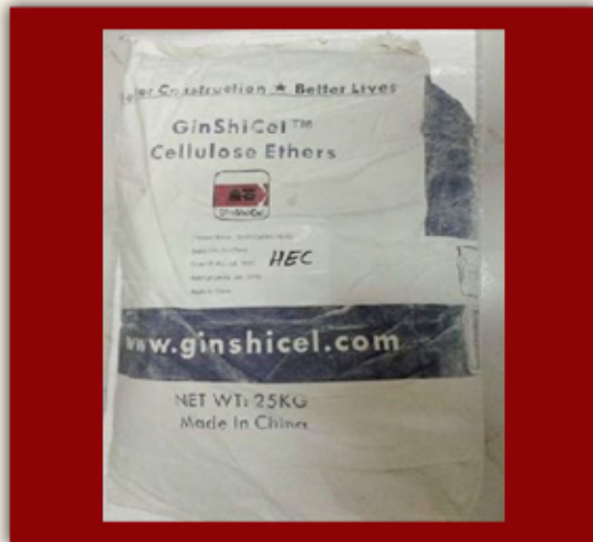
Hydroxy Ethyl Cellulose (HEC)