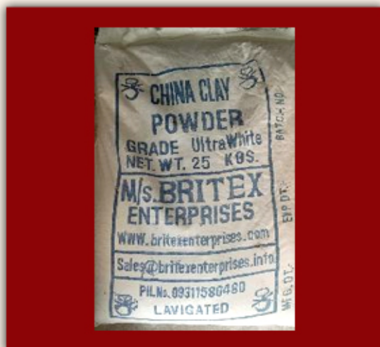
China Clay Powder