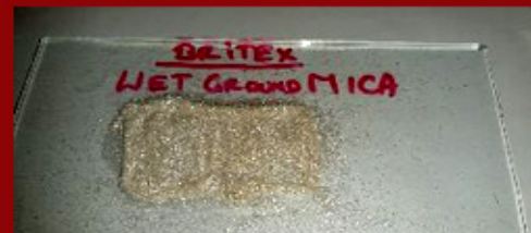
wet ground mica