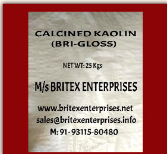
CALCINED KAOLIN- BRI GLOSS