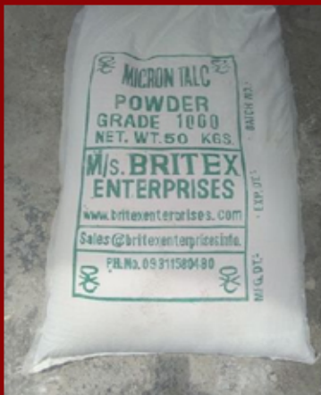
Talcum Powder (Industrial Grade)