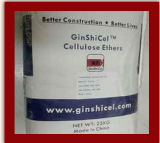
Hydroxy Ethyl Cellulose (HEC)