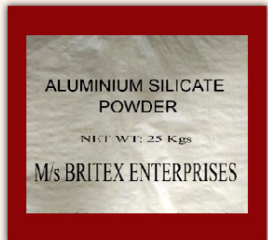
Aluminium Silicate Powder