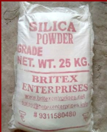
SILICA / QUARTZ POWDER