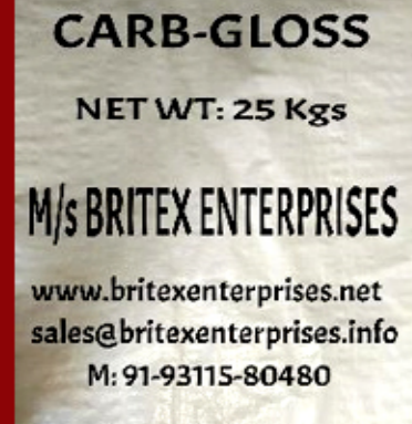
Carb Gloss Powder