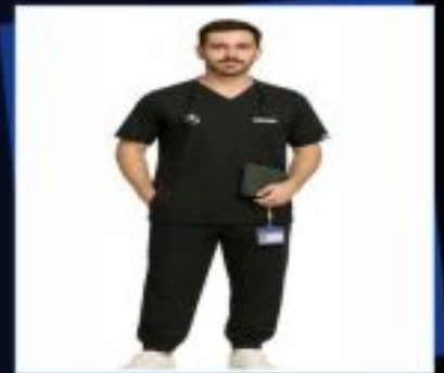
11 Pocket Men Medical Scrub Suits