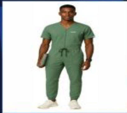
Men Medical Scrub Suit