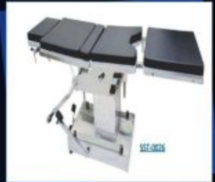
Hydraulic Operation Table