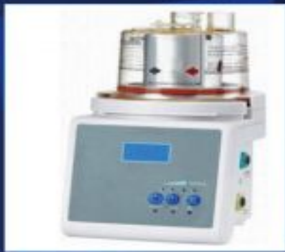
SHI-01 Respiratory Humidifier