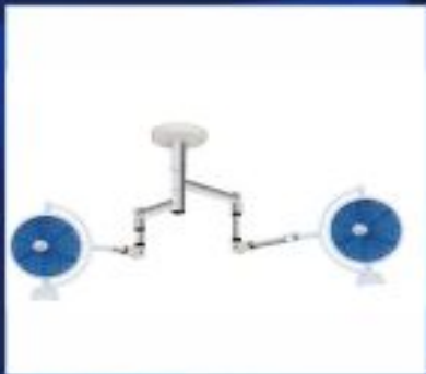
Shi - 60 Adjustable Colour Temperature LED Light