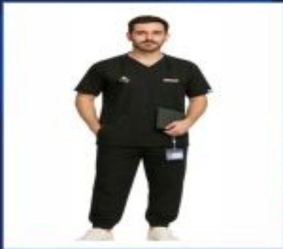
8 Pocket Women Medical Scrub Suits