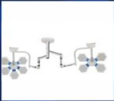
Shi - 23 Adjustable Colour Temperature LED Light