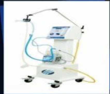
Restohealth 02 Bubble CPAP Machine