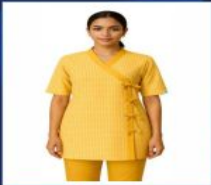
Yellow Women Patient Gown