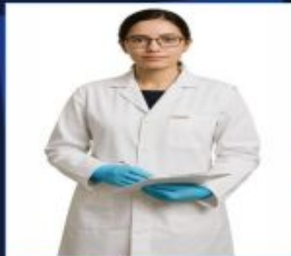
Women Lab Coat