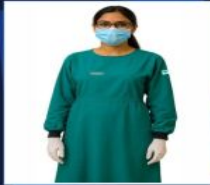
Women Surgeon Gown