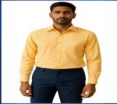
Mens Gda Uniform