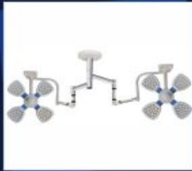
Shi - 28 Adjustable Colour Temperature LED Light