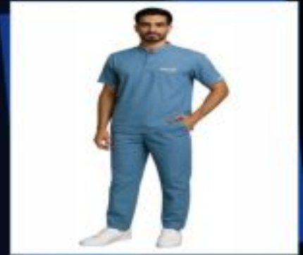
8 Pocket Men Medical Scrub Suits