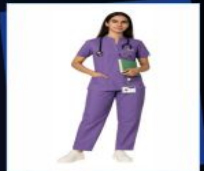
4 Pocket Women Medical Scrub Suits