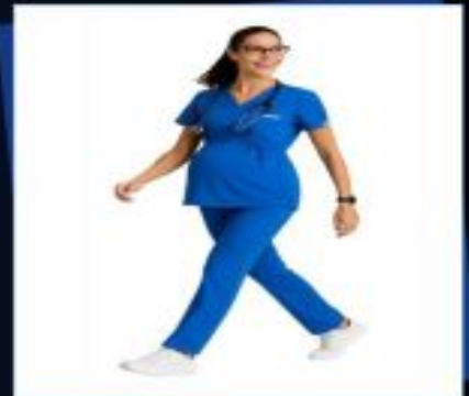
Blue Maternity Scrubs Uniform