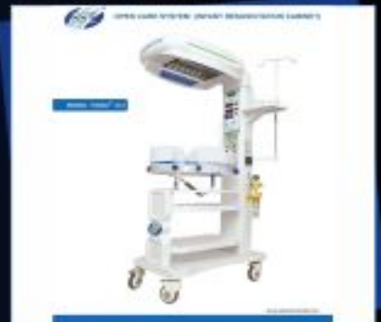
Tiana-D2 Open Care System