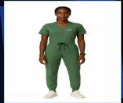
Women Medical Scrub Suit