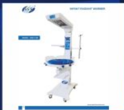
IRW-1723 Infant Radiant Warmer