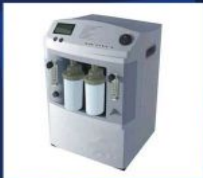
Medical Oxygen Concentrators