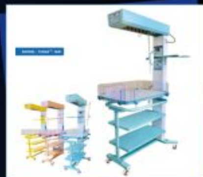
TIANA-NW Infant Radiant Warmer