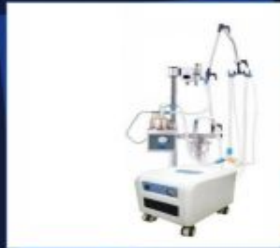
Restohealth 01 Bubble CPAP System