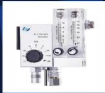
SHI-24 Air Oxygen Blender