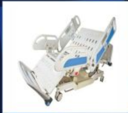
Electric ICU Bed