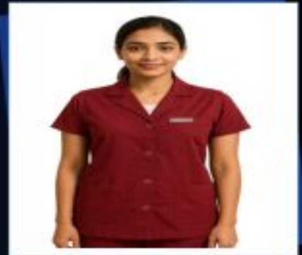
Maroon Women Lab Coat