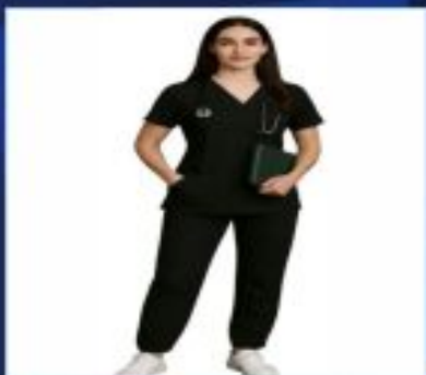
11 Pocket Women Medical Scrub Suits