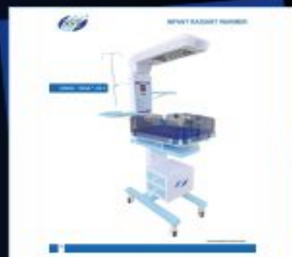
TIANA-DX2 Infant Radiant Warmer