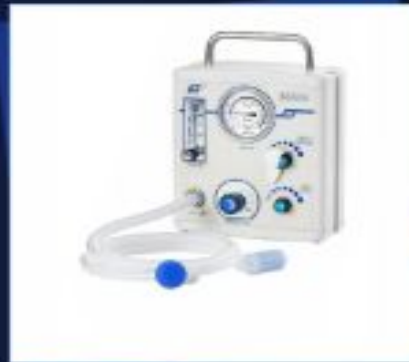
RESP-17 Infant Resuscitator