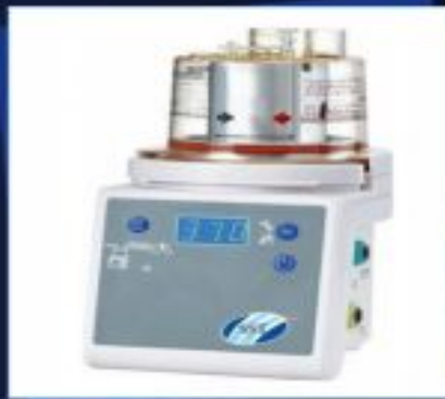
SHI-02 Respiratory Humidifier