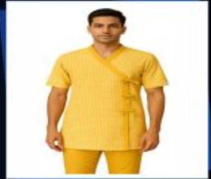
Yellow Mens Patient Gown