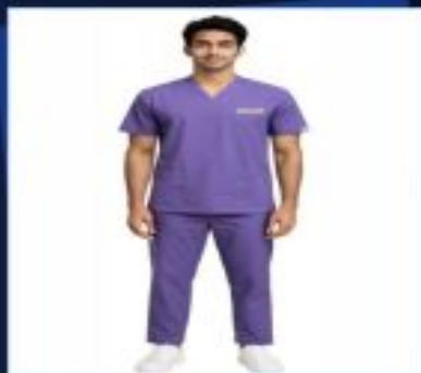
4 Pocket Men Medical Scrub Suits