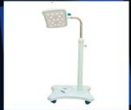
LED Phototherapy Unit