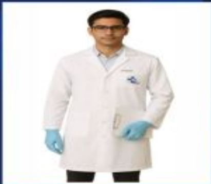
Mens Lab Coat