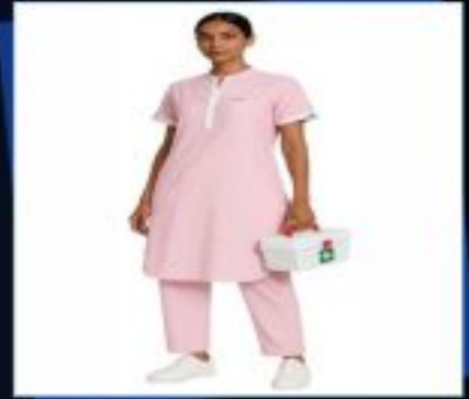
Women Gda Uniform