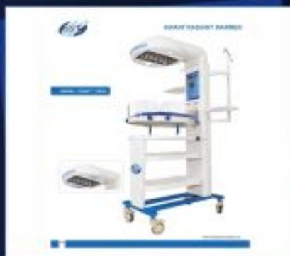
TIANA-DXE Infant Radiant Warmer