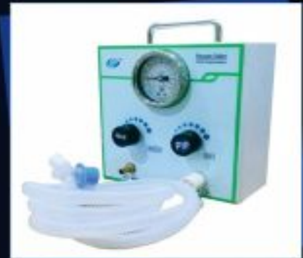
RESP-23 Infant Resuscitator