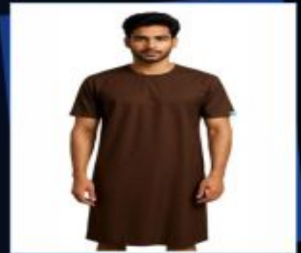
Mens Patient Gown