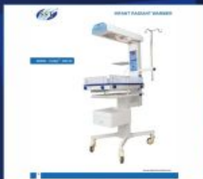
TIANA-NWDX Infant Radiant Warmer