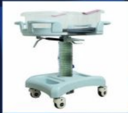
Hospital Baby Bassinet Trolley