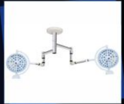
Shi - 48 Adjustable Colour Temperature LED Light