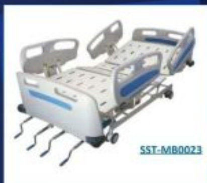
SST-MB0023 Electric ICU Bed