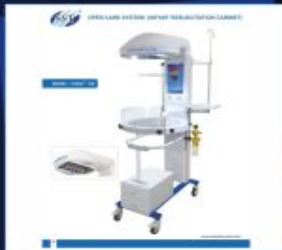
Tiana Dx Open Care System