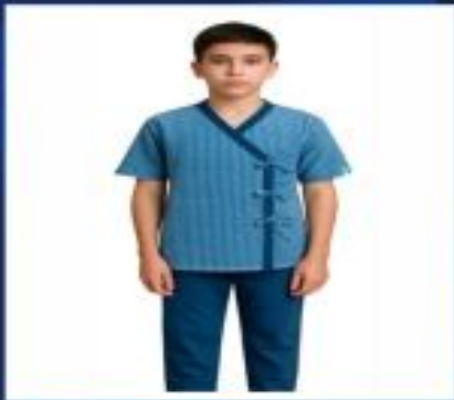
Kid Patient Gown