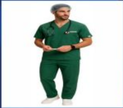
6 Pocket Men Medical Scrub Suits