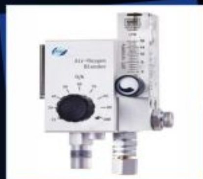
SHI-17 Air Oxygen Blender