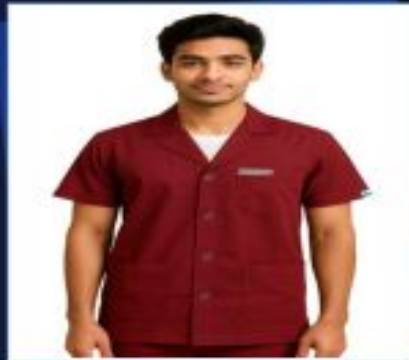
Maroon Mens Lab Coat