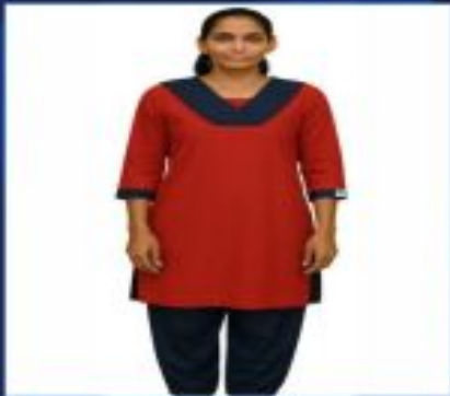
Women House-keeping Uniforms