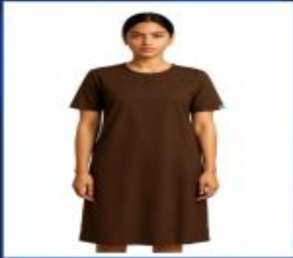
Women Patient Gown