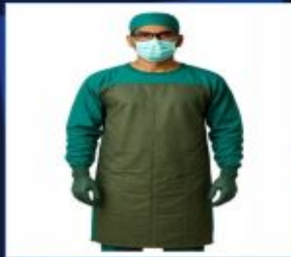
Men Surgeon Gown