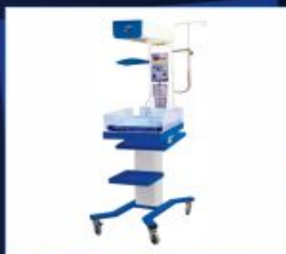
TIANA-S Infant Radiant Warmer