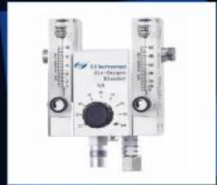
SHI-26 Air Oxygen Blender