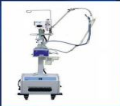
Restohealth 03 Bubble CPAP Machine