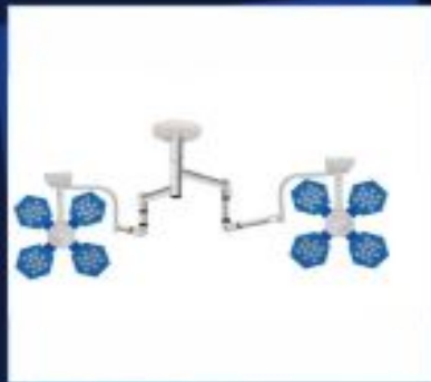
Shi 2 Adjustable Colour Temperature LED Light