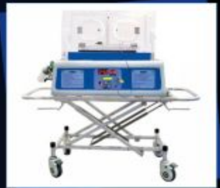
INC-TRP Transport Incubator