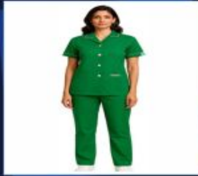
V Shape Green Nurse Uniform