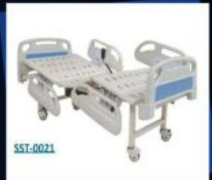
SST-0021 Electric ICU Bed