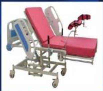
Labour Delivery Room Bed