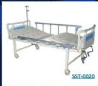
SST-0020 Electric ICU Bed