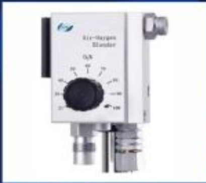
SHI-23 Air Oxygen Blender