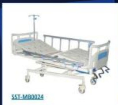
SST-MB0024 Electric ICU Bed