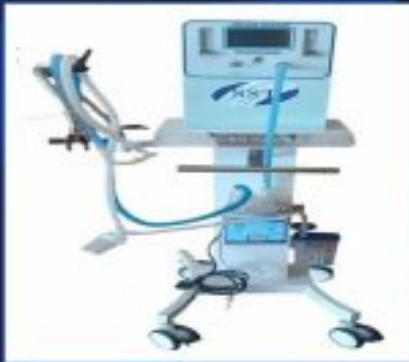
Bubble CPAP Machine