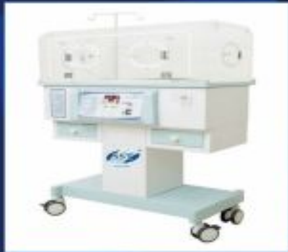
Inc 1723D Baby Incubator