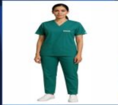
6 Pocket Women Medical Scrub Suits