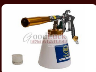
Tornado Car Cleaning Gun