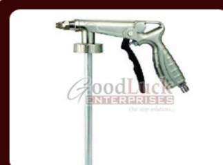
Anti Rust Gun