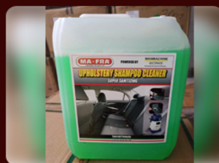
MAFRA Upholsetry Cleaner