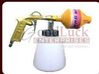
Car Wash Air Foam Gun