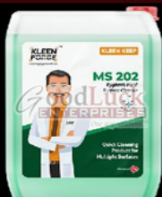
Surface Disinfectant Spray