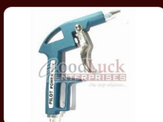
Air Below Gun