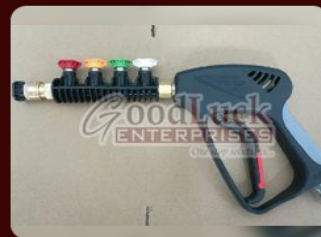
High Pressure Car Washing Gun