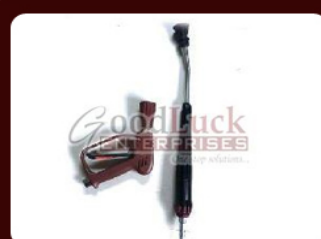
Water Car Wash Gun