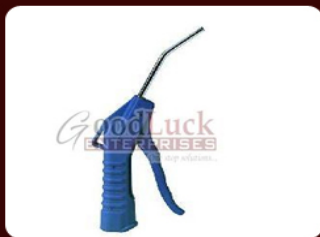
Air Pressure Gun