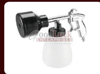
Shampoo Foam Spray Gun