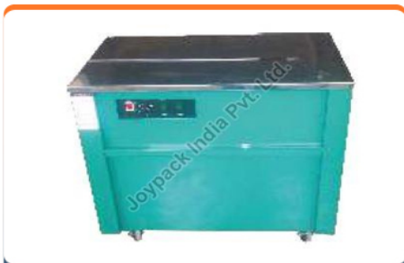
Heavy Duty Semi-Automatic Strapping Machine