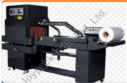
Semi Automatic Shrink Packing Machine