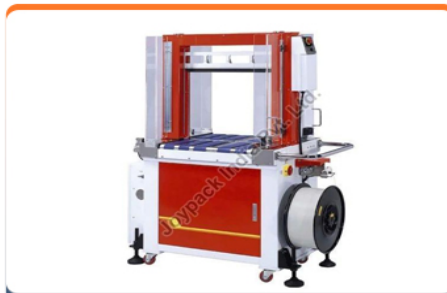
220V Automatic Strapping Machine