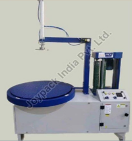
Carton Wrapping Machine