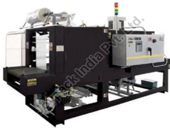
240V Tray Shrink Wrapping Machine