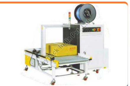
Fully Automatic Strapping Machine with Free Roller Table