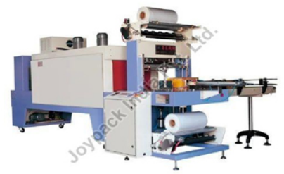
230V Tray Shrink Wrapping Machine