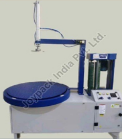
Box Wrapping Machine