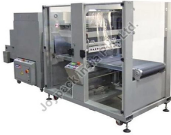
Pharmaceutical Sleeve Wrapper