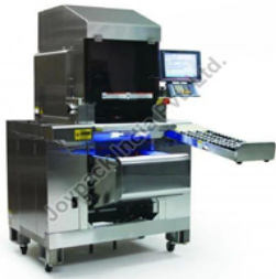
Automatic Tray Wrapping Machine