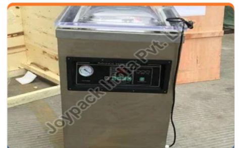
Single Chamber Vacuum Packaging Machine