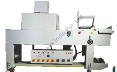
Heavy Duty Semi Automatic L-Type Sealing Machine