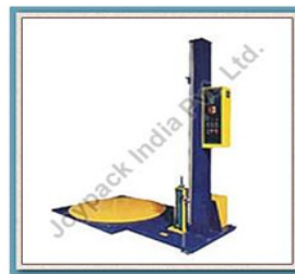
Pallet Stretch Wrapping Machine