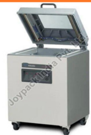
200 V Vacuum Packaging Machine