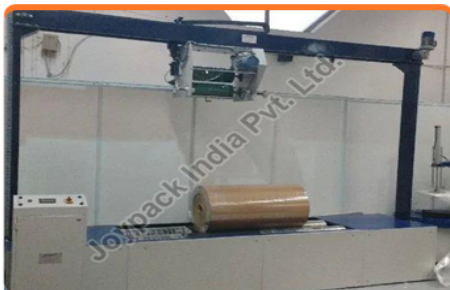
Paper Reel Packing Machine