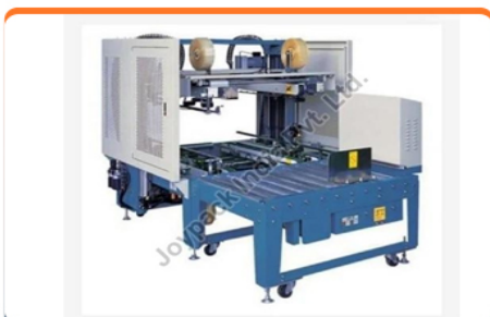
440V Edge Sealing Machine