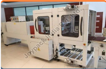
Automatic Web Sealer Machine