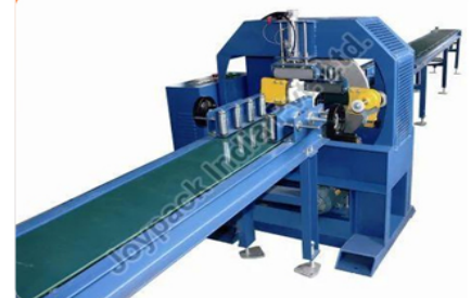
Horizontal Stretch Wrapping Machine