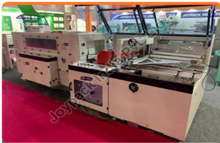
Integral Vertical Collator Wrapping Machine