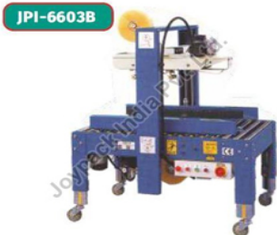
JPI-6603B Automatic Carton Sealing Machine