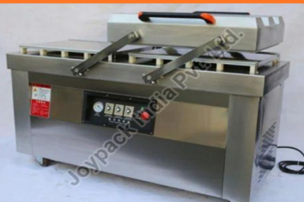
Double Chamber Vacuum Packaging Machine