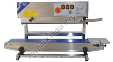
Continuous Band Sealer