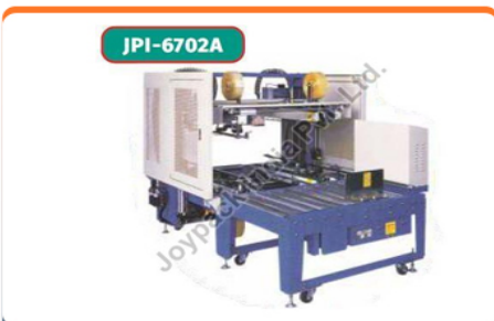
Fully Automatic Carton Edge Sealing Machine