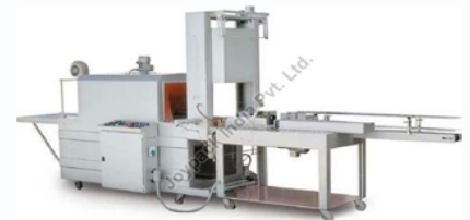
Paper Bundle Shrink Wrapping Machine