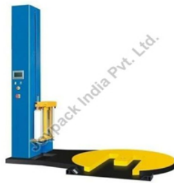
Power Jack Stretch Pallet Wrapper