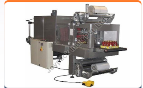
Automatic Bottle Packaging Machine