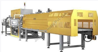
Water Bottle Shrink Wrapping Machine