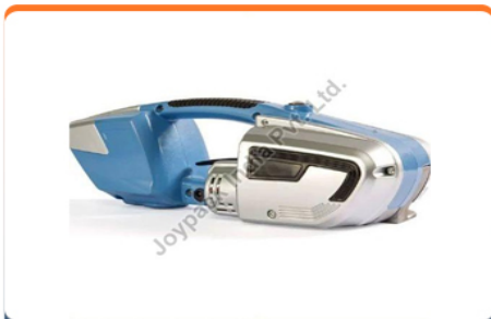
Battery Powered Plastic Strapping Machine