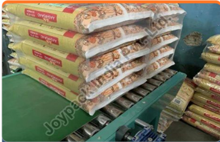
Aata Bag Shrink Packing Machine