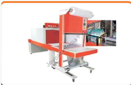
Web Sealing Machine