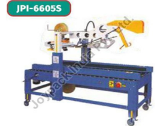
220V Flap Folding Carton Sealing Machine