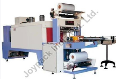
Semi Automatic Wrapping Machine