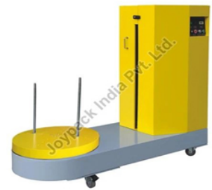
Luggage Wrapping Machine