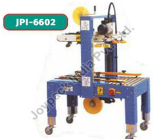
Top and Bottom Drive Type Carton Sealing Machine