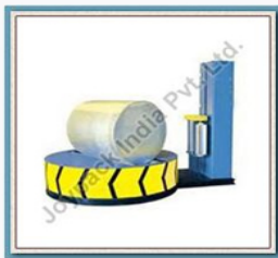
Reel Wrapping Machine