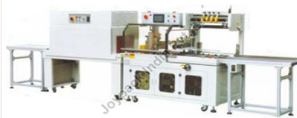
Automatic High Speed Side Sealing Machine