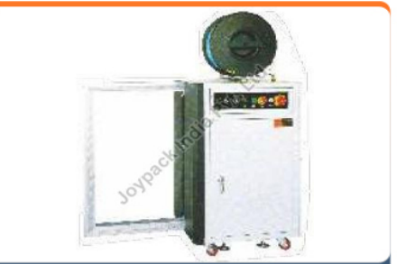
JPI-85YU Fully Automatic Strapping Machine