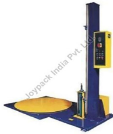
JP-705 Pallet Wrapping Machine