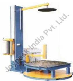
Light Duty Stretch Wrapping Machine