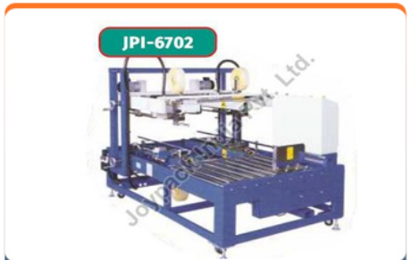
Semi-Automatic Carton Edge Sealing Machine