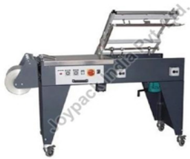
Semi Automatic L-Type Sealing Machine