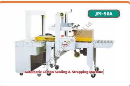
Automatic Carton Sealing and Strapping Machine