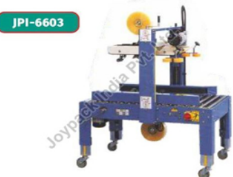
Top and Side Drive Type Carton Sealing Machine