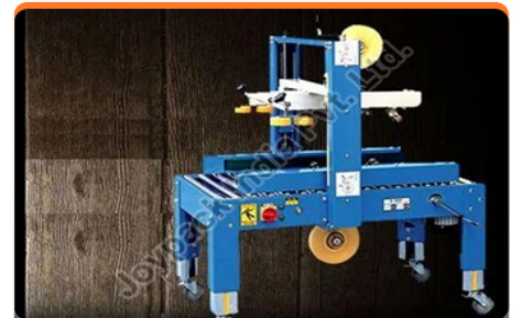
50 Hz Flap Folding Carton Sealing Machine