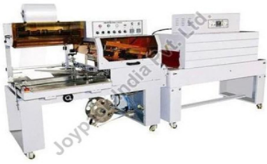
Automatic L-Type Sealing Machine