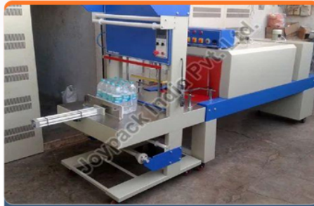
Bottle Web Sealer Machines