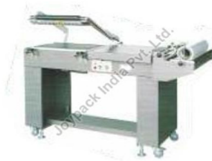
Electro Magnetic L-Type Sealing Machine