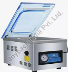
Automatic Vacuum Packaging Machine