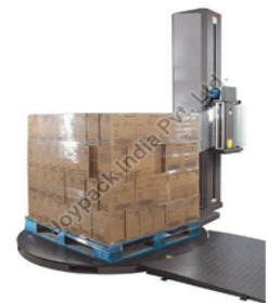
Single Phase Stretch Wrapping Machine