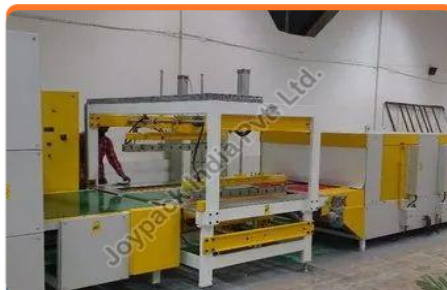
Rigid Duplex Board Packing Machine