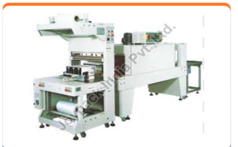
Semi Automatic Sleeve Sealing and Shrink Packaging Machine