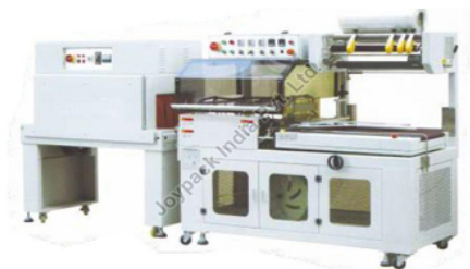
Automatic L Bar Sealing Machine