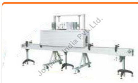
JPI-SS1024 Shrink Tunnel Packaging Machine