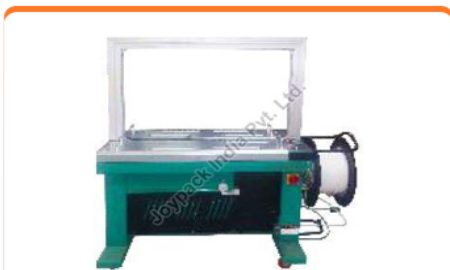
Fully Automatic Packaging Machine