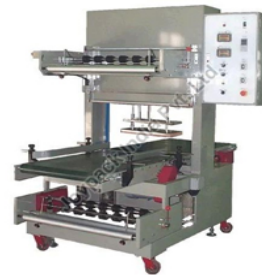
Collating and Shrink Wrapping Machine