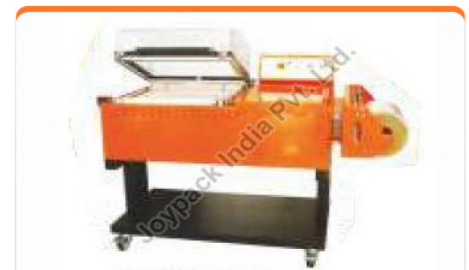
L-Type Hood Shrink Packaging Machine