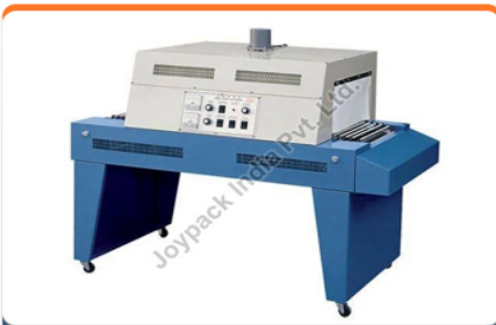
In-line Automatic Strapping Machine