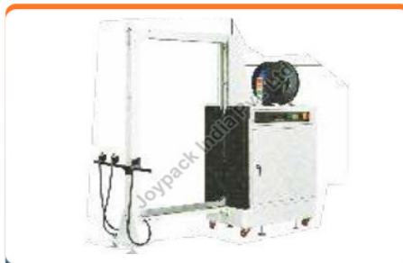
Big Arch Type Fully Automatic Strapping Machine