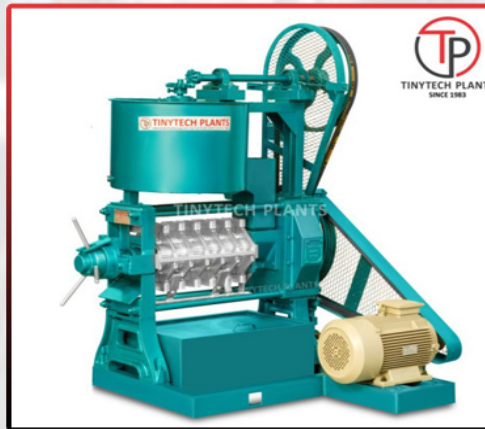
Cottonseed Oil Expeller