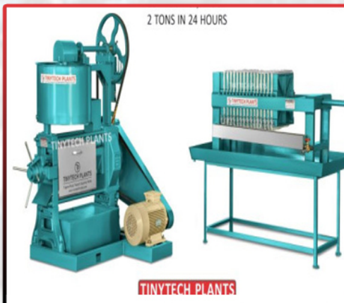
mustard oil expeller