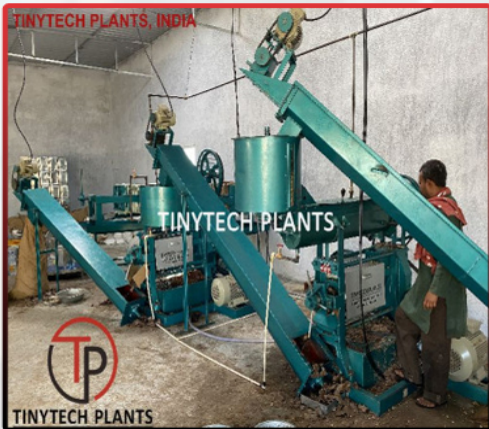
automatic Groundnut oil mill plant