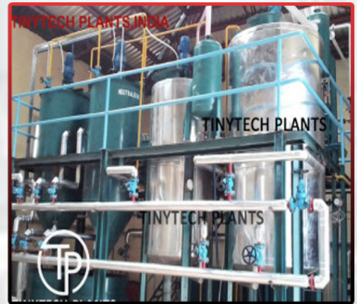
Oil Refinery Plant