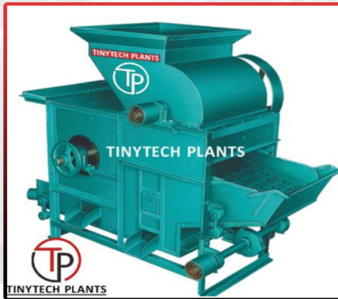
Groundnut Decorticator With 4 Hp Motor