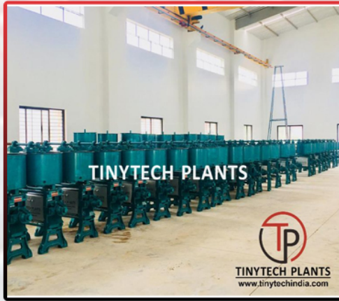
MUSTARD OIL MILL PLANT