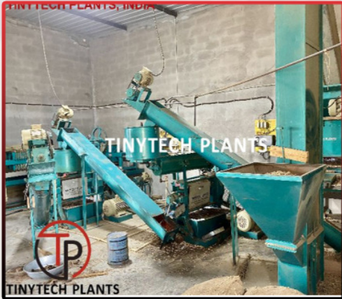
oil milling plant