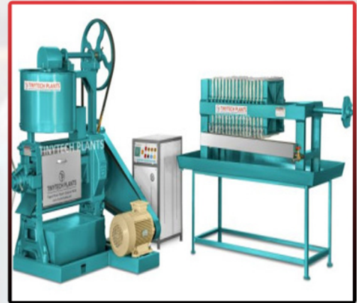
groundnut oil expeller