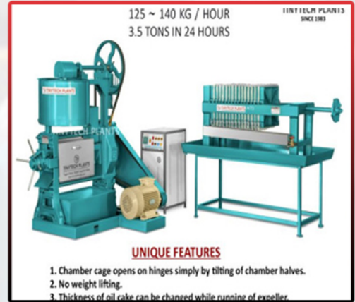
Edible Oil Extraction Machinery