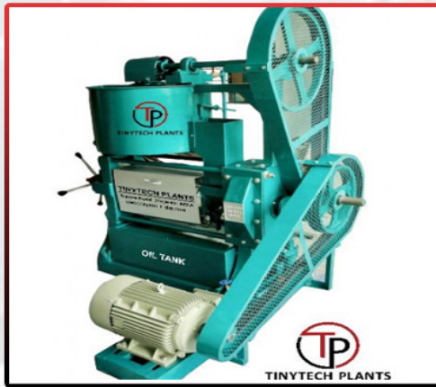
OIL EXPELLER WITH COOKING KETTLE