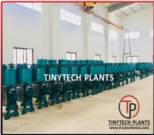
SUNFLOWER OIL MILL PLANT