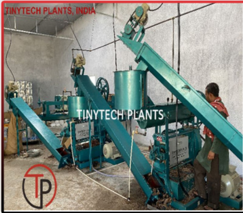
Automatic Oil Mill Machinery