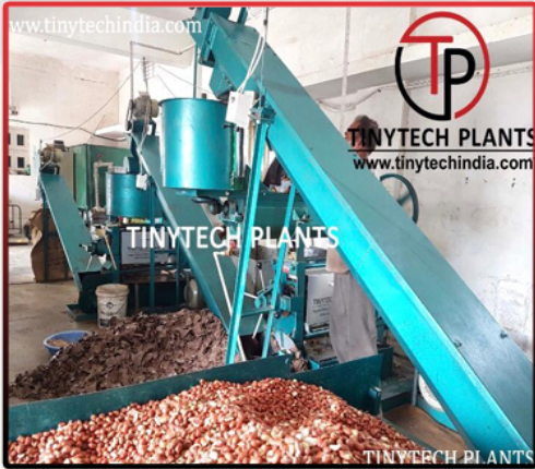
MINI GROUNDNUT OIL MILL PLANT HGROUNDNUT OIL MILL PLANT