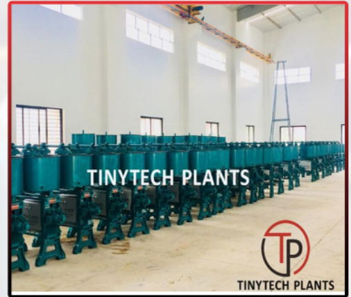
Tinytech Oil Expellers