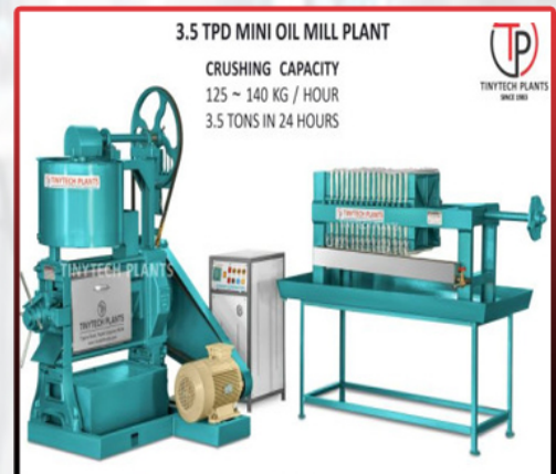
Oil Expeller With Cooking Kettle