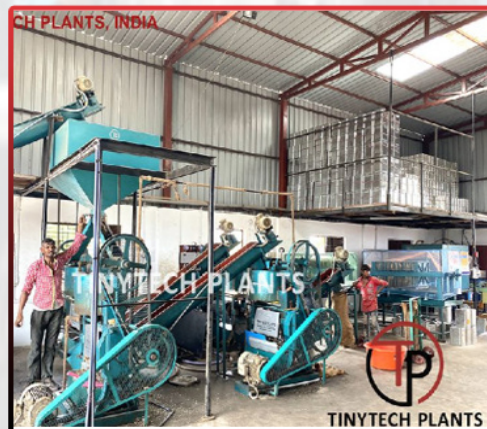
12 Tons Per Day Fully Automatic Oil Mill Plant