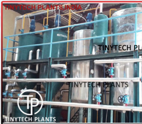
EDIBLE OIL REFINERY PLANTS