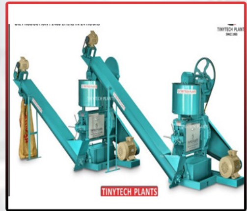
Automatic Mustard Oil Mill Plant