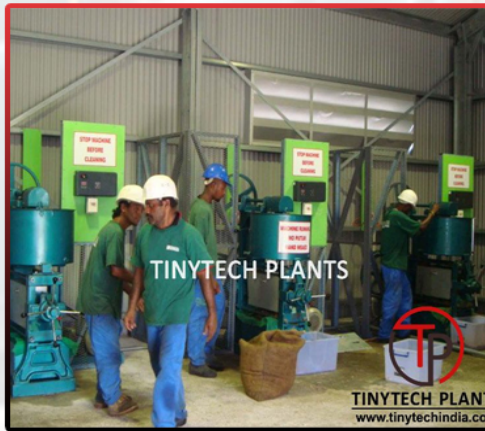
Sunflower Oil Mill Plant