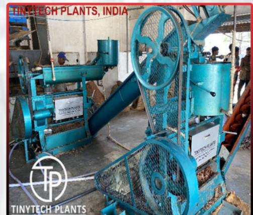
6 Tons Automatic Oil Mill Plant