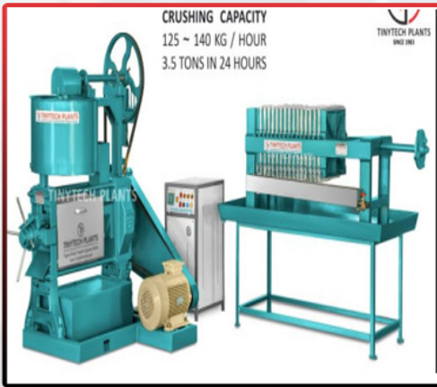
Mini Oil Expeller