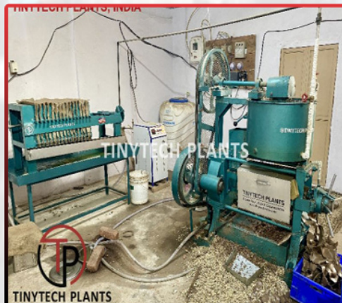
Mini Oil Mill Plant