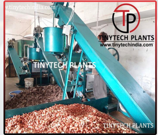
automatic Groundnut oil mill plant