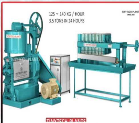
MINI GROUNDNUT OIL MILL PLANT