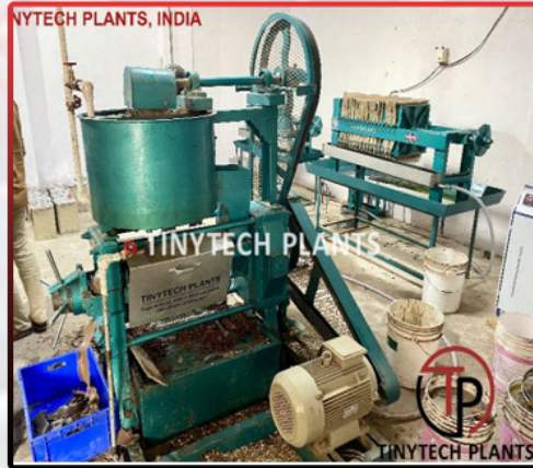
Mini Oil Machinery