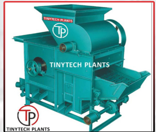
Groundnut Decorticator With 2 Hp Motor