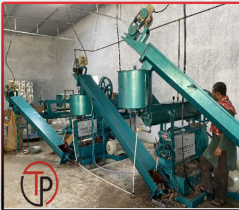
Semi Automatic Oil Mill Plant