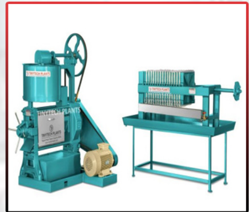
Coconut Oil Mill Plant