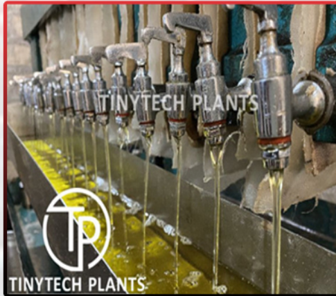
Oil Filter Press