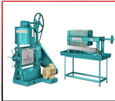
coconut oil expeller