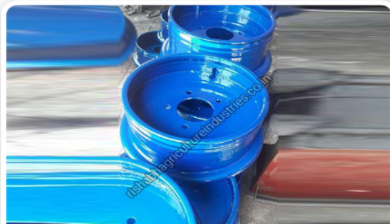
5 Hole Wheel Rim

Our team members and quality auditors keep regular checks on the quality of products and thus, even the raw material used is tested under vigil supervision to ensure better quality products. We are capable of entertaining the urgent and bulk requirements of the customers owing to the dependable logistics facilities.