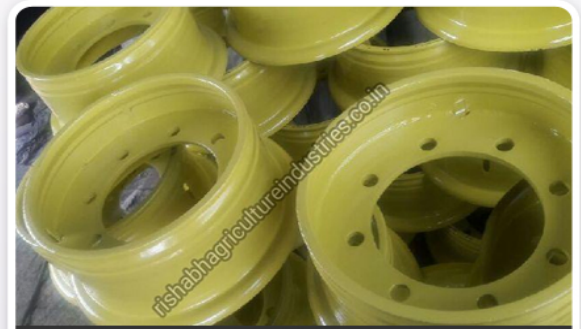
8 Hole Wheel Rim

After the product is completely inspected, we make sure that it is sternly packed using the finest packaging material. Our team members ensure that the packaging keeps the products safe from external destructive factors. Since inception, our company has upheld its policy to make timely delivery. Thus, we guarantee to deliver products to buyers doorsteps on the dates promised.