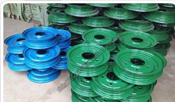
Thresher Machine Axle

As we follow the automated warehousing system, we ensure safe assembling as well as storage of the entire lot. Moreover, the system is well managed by our team of experts. Working in close coordination with the genuine logisticians, we dispatch the products in the dedicated time.