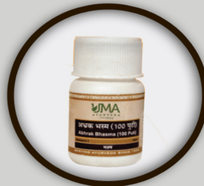
ABHRAK BHASMA (100PUTI)