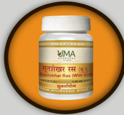
SUTSHEKHAR RAS (WITH GOLD)