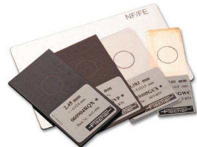
As a DAkks-accredited company, FISCHER offers a variety of calibration standards

A USB port is available for transferring the data to a PC or laptop, where, using the FISCHER DataCenter software, the values are quickly imported and easy-to-read reports generated.