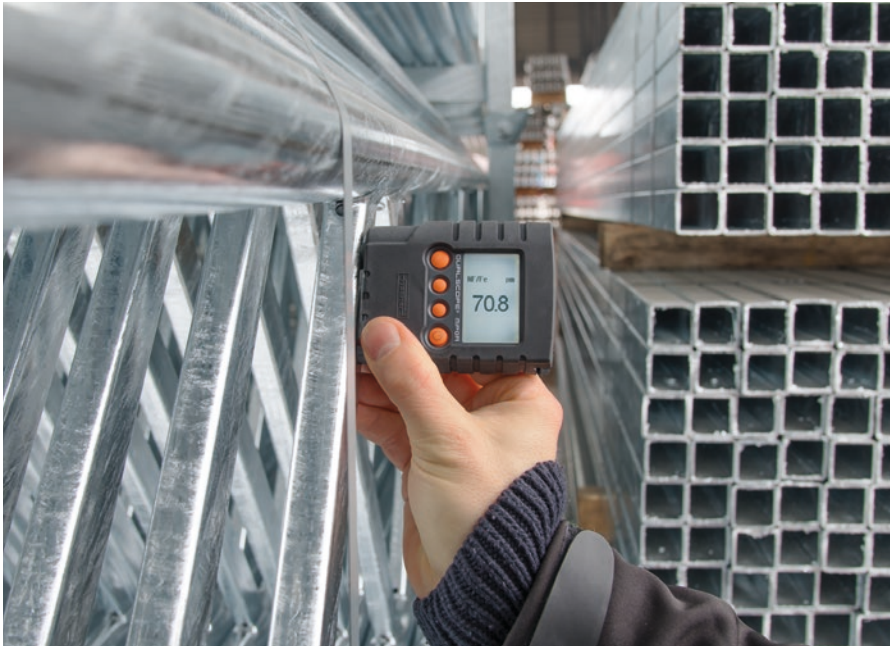
The lit display rotates automatically, allowing easy readout in any measurement position