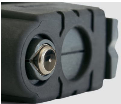
The carbide probe tip is especially wear-resistant and stands up to thousands of measurements

For fast and error-free reading of the measurement results, the devices are equipped with two lighted graphical displays. When measuring overhead or on slanted or vertical surfaces, the display rotates automatically. An LED on the top of the unit signals whether the value just taken is within the tolerances previously entered.