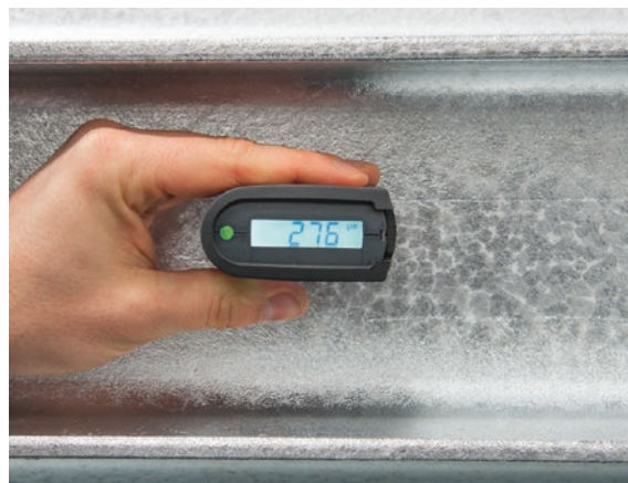
An LED shows immediately whether the value is within tolerance

To ensure stable positioning on the sample, the devices are equipped with a three-point support. That combined with curvature compensation guarantees reliable measurements even on non-flat surfaces.