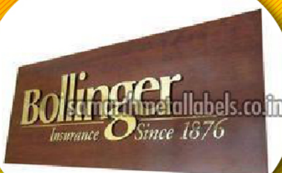
Brass Name Plates