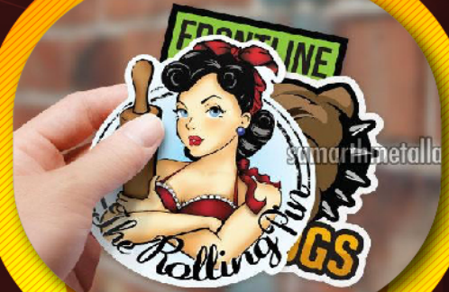
Die Cut Stickers