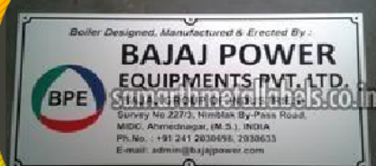
Metal Name Plates