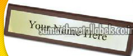
Stainless Steel Table Name Plates