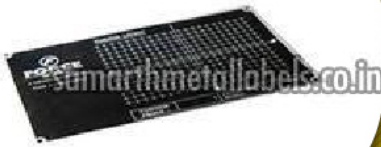
Paper Promotional Stickers