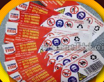
Vinyl Promotional Stickers