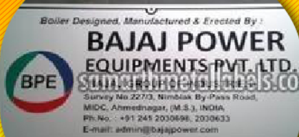
Aluminium Etched and Painted Name Plates