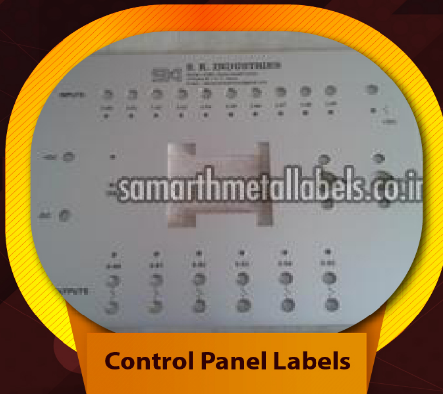
Control Panel Labels