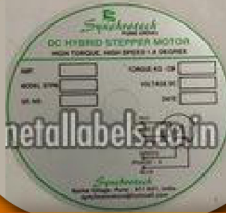
Silver Foil Promotional Stickers