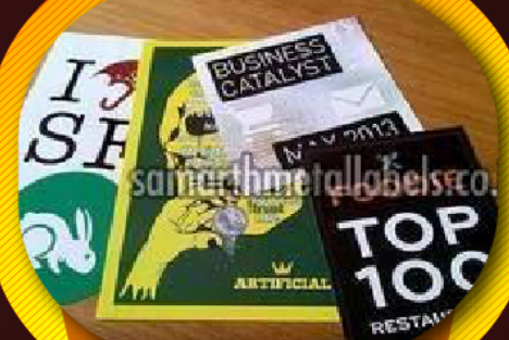
Business Promotional Stickers