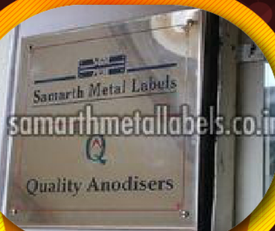
Stainless Steel Etched Nameplate