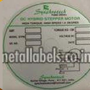
Foil Promotional Stickers