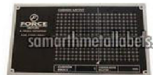
Adhesive Promotional Stickers