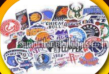
PVC Promotional Stickers