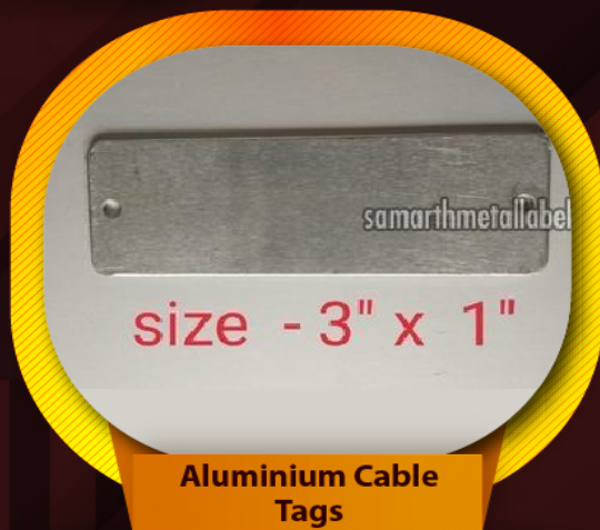
Aluminium Cable Tags