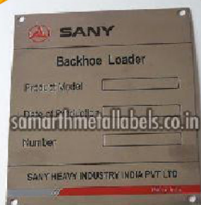
Stainless Steel Etched & Painted Name Plates