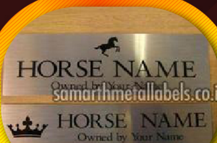
Stainless Steel Door Name Plates