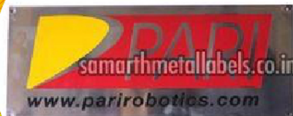
Metal Promotional Stickers