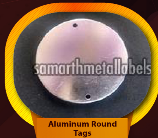
Aluminum Round Tags

Material Aluminium Minimum Order Quantity 2000 Piece Size 3" X 1" X 1 MM THK. Packaging Type Standard Color White Brand Samarth Metal Item Code 8310