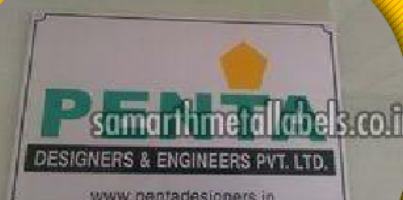
Anodized Aluminum Nameplates