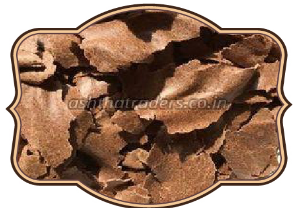
PURE MUSTARD SEEDS OIL CAKE