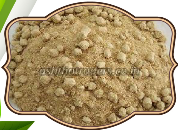
NATURAL DE OILED RICE BRAN