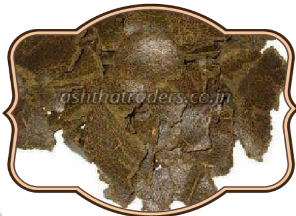
POULTRY MUSTARD SEEDS OIL CAKE