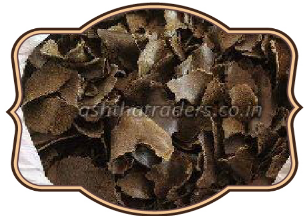
ORGANIC MUSTARD OIL CAKE