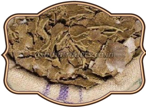
HIGH GRADE MUSTARD SEEDS OIL CAKE