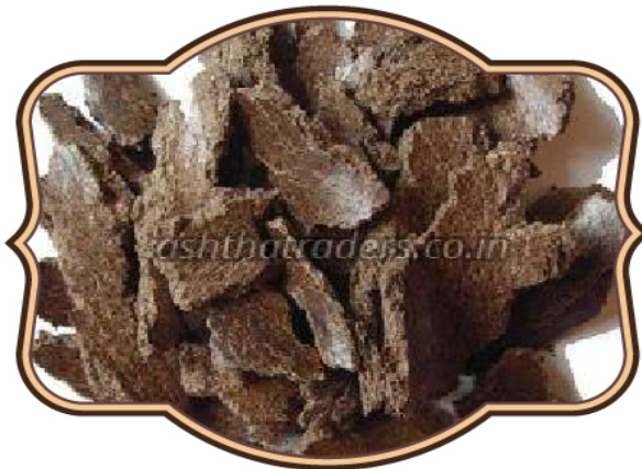
NATURAL MUSTARD OIL CAKE