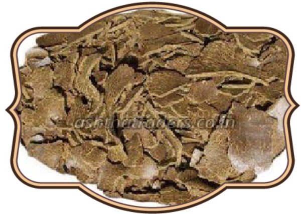
MUSTARD DE OILED CAKE