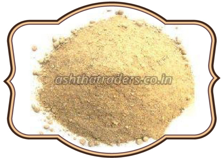
REFINED DE OILED RICE BRAN