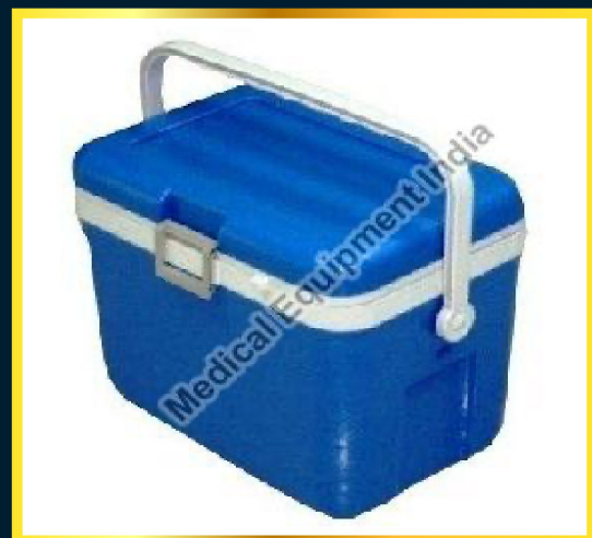
Vaccine Carrier Box