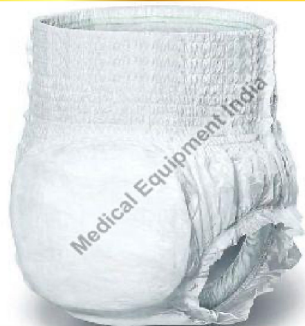
Pull Up Diaper