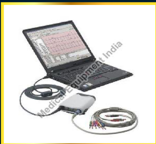
PC ECG Machine