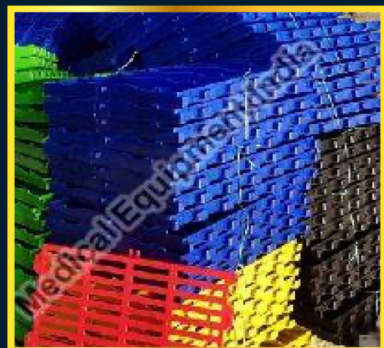
Plastic Slatted Floor