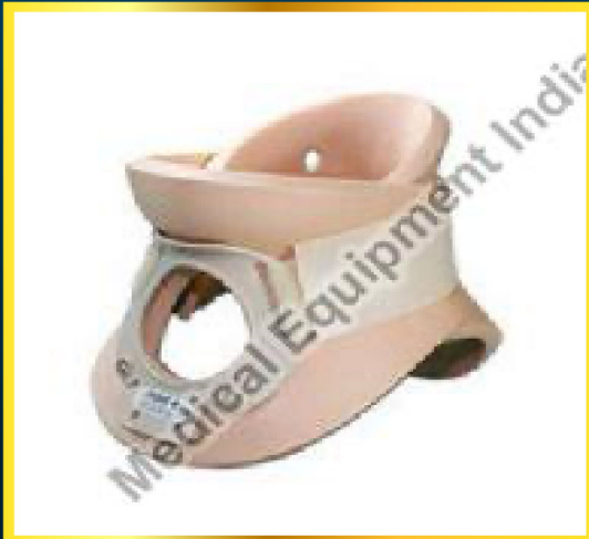
Philadelphia Cervical Collar