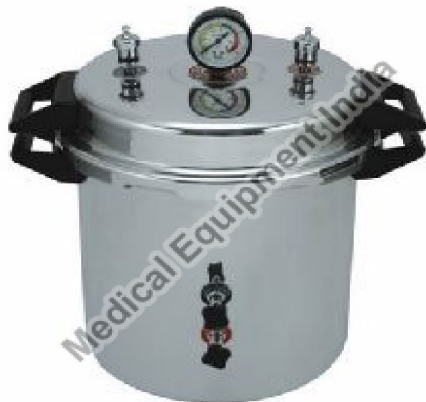
Autoclave Pressure Cooker