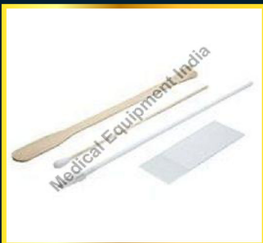
Pap Smear Kit