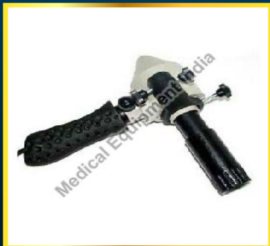
Direct Halogen Spot Light