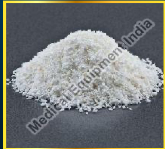
10cc G-Graft Granules