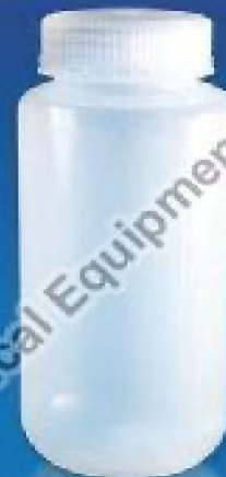
Wide Mouth Bottles