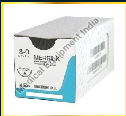
Mersilk Surgical Suture