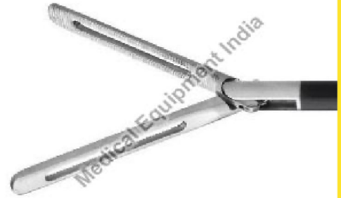
Long Bowel Grasper