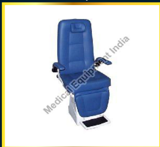
ENT Examination Chair