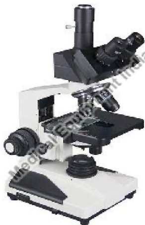
Trinocular Research Microscope