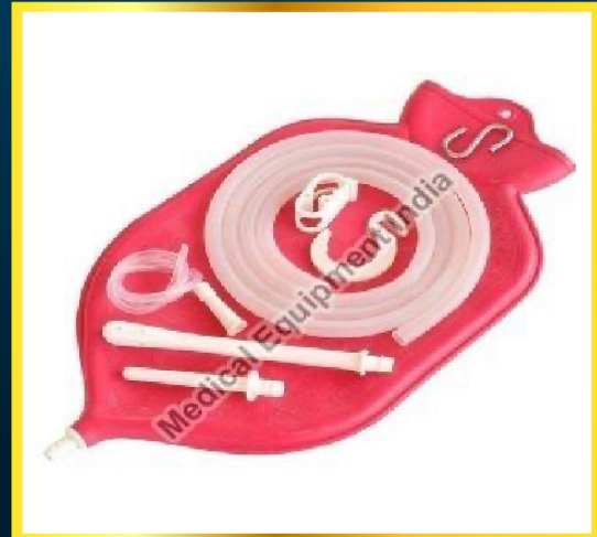
Enema Bag Kit