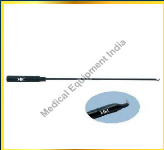
Laparoscopic L Hook