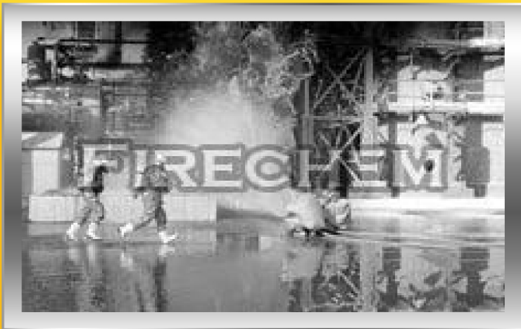
Purple K Powder