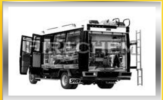
Water Mist Tender