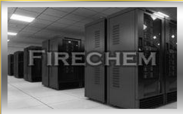
Clean Agent Fire Extinguisher