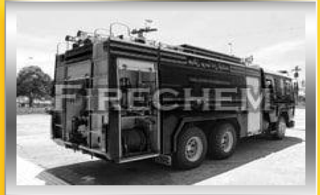
Multipurpose Fire Tender