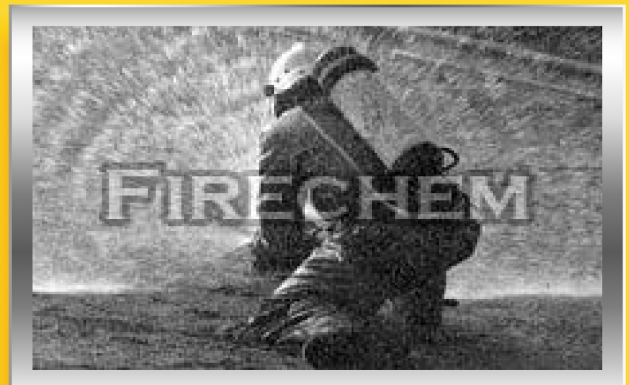
Water Mist Fire Extinguisher