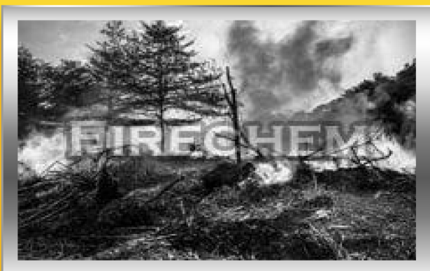
Fluorine Free Foam