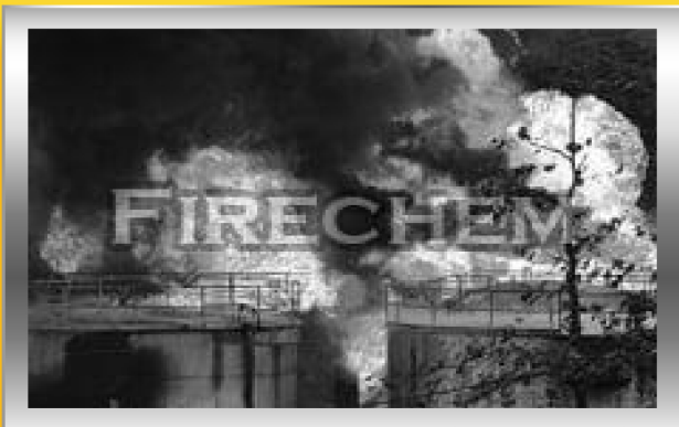
Protein & Fluoroprotein Foam