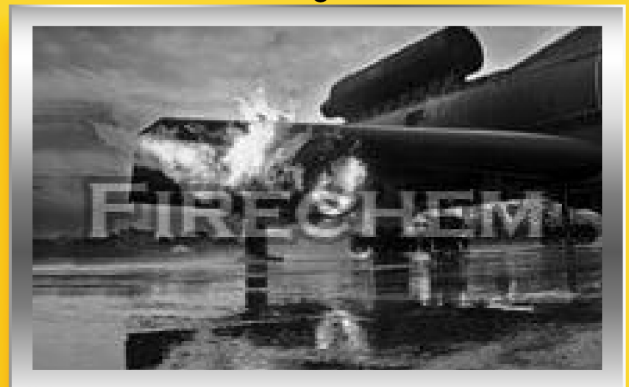
Alcohol Resistant Film-Forming FluoroProtein Foam