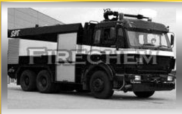
Fire Foam Tender