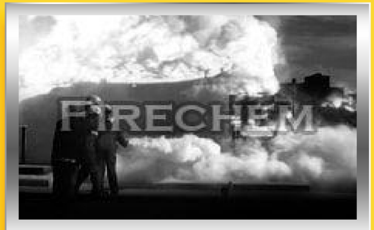
Force Fire Extinguisher Powder