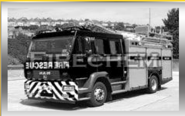
Emergency Rescue Tender