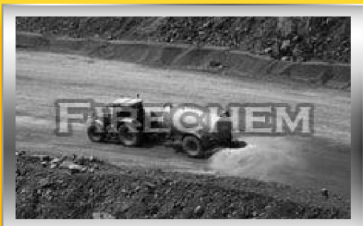
Dust Suppression Agents