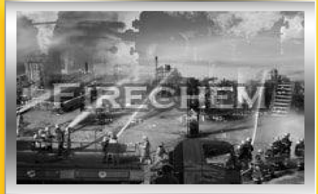
Alcohol Resistant Aqueous Film Forming Foam