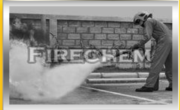
Carbon Dioxide Fire Extinguisher