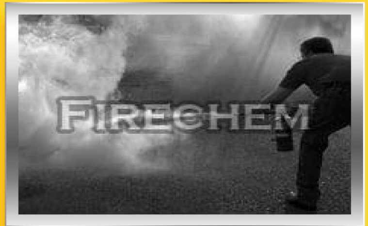
BC Dry Powder