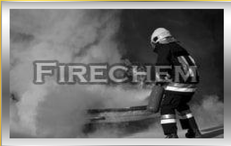
ABC Chemical Powder