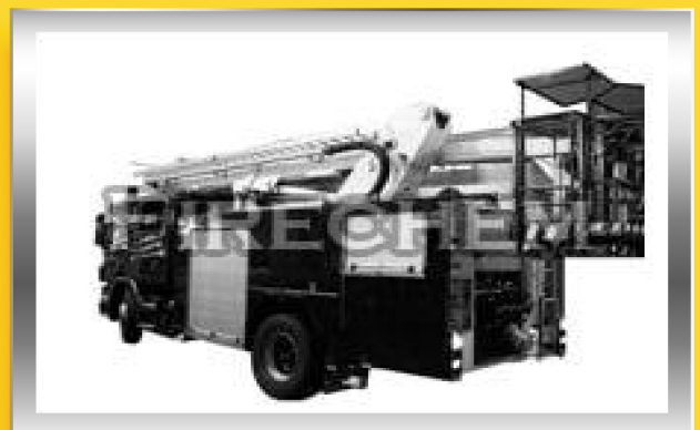
Fire Hydraulic Platform