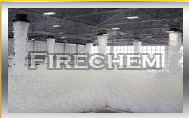
High Expansion Foam