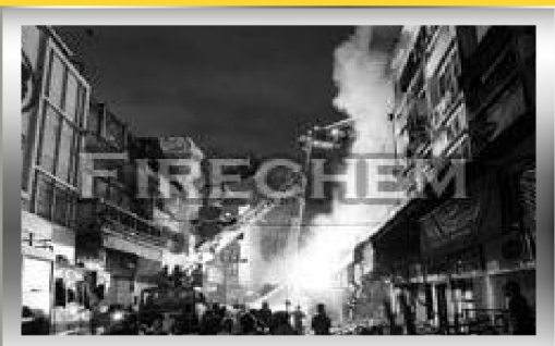
Flame Retardant Solution