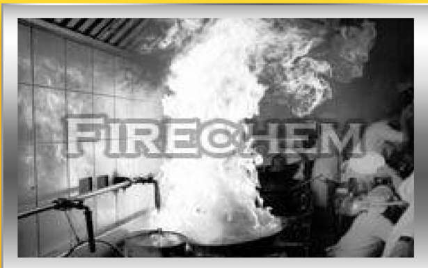
Wet Chemical Fire Extinguisher