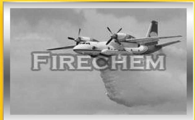
Class A Foam Concentrate