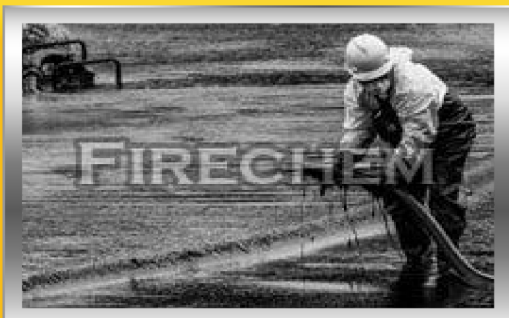
Oil Spill Dispersant