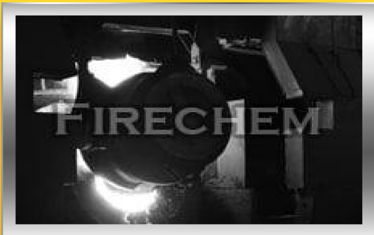
TEC Dry Powder