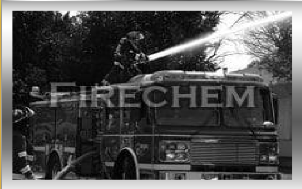
Aqueous Film Forming Foam