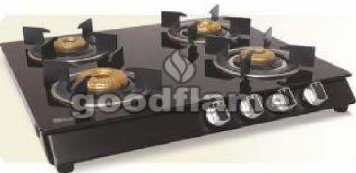
NEXA R 4 Burner Gas Stove