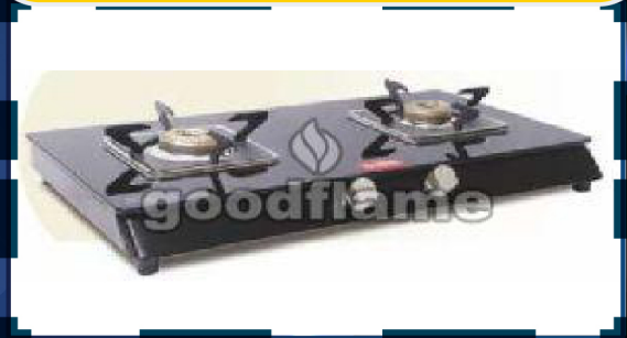
NEXA S 2 Burner Gas Stove