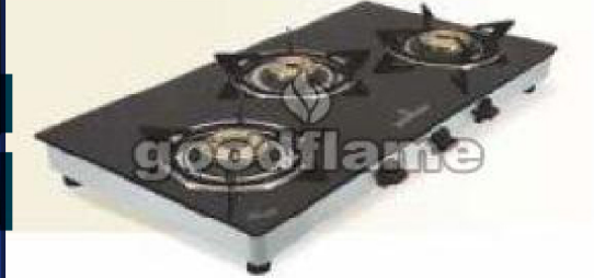
KWID SS 3 Burner Gas Stove