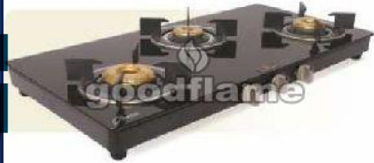
STAR R 3 Burner Gas Stove