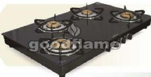
STAR 4 Burner Gas Stove