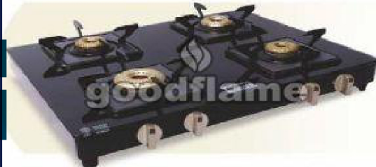
STAR S 4 Burner Gas Stove