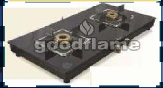
HUNK 2 Burner Gas Stove