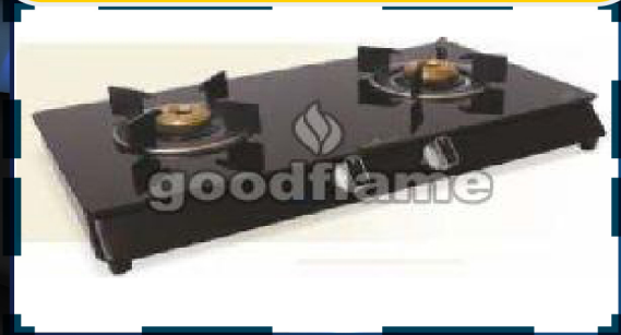
NEXA R 2 Burner Gas Stove