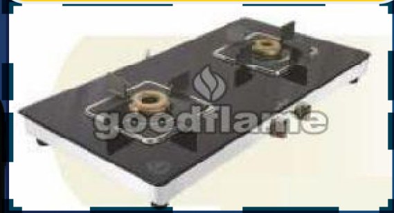
HUNK SS 2 Burner Gas Stove