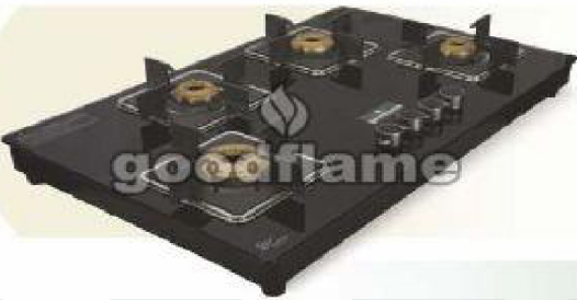
HOB TOP 4 Burner Gas Stove