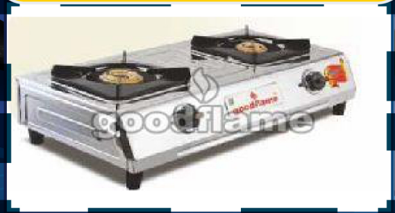
CHEF ECO 2 Burner Gas Stove