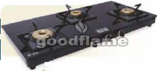
STAR S 3 Burner Gas Stove