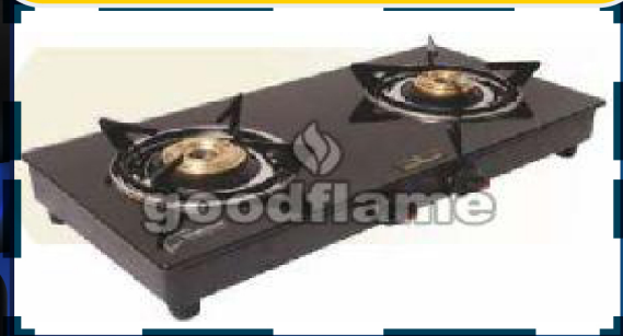
DD NANO 2 Burner Gas Stove