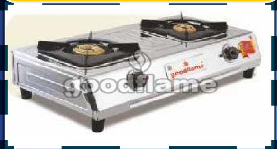
CHEF 2 Burner Gas Stove