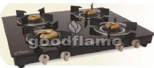
STAR R 4 Burner Gas Stove