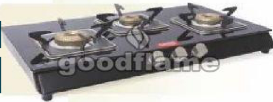
NEXA S 3 Burner Gas Stove