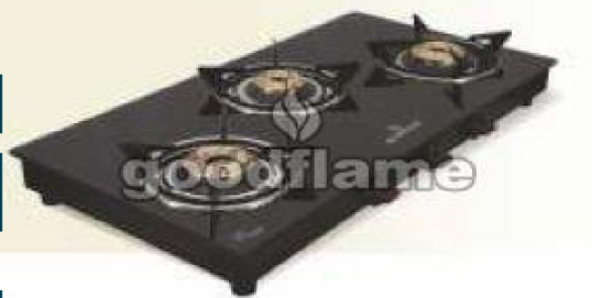
KWID 3 Burner Gas Stove