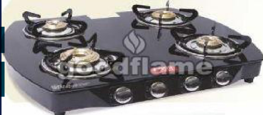
CURVE 4 Burner Gas Stove