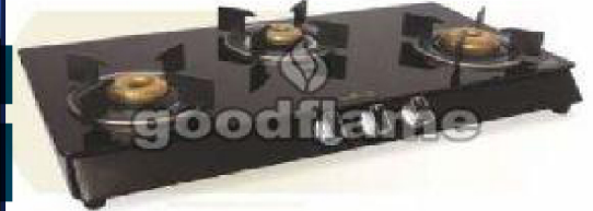
NEXA R 3 Burner Gas Stove