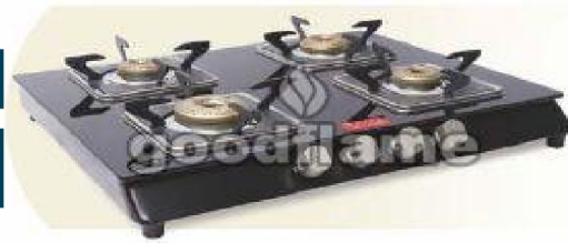
NEXA S 4 Burner Gas Stove