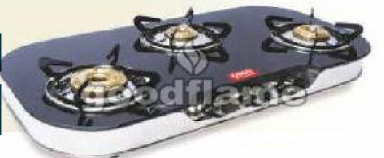
FB 3 Burner Gas Stove