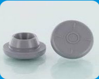
Rubber Bottle Stopper