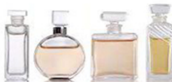
Fancy Perfume Bottle