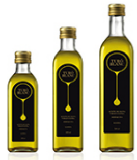
Edible Oil Bottle