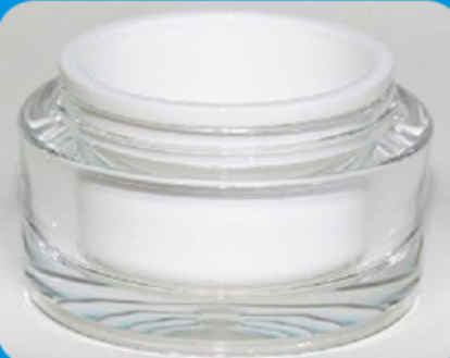
Cosmetic Glass Jar