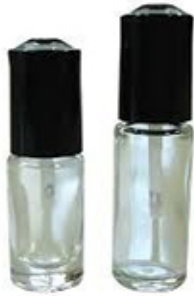
Nail Polish Bottle