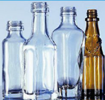
Glass Oil Bottle