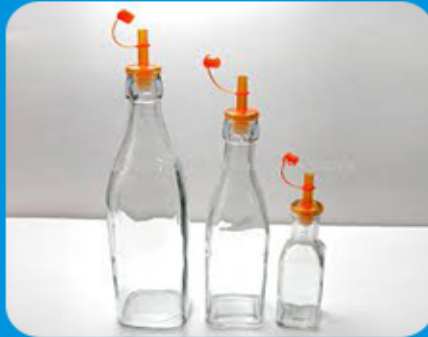
Glass Olive Oil Bottle