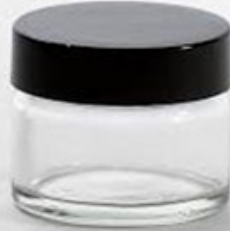
Cosmetic Cream Jar