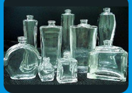
Designer Perfume Bottle