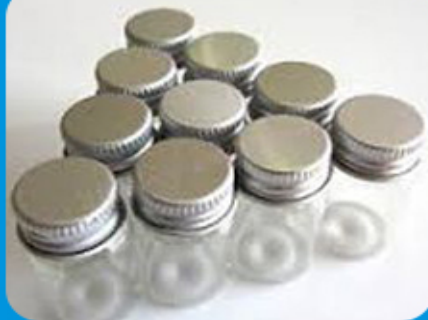
Glass Jar Lid