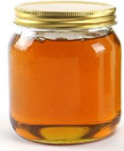
Glass Honey Jar