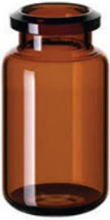
Moulded Amber Glass Vial