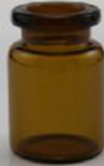
Amber Glass Vial