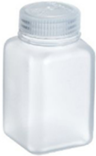
Square Glass Jar