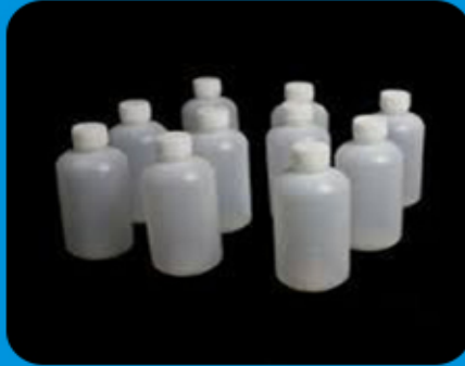
Chemical Plastic Bottle