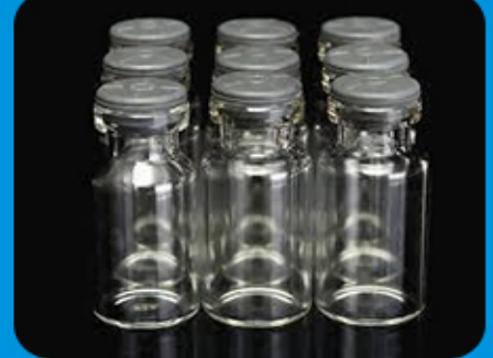
Moulded Glass Vial