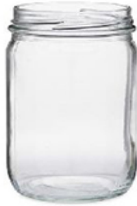
Food Glass Jar