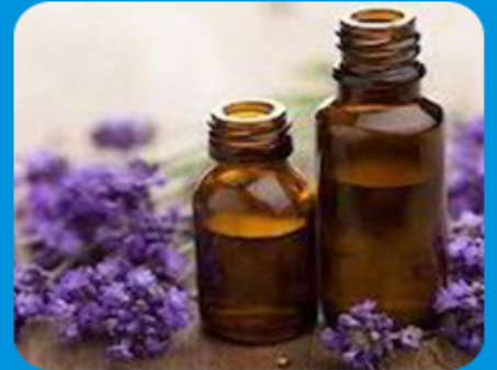
Essential Oil Bottle