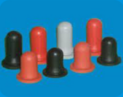
Flint Glass Vial