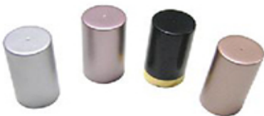
Roller Bottle Lids