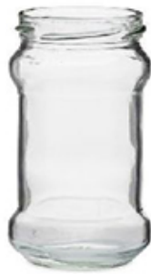
Glass Pickle Jar