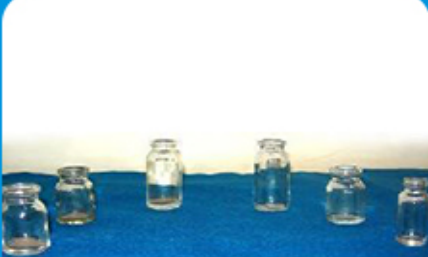
Flint Glass Vial