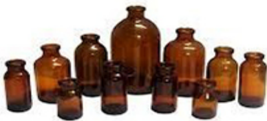
Pharma Glass Vial