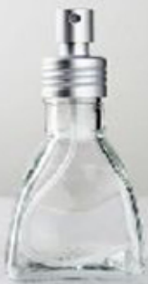
Cosmetic Spray Bottle