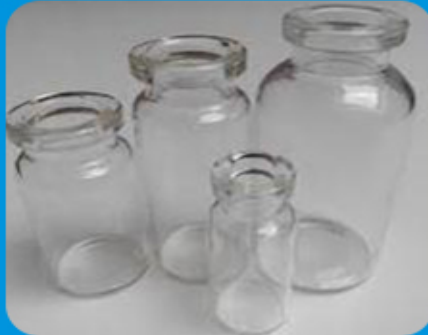
Moulded Flint Glass Vial