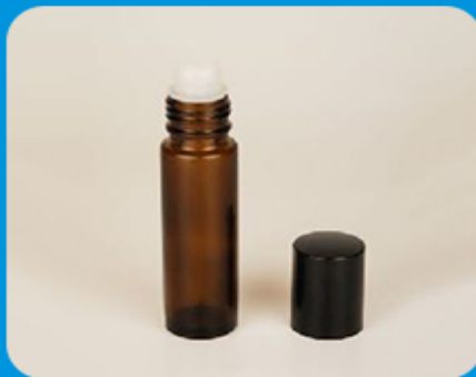
Roll On Bottle