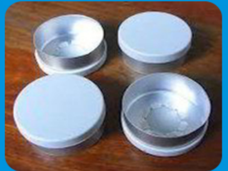
Glass Bottle Caps