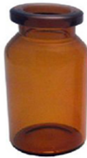
Injectable Glass Vial