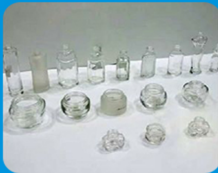
Cosmetic Glass Bottle