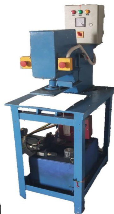
Hydraulic Sole Cutting Machine