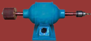
Drilling + Grinding Combination