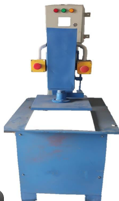
Hydraulic Sole Cutting Machine