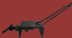
Strap Fitting Tool