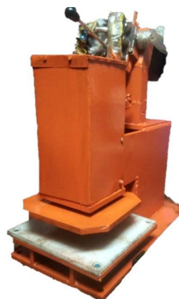
Hydraulic Sole Cutting Machine