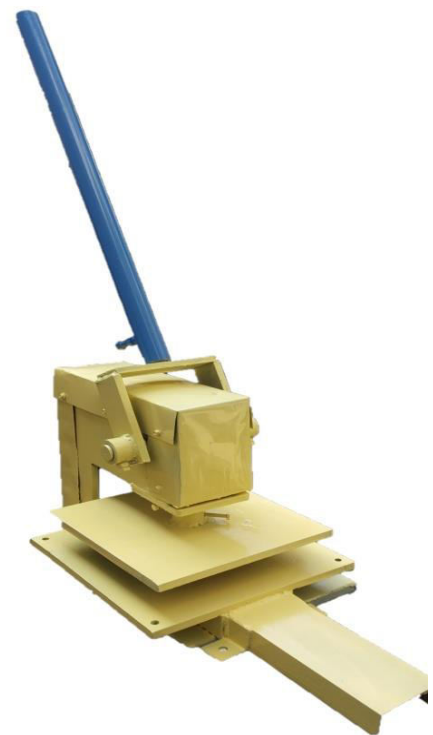
Manual Sole Cutting Machine