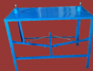
Strap Fitting Machine

Due to less service and maintenance work, the hydraulic powered machine is very popular in Slipper Manufacturing Industry. All kinds of Slippers can be made by this machine.