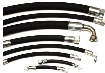
Hydraulic Hose Pipe