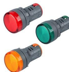
LED Light Indicator