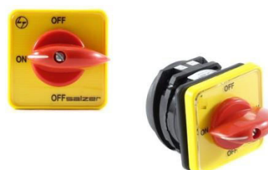
Rotary Cam Switch