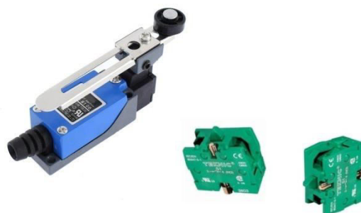
Limit Switch/ NO-NC Switch