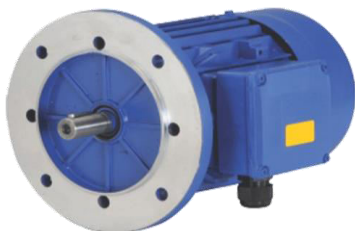
2 HP Flange Mounting Motor