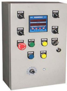
Electric Control Panel