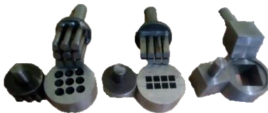
Camphor Tablet/ Slab Dies