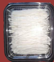
Various Types of Long Cotton Wicks

Due to less service and maintenance work, this machine is very popular for Long Cotton Wicks Manufacturing . To know more about the machine & its specifications you may please contact us.