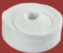
Cotton Wick Raw Material