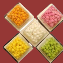
Various Types of Round Cotton Wicks

Due to less service and maintenance work, this machine is very popular for Round Cotton Wicks Manufacturing . To know more about the machine & its specifications you may please contact us.