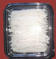
Various Types of Long Cotton Wicks

Due to less service and maintenance work, this machine is very popular for Long Cotton Wicks Manufacturing . To know more about the machine & its specifications you may please contact us.