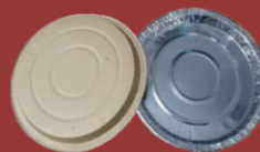
Collar Paper Thali

By this machine we can manufacture all sizes of Paper Dona, Collar Plates & Thali upto 14 Inch size.