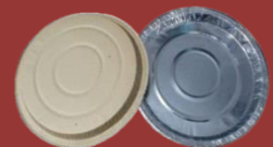
Collar Paper Thali

By this machine we can manufacture all sizes of Paper Dona, Collar Plates & Thali upto 14 Inch size.