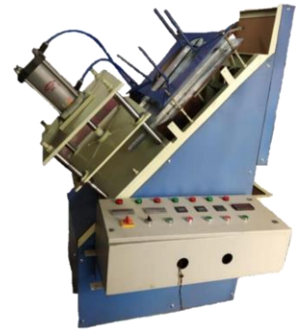
Pneumatic Fully-Automatic Single Die Paper Plate Making Machine Model: PSD-FA413