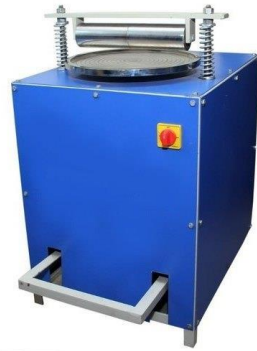
Papad Rolling Machine