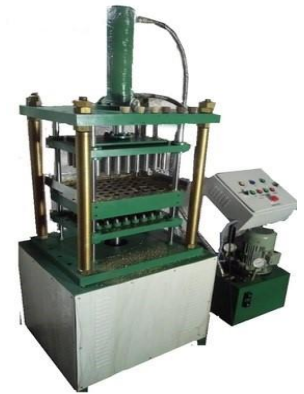
Hydraulic Powered Sambrani Cup Making Machine Model: H-SCM