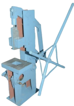
Manual Clay Kulhad & Diya Making Machine (4Ft/5Ft/6Ft)