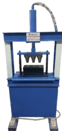
Hydraulic Powered Clay Kulhad & Diya Making Machine