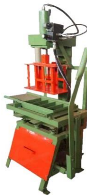
Hydraulic Powered Fly Ash Brick Making Machine