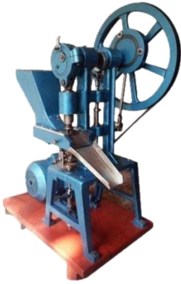
Automatic Camphor Tablet Making Machine (Mechanical)