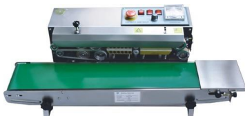
Band Sealing Machine Model: FR-90