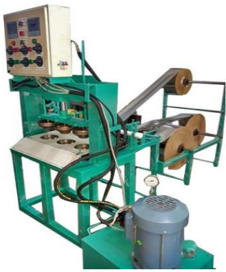
Hydraulic Fully Automatic Triple Die Paper Plate Making Machine Model: HTD-FA418