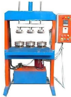
Hydraulic Semi-Automatic Triple Die Paper Plate Making Machine