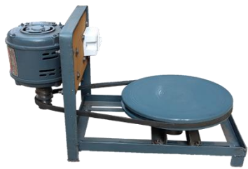
Electric Pottery Wheel Machine