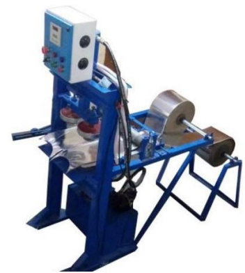
Hydraulic Fully Automatic Double Die Paper Plate Making Machine