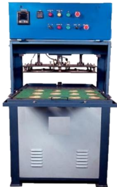
Pneumatic Blister Packing Machine Model: P-BPM