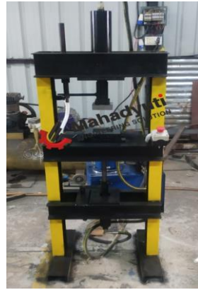
Hydraulic Powered Camphor Slab Making Machine