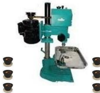
Manual Motorized Sambrani Cup Making Machine Model: M-SCM