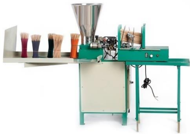
Fully Automatic Incense Stick Making Machine Model: FA-ISM