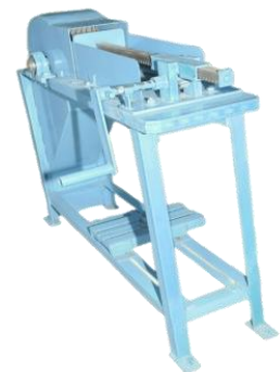
Mechanical Mortorized Clay Cutting Machine