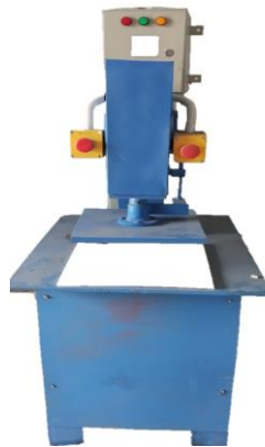
Hydraulic Powered 10 Ton Automatic Slipper Making Machine Model: H-ASM10T