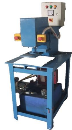
Hydraulic Powered 5 Ton Automatic Slipper Making Machine Model: H-ASM5T