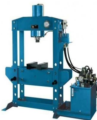
H-Type Hydraulic Press