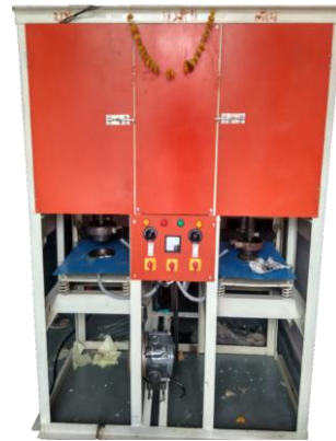
Fully Automatic Double Die Paper Plate Making Machine (Mechanical)