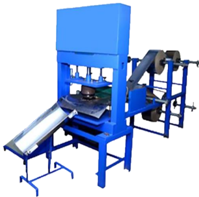
Hydraulic Fully Automatic Single Die Wrinkle Paper Plate Making Machine Model: HSD-WP-FA418