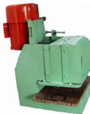
Mechanical Powered 5 Ton Lever Type Slipper Making Machine Model: M-LSM15T