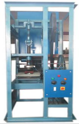
Fully Automatic Single Die Paper Plate Making Machine (Mechanical)