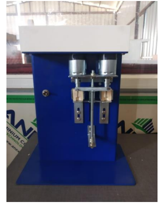
Semi-Automatic Round Cotton Wick Making Machine