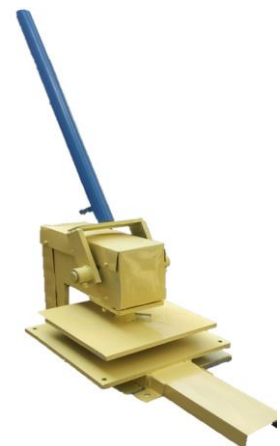
Manual Hand Press Manual Slipper Making Machine Model: M-LSMVT