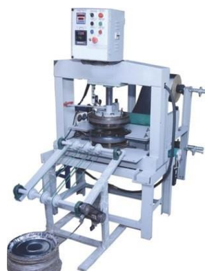
Hydraulic Fully Automatic Single Die Paper Plate Making Machine