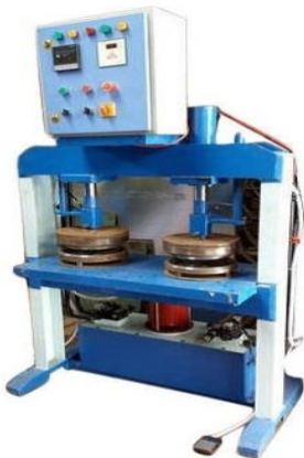
Hydraulic Double Die Double Cylinder Paper Plate Making Machine