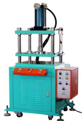
4 Pillar Hydraulic Press