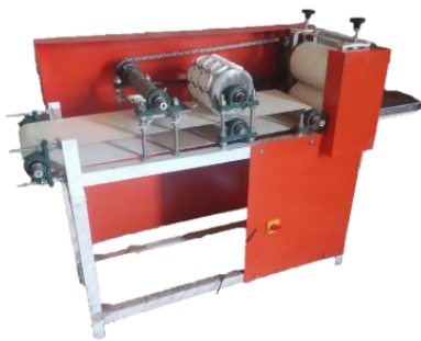
Automatic Panipuri Making Machine