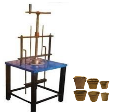
Manual Hand Press Cow Dung Pot Making Machine Model: M-CDPM