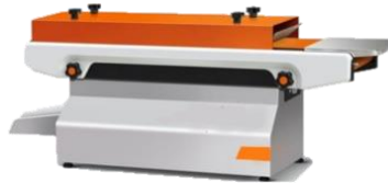
Semi-Automatic Long Cotton Wick Making Machine