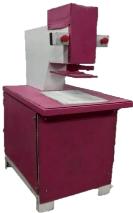
Hydraulic Powered 15 Ton Automatic Slipper Making Machine Model: H-ASM15T