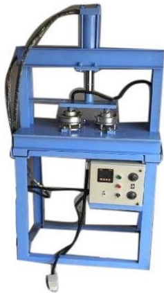
Hydraulic Semi-Automatic Double Die Paper Plate Making Machine