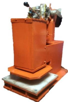
Hydraulic Powered 5 Ton Lever Type Slipper Making Machine Model: H-LSM5T