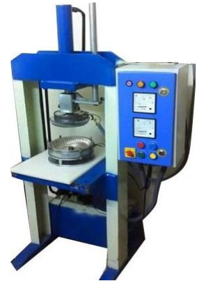
Hydraulic Semi-Automatic Single Die Paper Plate Making Machine