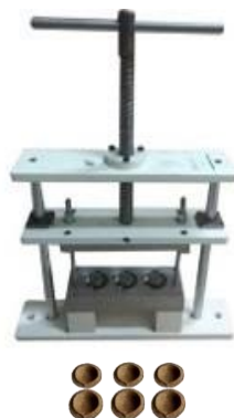
Manual Hand Press Cow Dung Diya Making Machine Model: M-CDDM