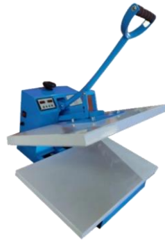
Manual Blister Packing Machine Model: M-BPM