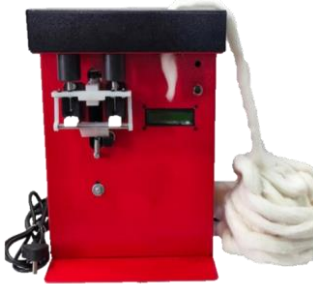
Round Cotton Wick Making Machine with Digital Counting Meter