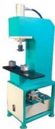
C-Type Hydraulic Press