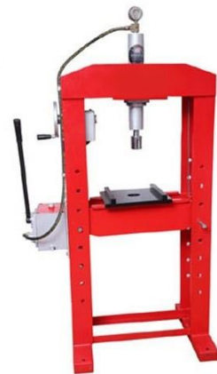
Manual Hydraulic Press